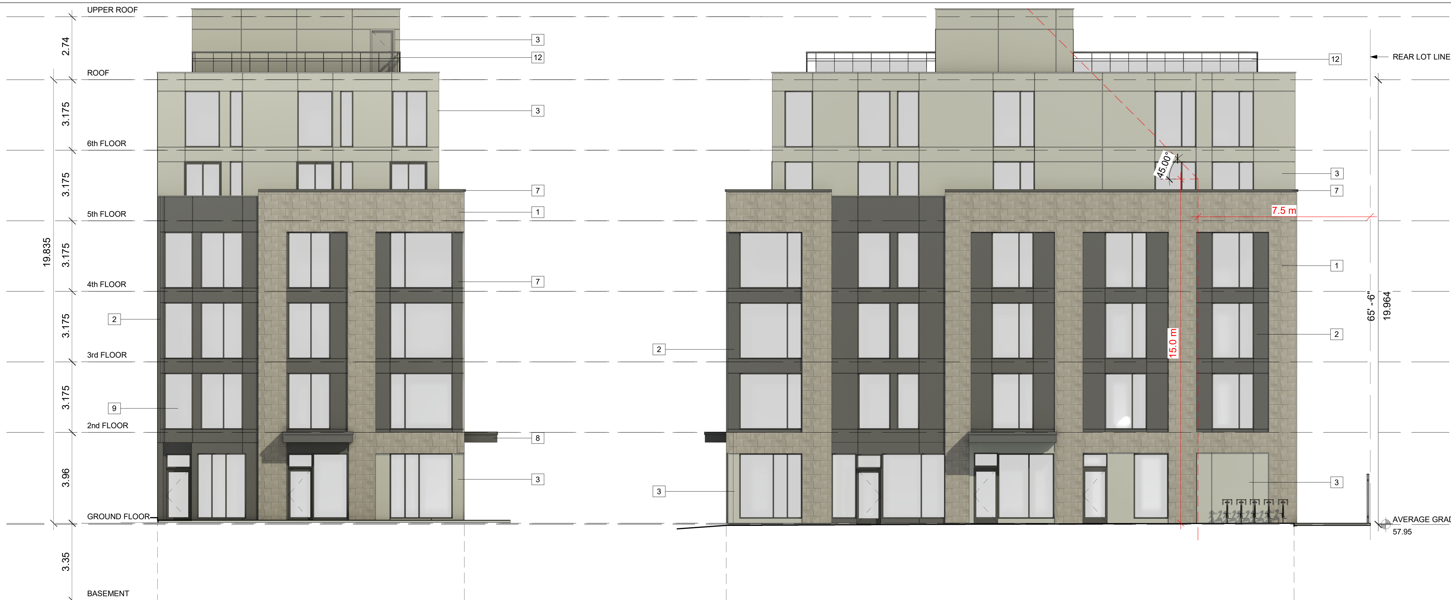
1 East (Front) Elevation 1:100