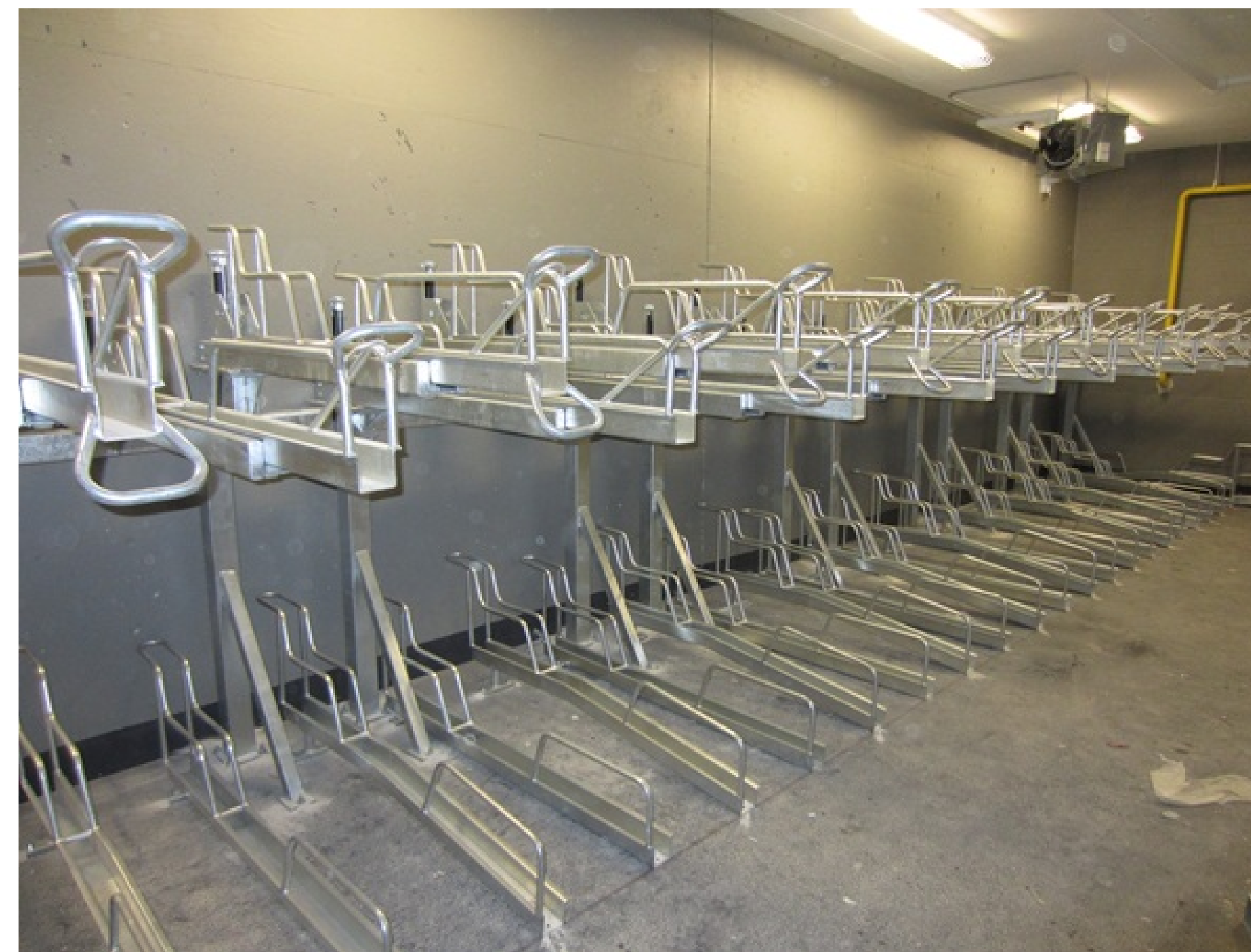
STACKABLE BICYCLE PARKING @ BASEMENT LEVEL