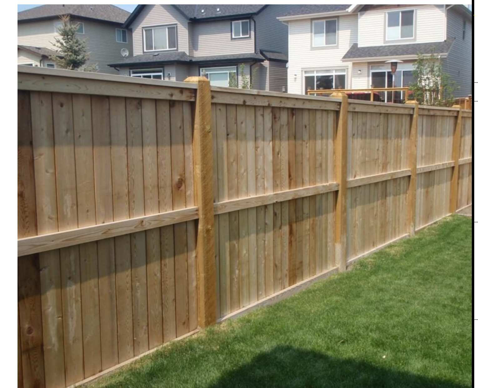
SAMPLE PRESSURE TREATED FENCE