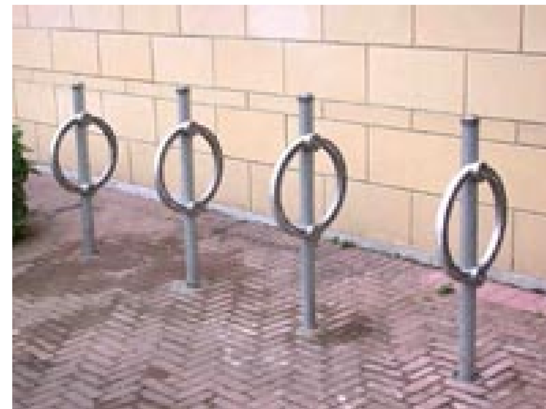
EXTERIOR BICYCLE PARKING @ GRADE