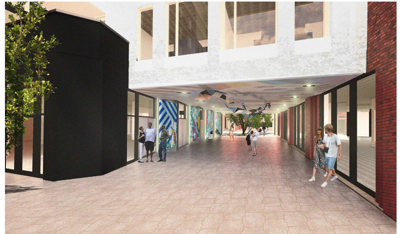
Vignette showing the Art Space and Pedestrian Underpass