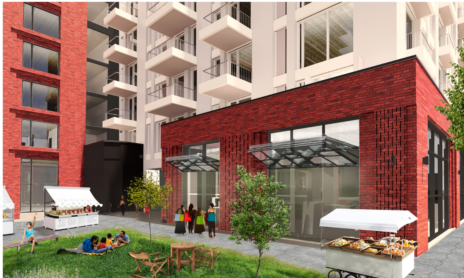
Vignette showing the Market Concept

Another unique element that has been planned, is a designated space for art. The art space has exterior access from the east lane and on the west side next to the park with a feature wall along the exterior pedestrian passage. This feature wall within the exterior passage is envisioned as a sawtooth wall with solid fins and glazed windows to allow for a seamless transition between the interior space and the exterior passage that can house art exhibitions, murals, and feature lighting.