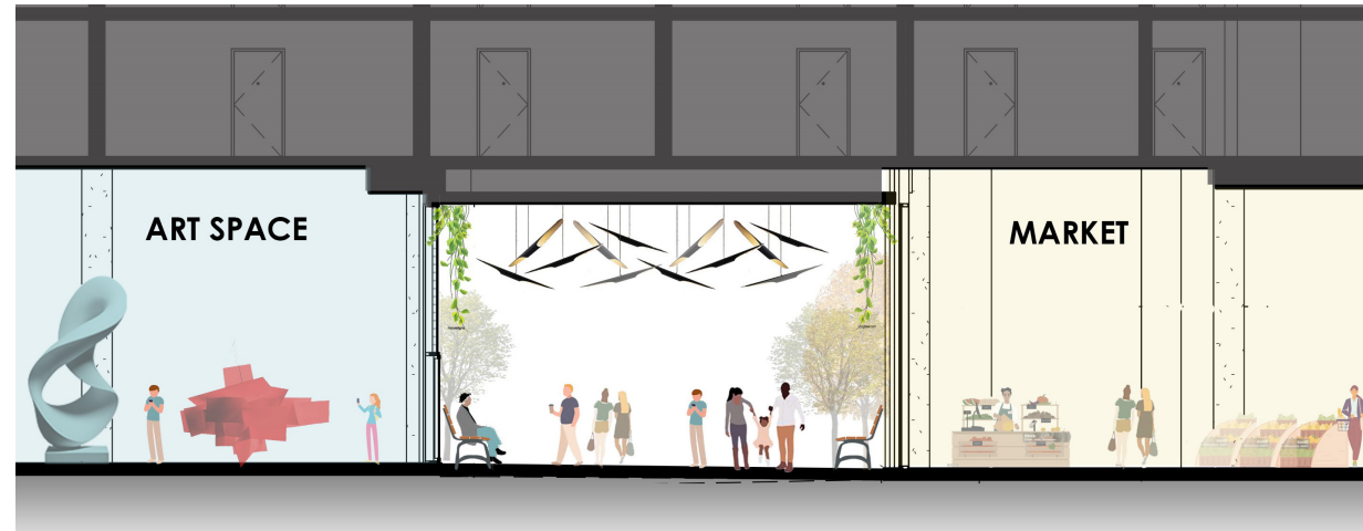
Section Showing the Art Space and Exterior Passage