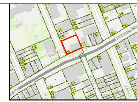
725 SOMERSET STREET.: KEY MAP