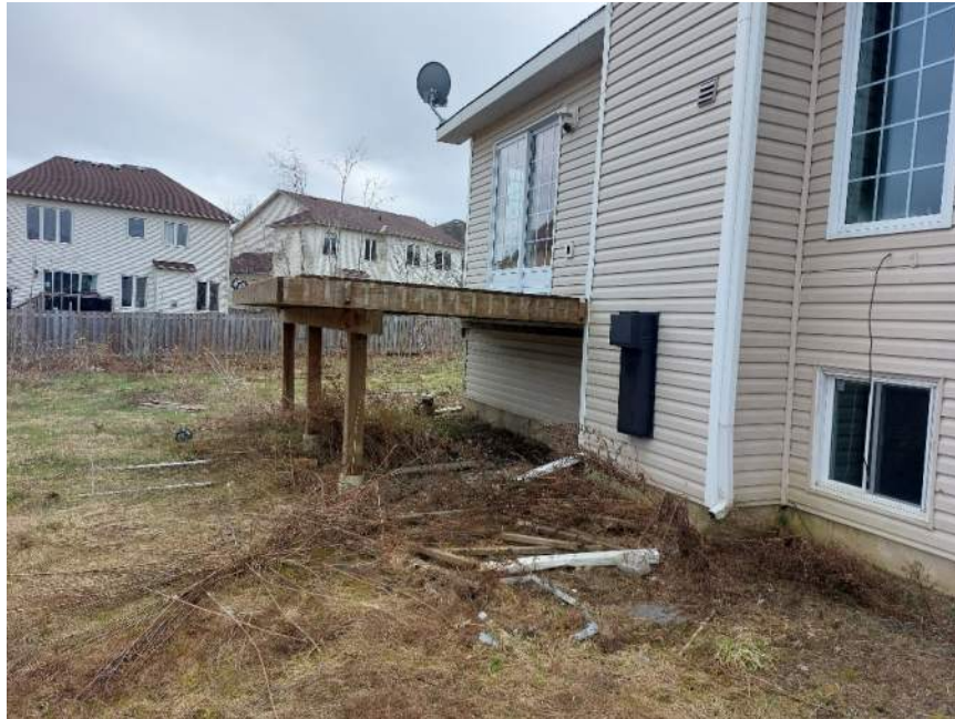
Photograph No. 5