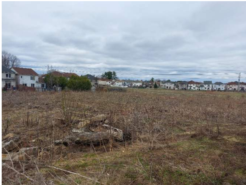
Photograph No. 2

View of the north half of the site looking northeast.