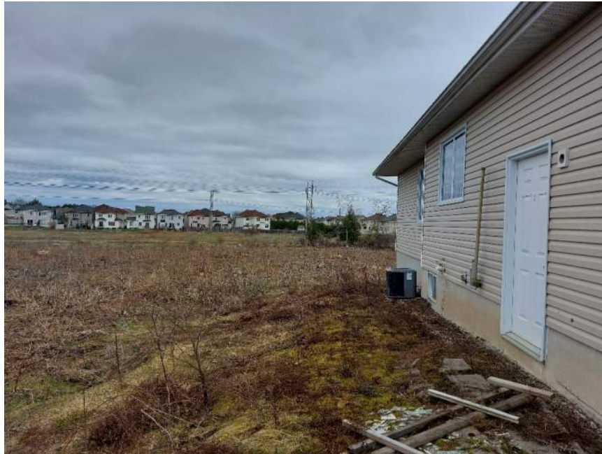
Photograph No. 3

View of the north side of the building and the northeast part of the site looking east.