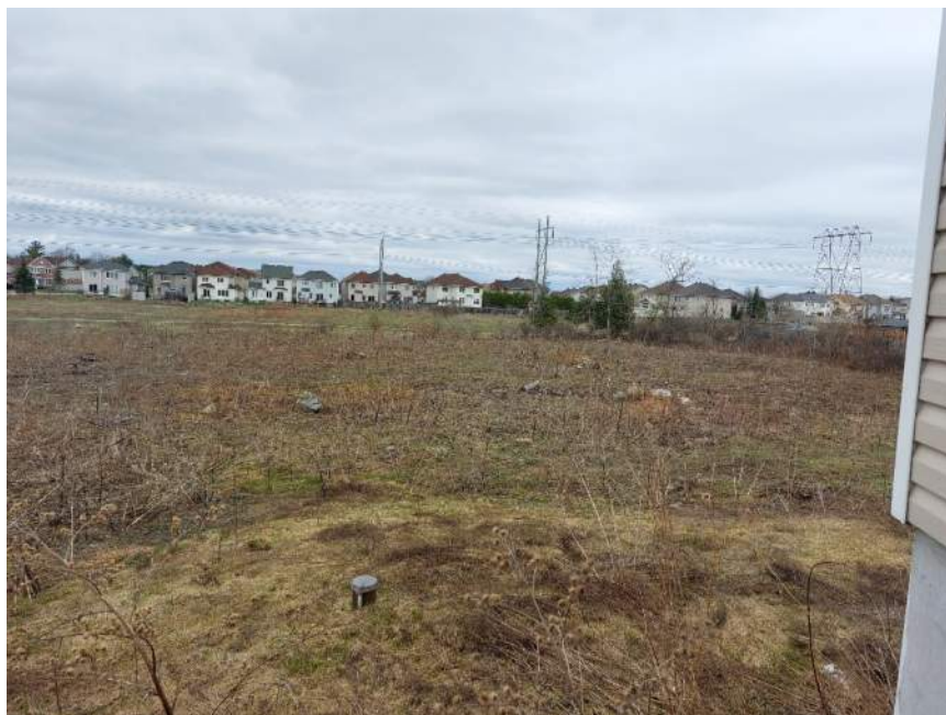
Photograph No. 4

View of the north side of the building and the northeast part of the site looking east.