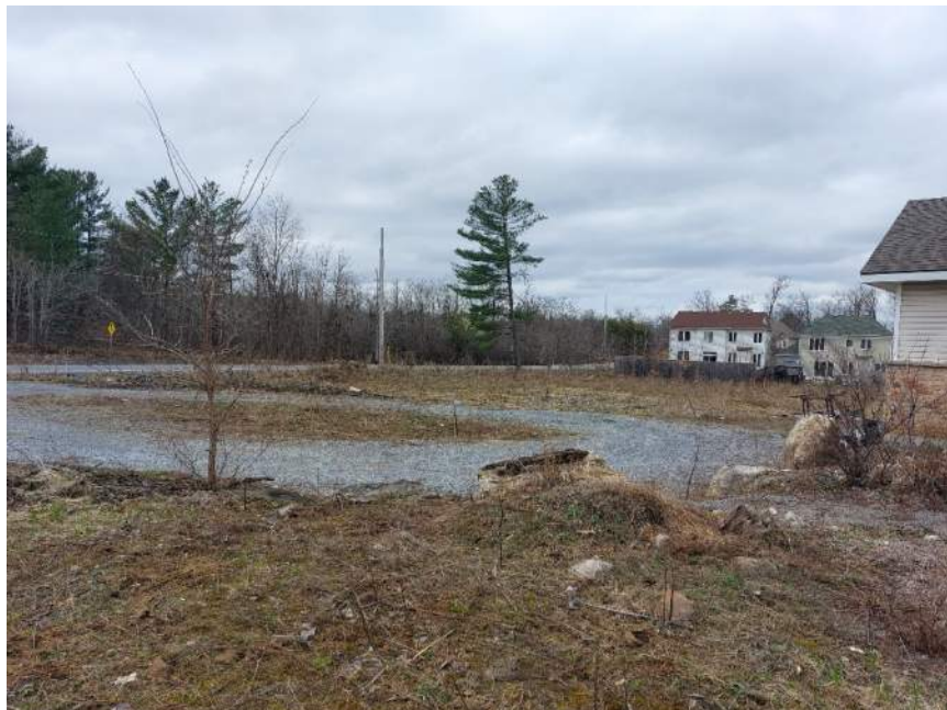
Photograph No. 8

View of the southwest part of the property.