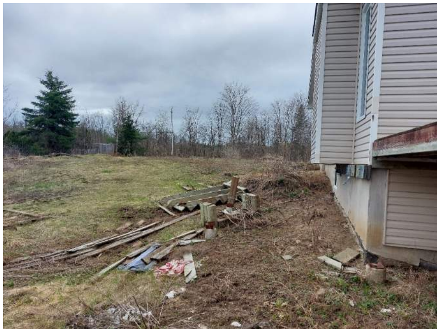
Photograph No. 6

View of the south side of the building and property