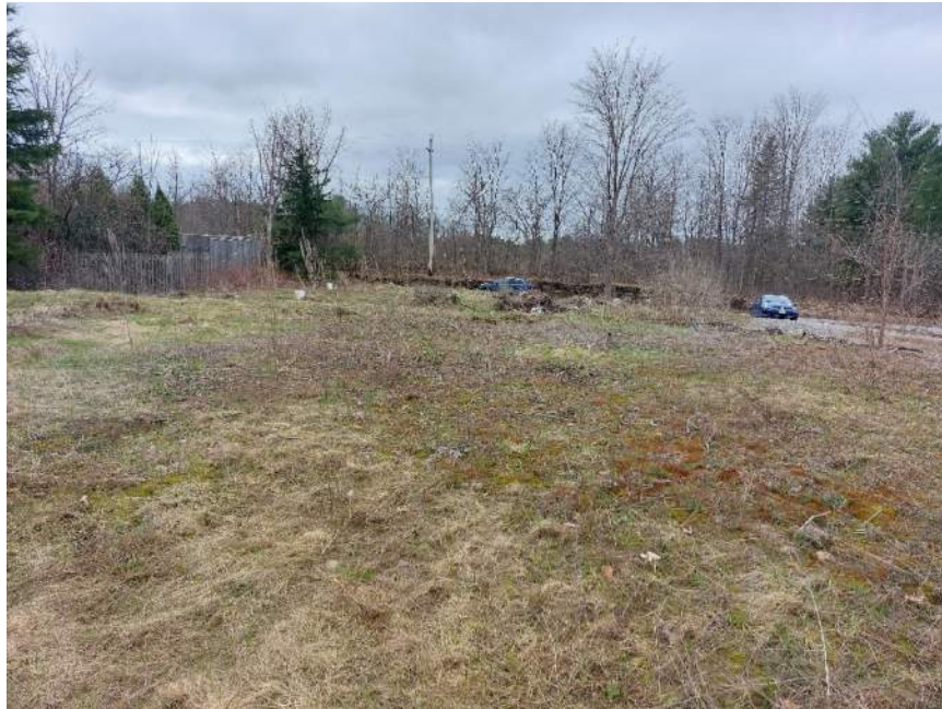
Photograph No. 7

View of the southwest part of the property.