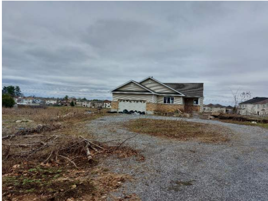
Photograph No. 1