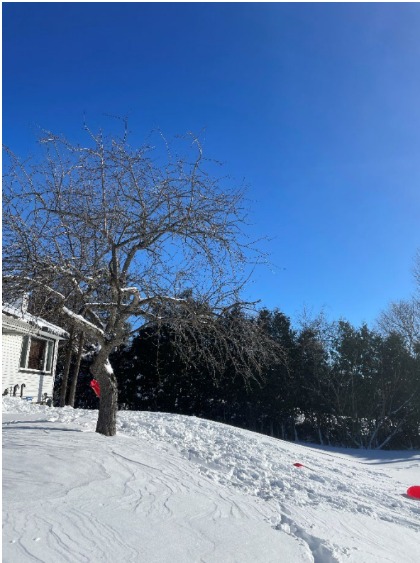
Figure 2: Tree 3, crabapple on adjacent property to be retained, some light pruning may be required