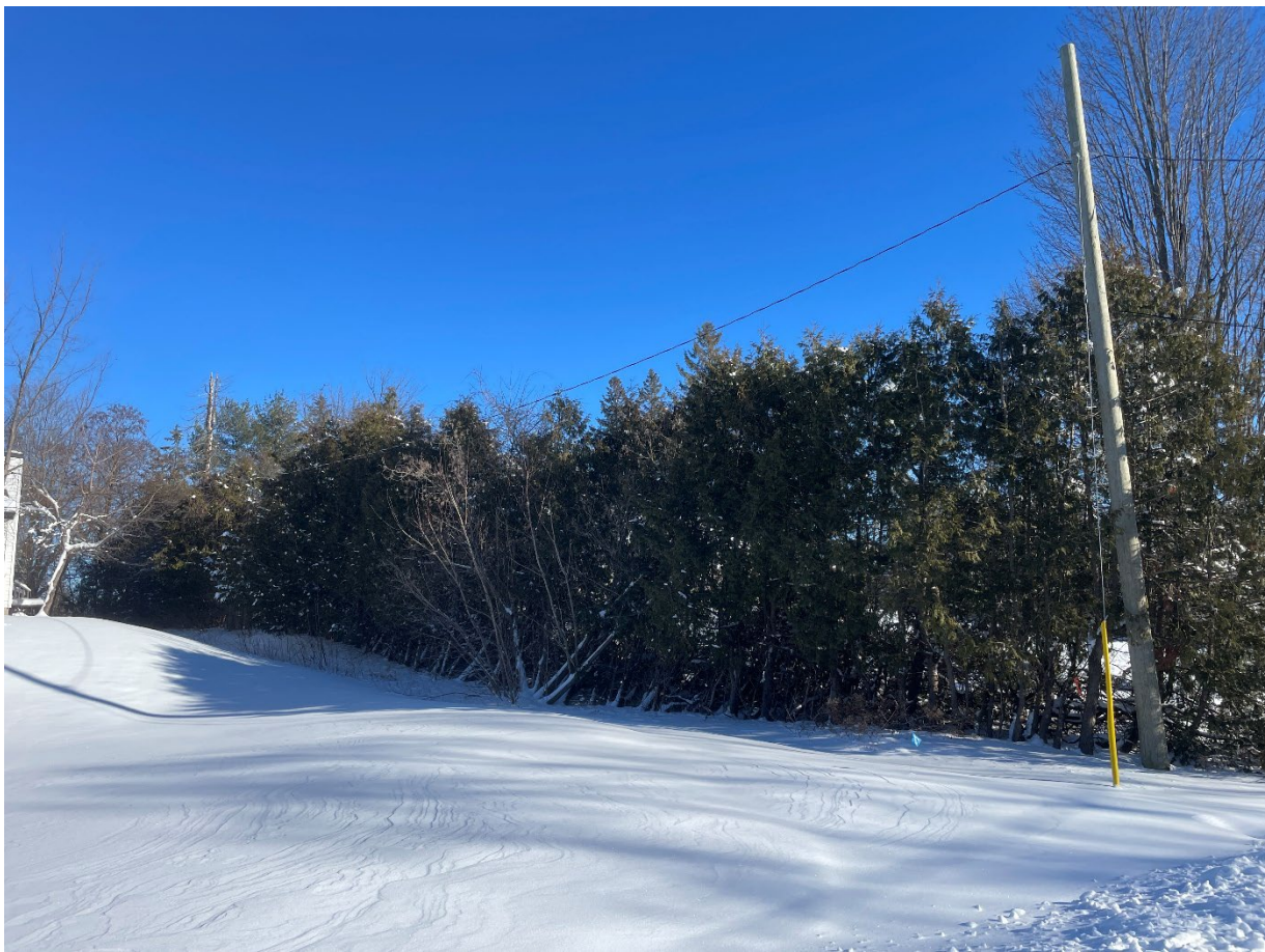
Figure 1: Cedar hedge along the southern property line with Manitoba maple visible in the middle