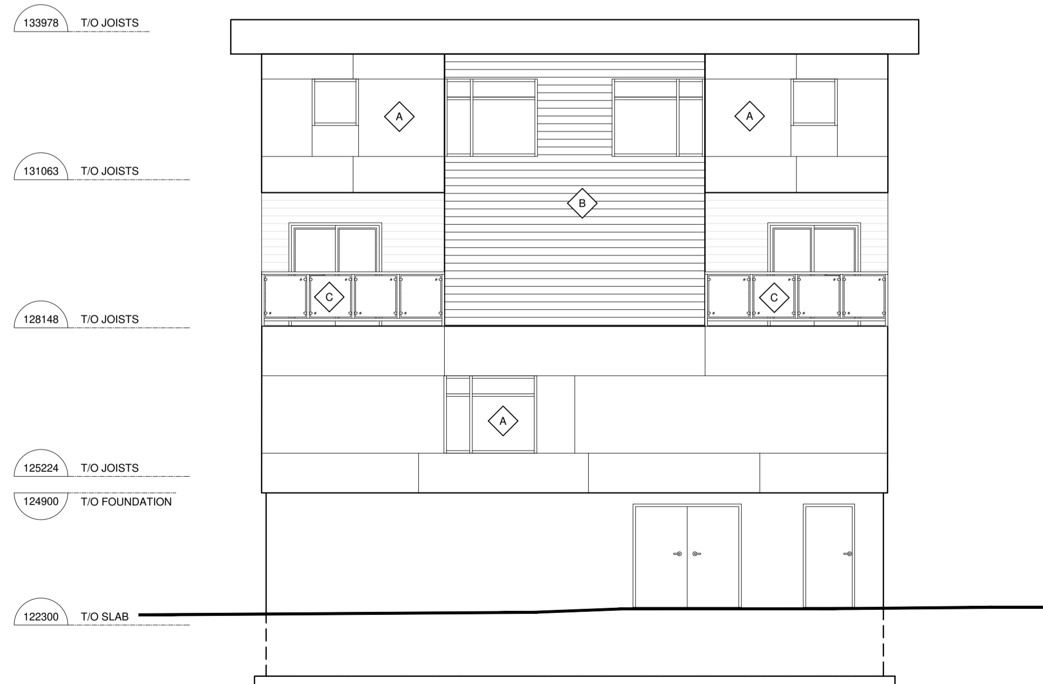
2 South Elevation A5 Scale = 1:75