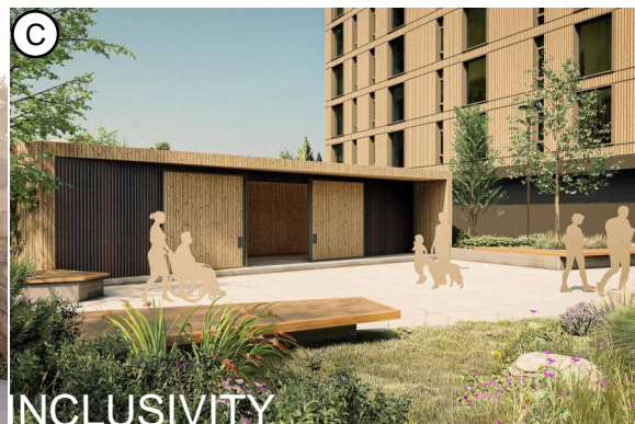
INCLUSIVITY Accessible for users of all ages and abilities. Unobstructed views from internal and external streets, walkways, and buildings, are maintained.