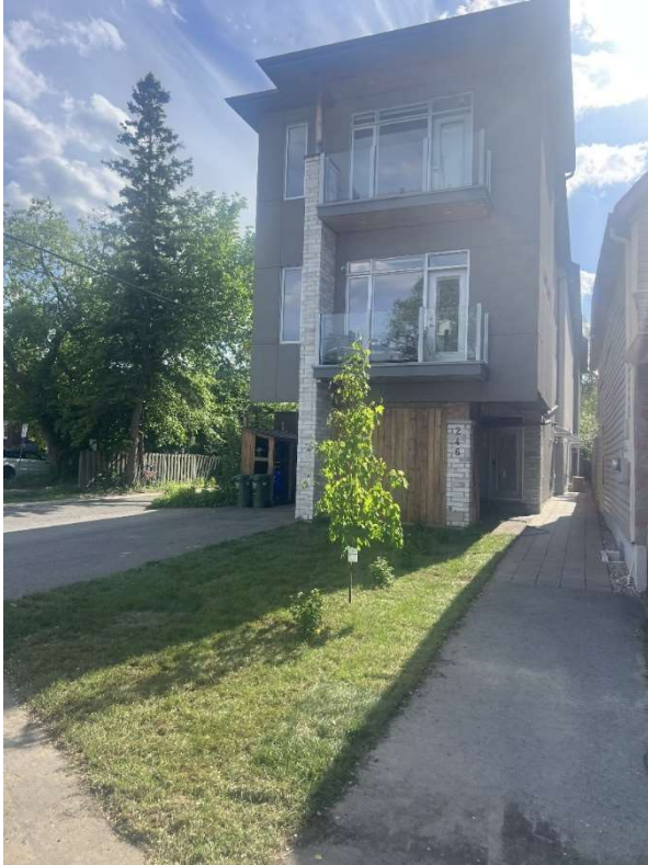
Existing front view