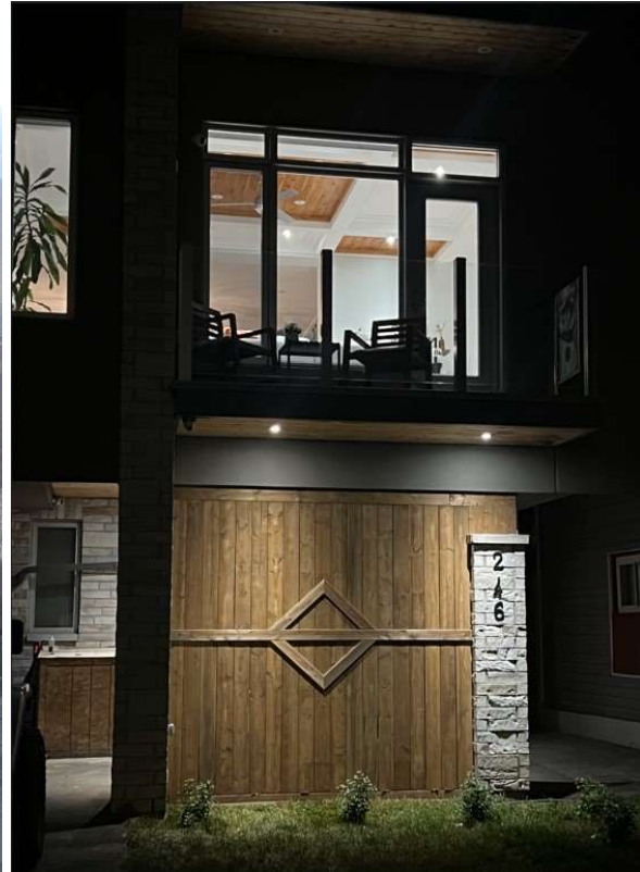
Night view at screen