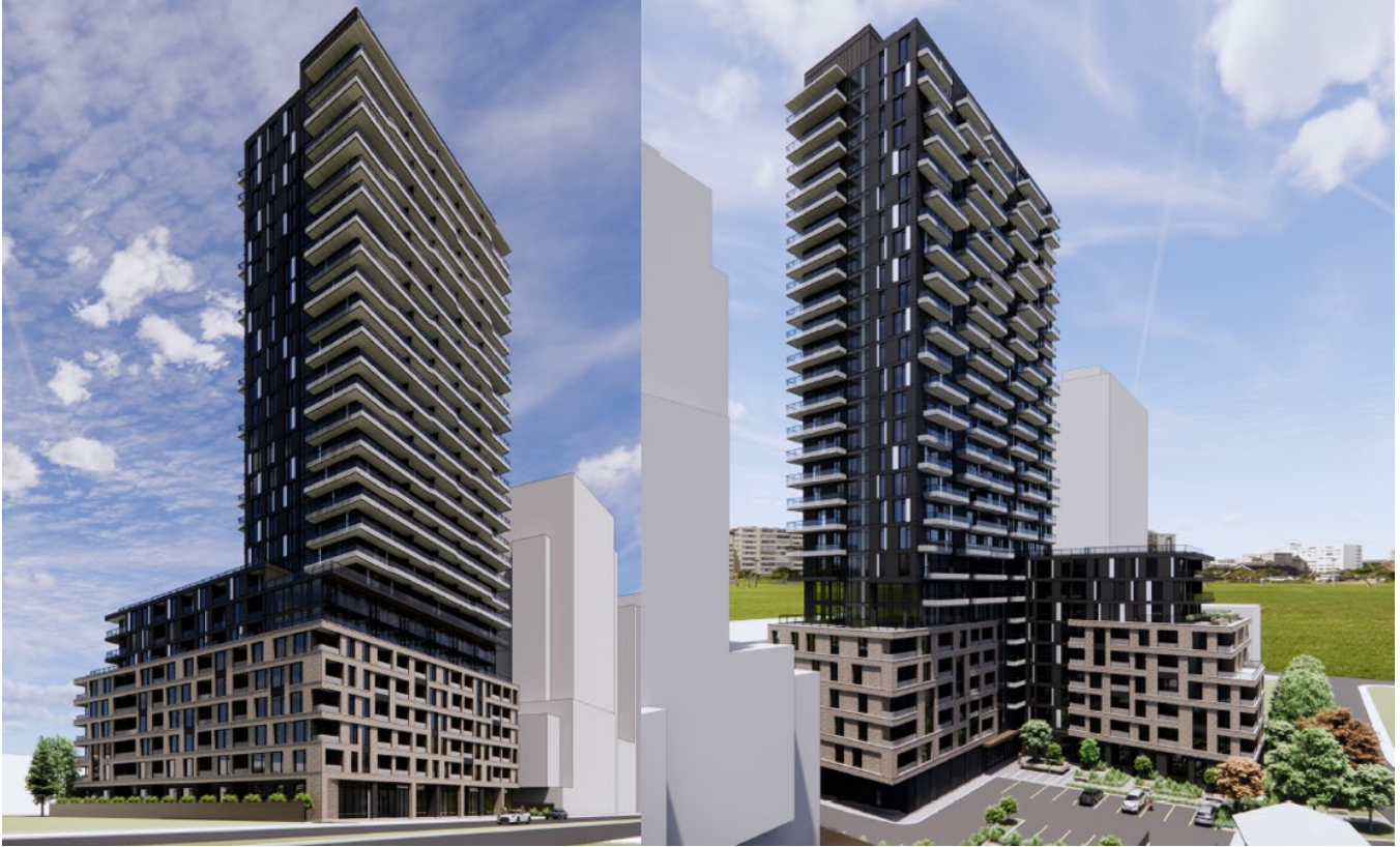
Figure 2: Perspective Renderings.