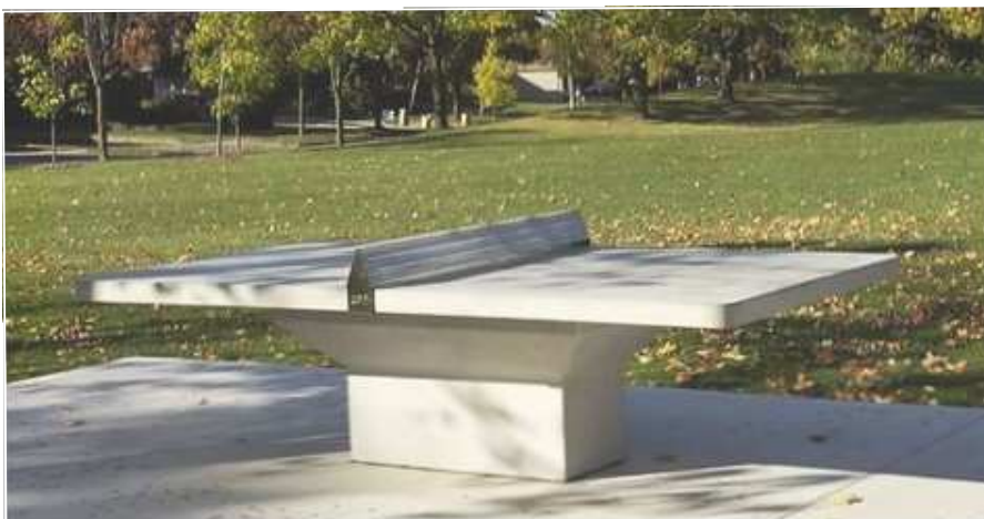
CONCRETE PING PONG TABLE