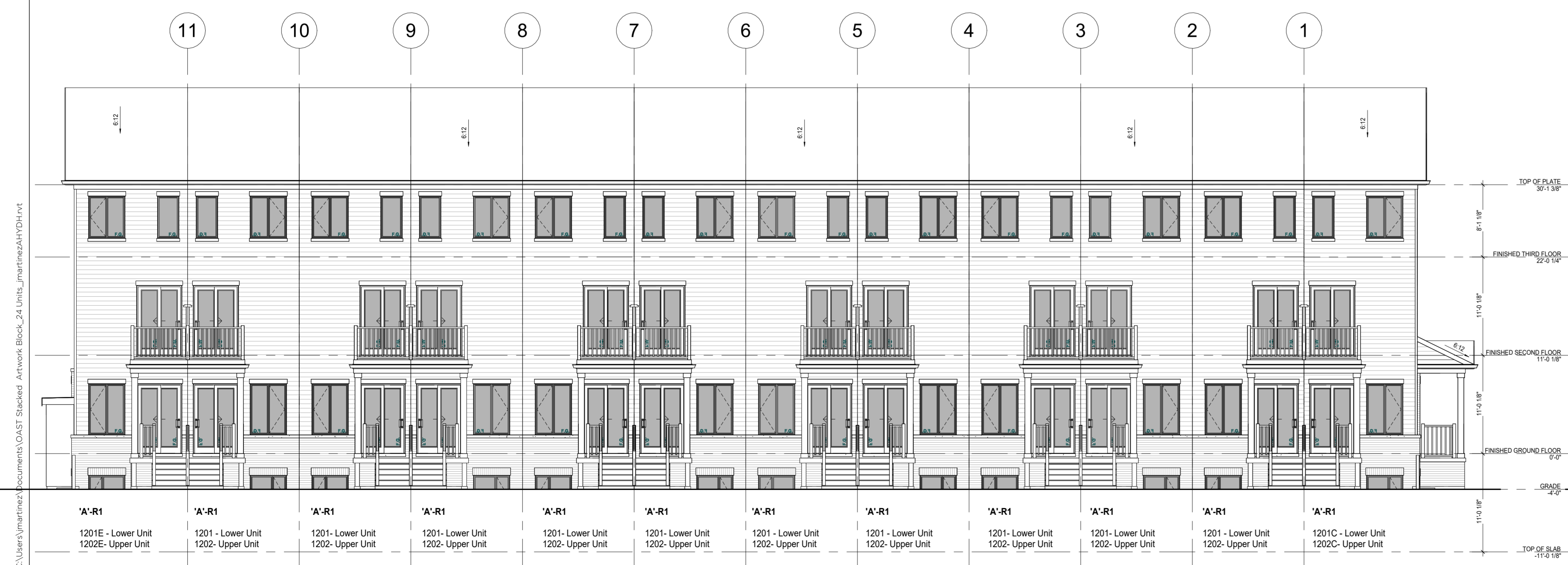
2 24 UNIT BLOCK - REAR ELEVATION 1/8" = 1'-0"