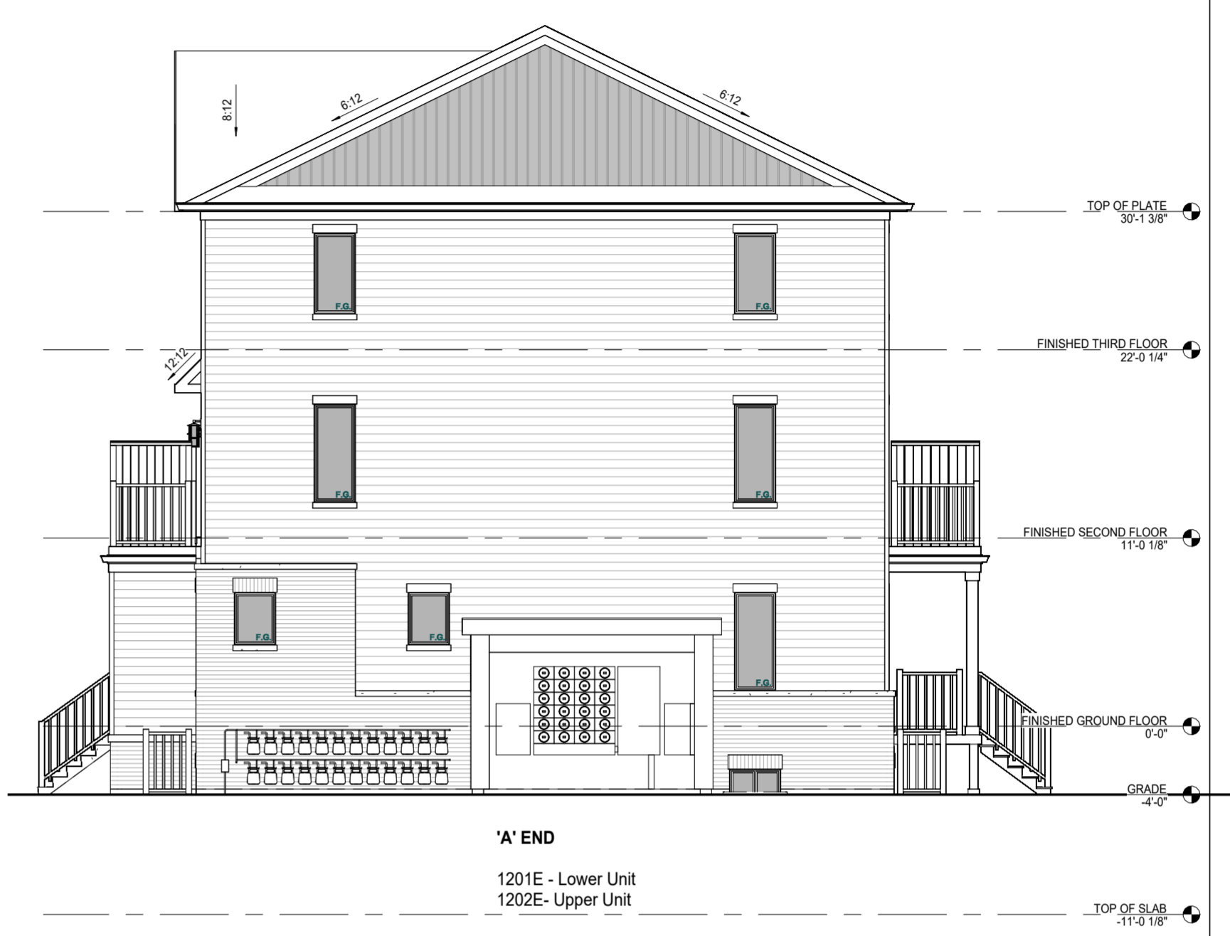
4 24 UNIT BLOCK - RIGHT ELEVATION 1/8" = 1'-0"