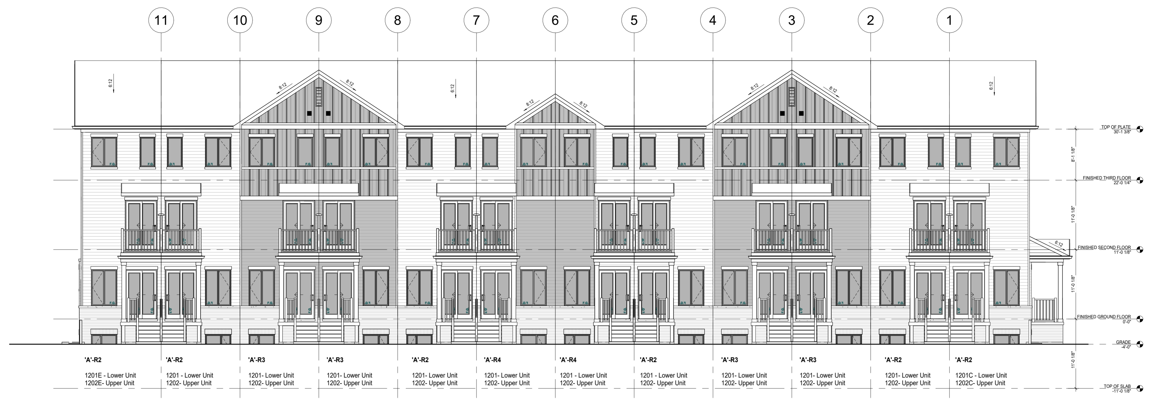
① 24 UNIT BLOCK - UPGRADE REAR ELEVATION OPTION 1 1/8" = 1'-0"

Q4 Architects Inc. retains the copyright in all drawings, plans, sketches, and all digital information. They may not be copied or used for any other projects or purposes or distributed without the written consent of Q4 Architects Inc.