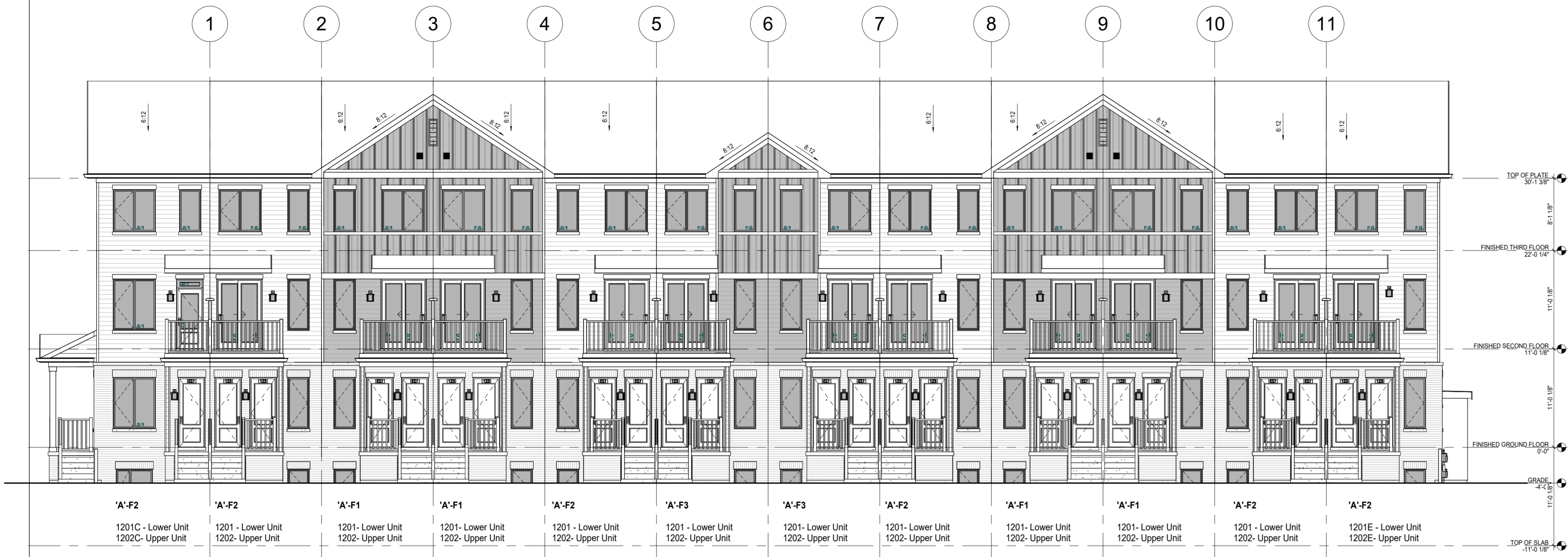
1 24 UNIT BLOCK - FRONT ELEVATION 1/8" = 1'-0"

Q4 Architects Inc. retains the copyright in all drawings, plans, sketches, and all digital information. They may not be copied or used for any other projects or purposes or distributed without the written consent of Q4 Architects Inc.