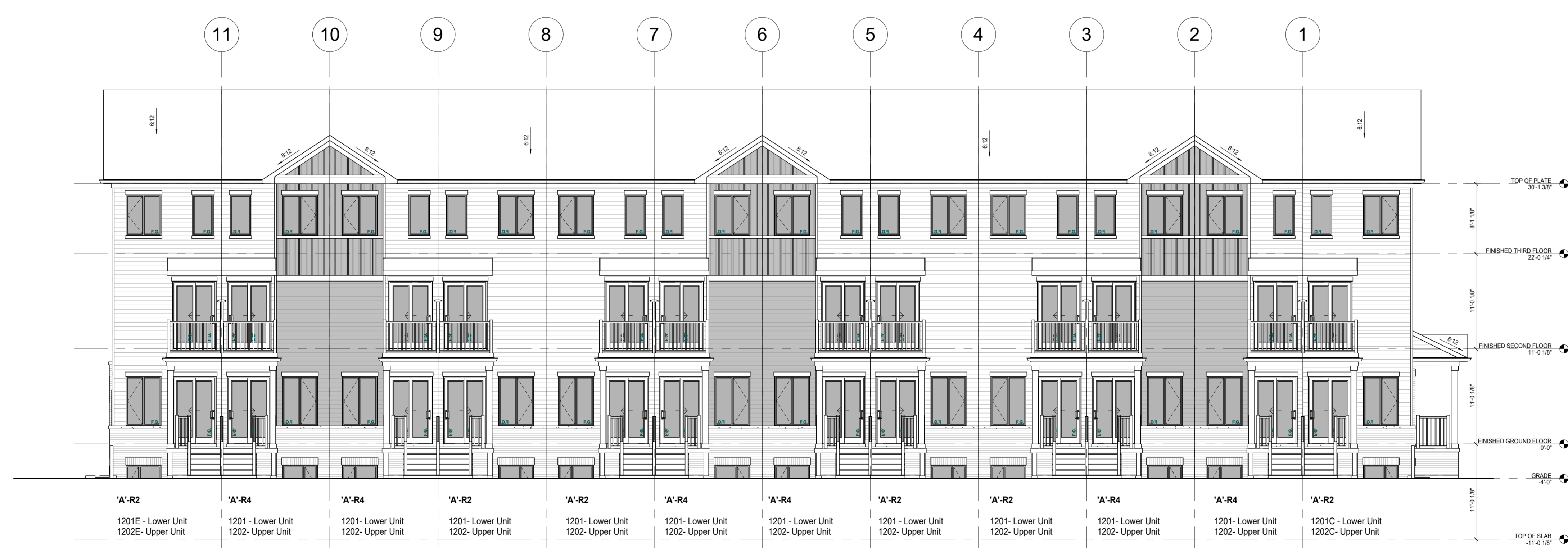
② 24 UNIT BLOCK - UPGRADE REAR ELEVATION OPTION 2 1/8" = 1'-0"