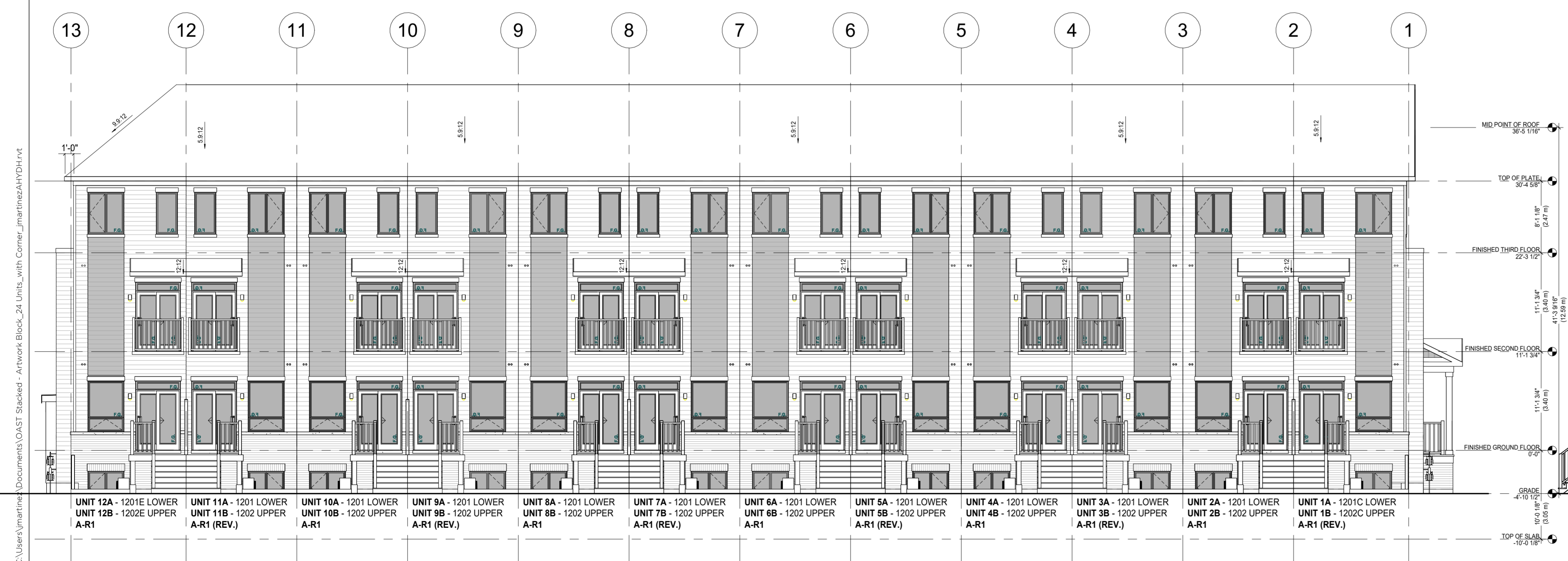
3 24 UNIT BLOCK - REAR ELEVATION A 1/8" = 1'-0"