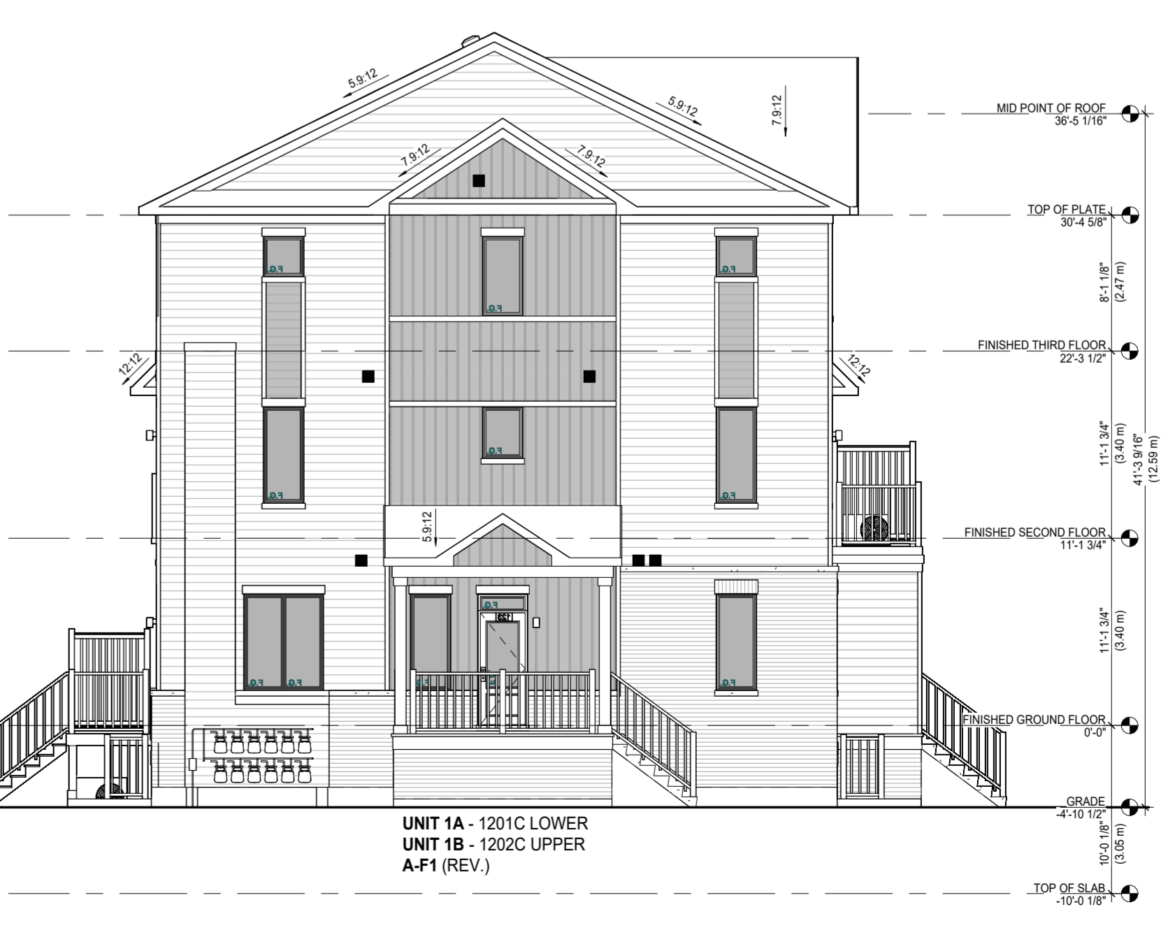
4 24 UNIT BLOCK - LEFT ELEVATION A 1/8" = 1'-0"