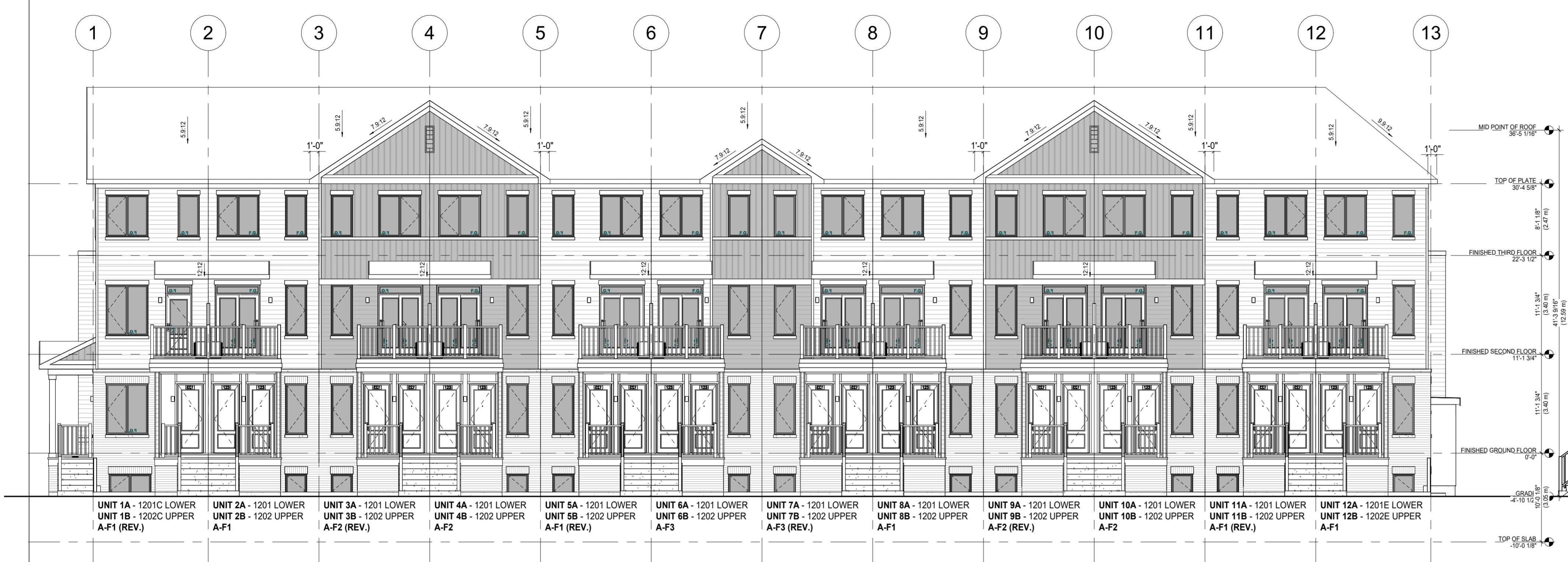
1 24 UNIT BLOCK - FRONT ELEVATION A 1/8" = 1'-0"

Block elevations are to vary between blocks with the provided two options Option 1 and Option 2.