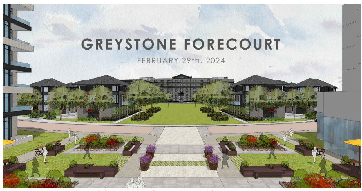
Figure 7: Axial view to the Deschâtelet Building from the Grand Allée. Source: Hobin Architecture, February 29, 2024