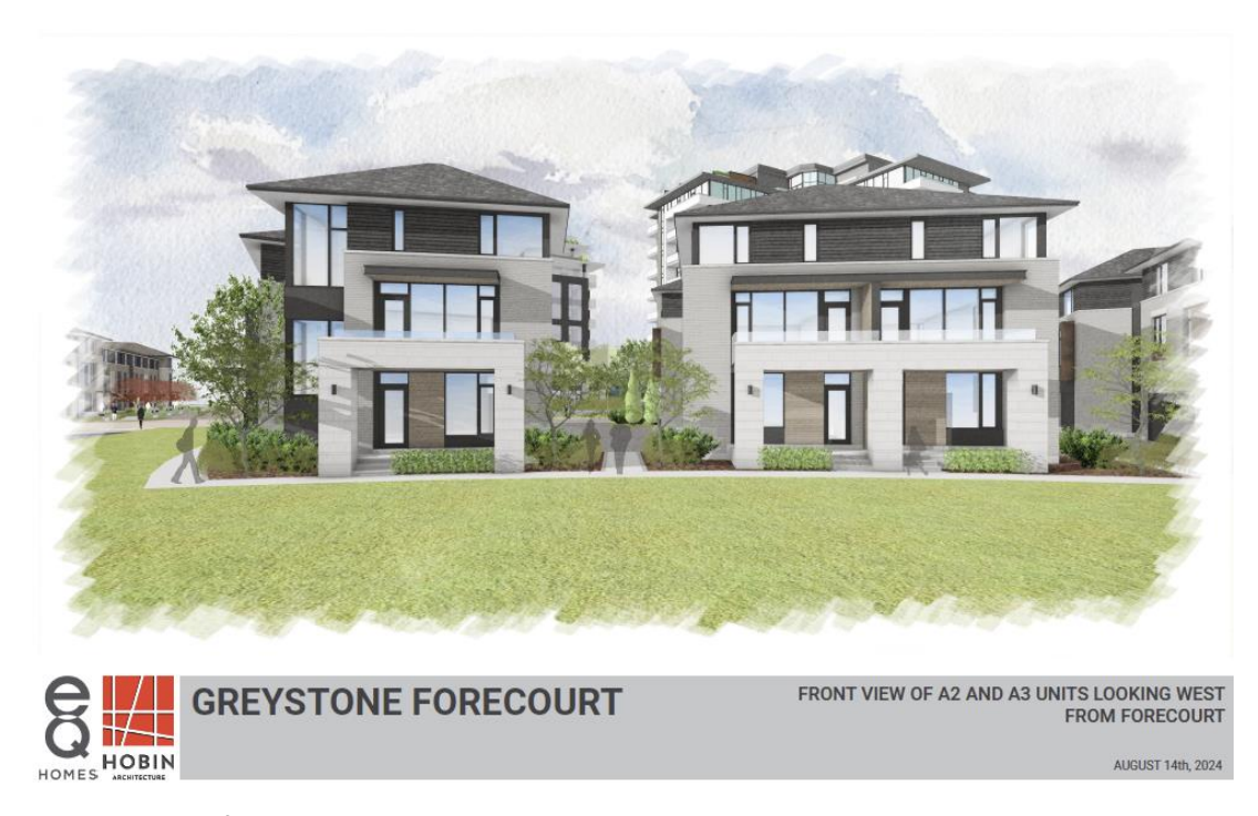
Figure 10: Views from Forecourt Park to Units A2 and A3. Hobin April 2024