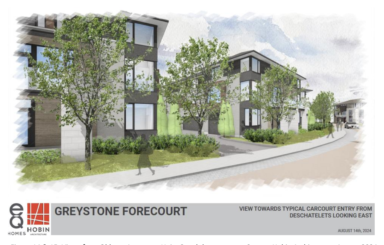
Figure 14 & 15: Views from Oblates Avenue to Units C and the car court.