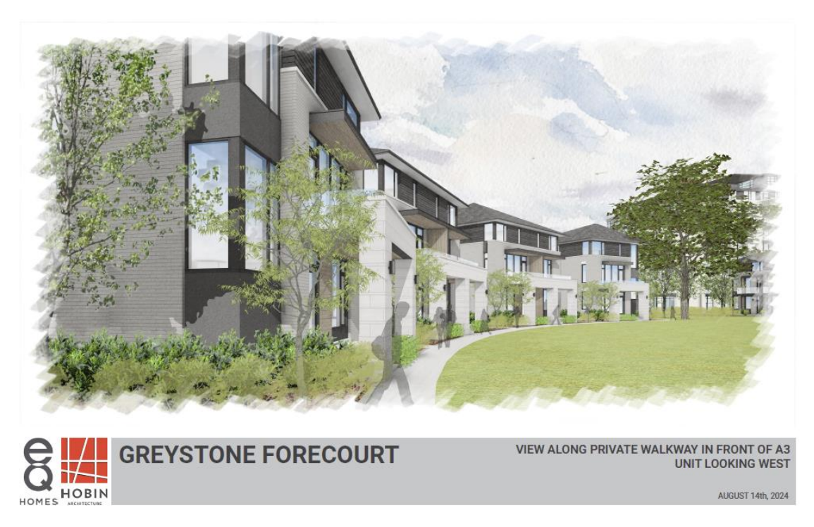
Figure 8: A view from within the forecourt, emphasizing the crescent form. Hobin August 2025.