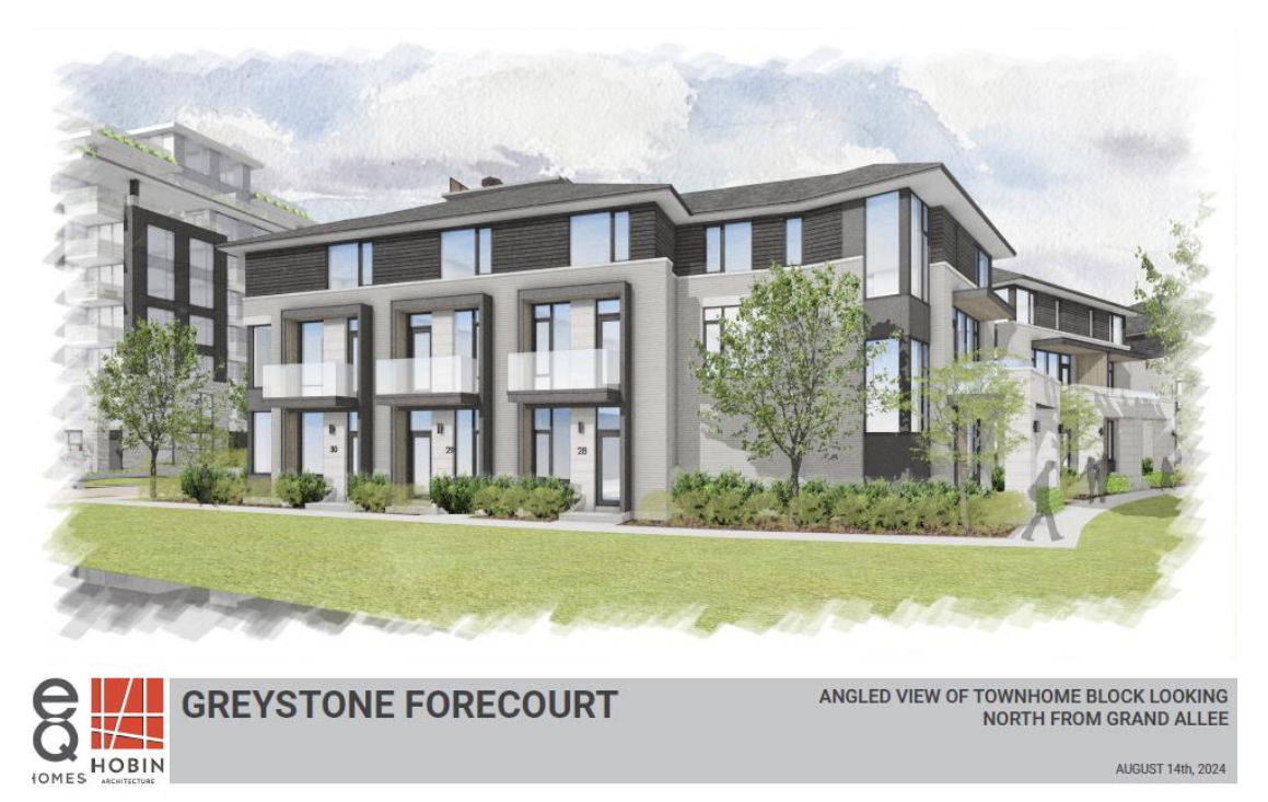
Figure 13: View looking north from Grand Allee.