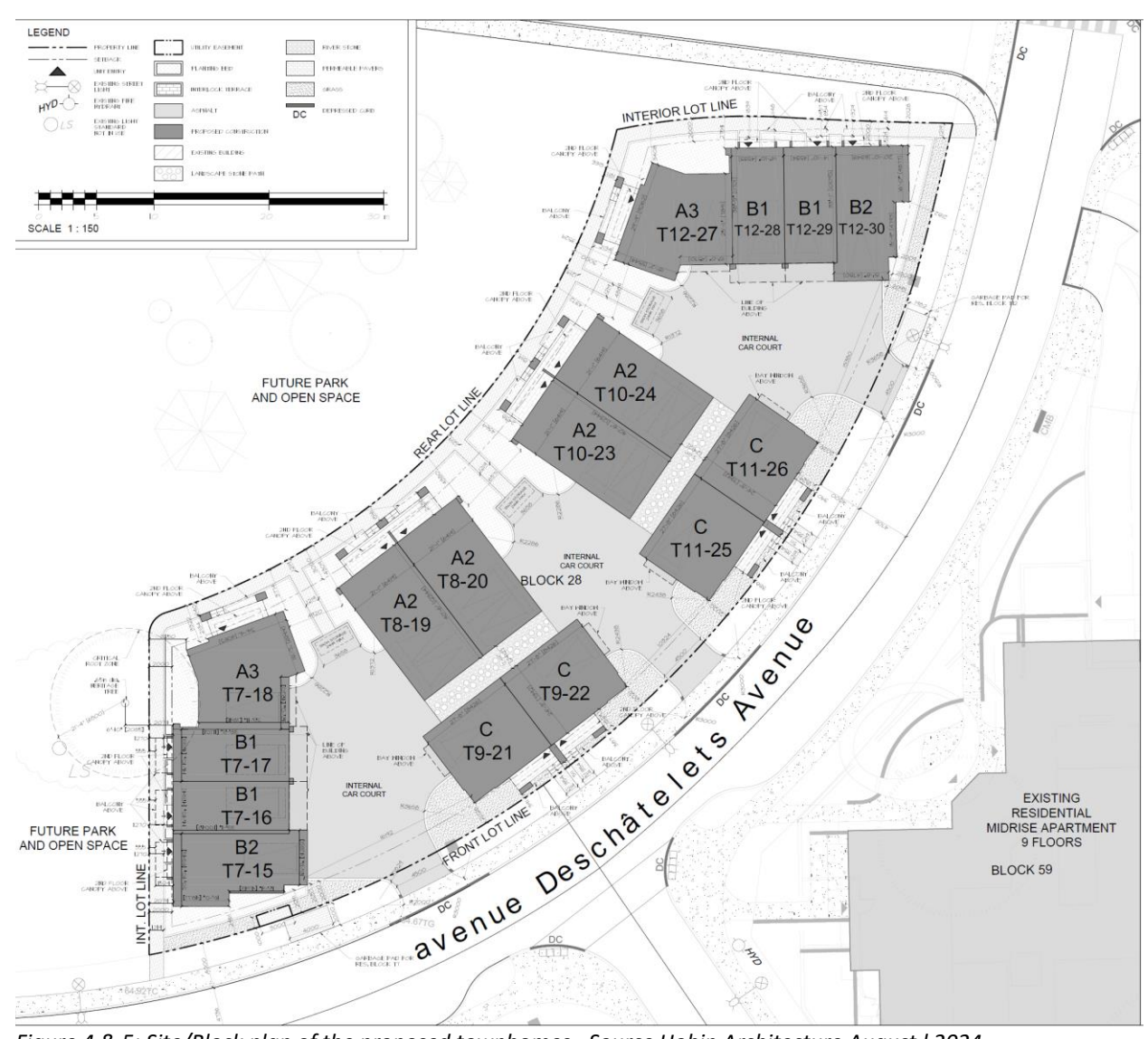
Figure 4 & 5: Site/Block plan of the proposed townhomes.

While these townhomes were originally conceptualized as two continuous curving blocks of back-to-back row homes, the design has been amended into a collection of 2-4 door townhouse blocks that provide more openness and connectivity through the site.