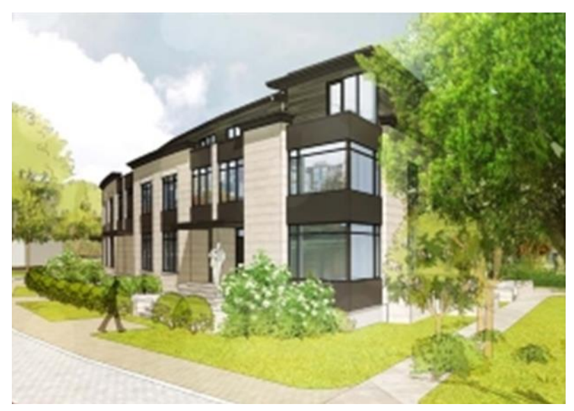
Figures 2 and 3: 2015 Plan view of an earlier version of the back-to-back townhomes/rowhouses forming the edge of the semicircular Forecourt to the Deschâtelet Building. Perspective view of the proposed townhomes. Credit: Regional Group Inc. 2015.

The development Blocks 28 and 29 are located on the western edge of the designated landscape associated with the Deschâtelet Building. The development blocks 28 and 29 are bisected into two approximately equal parts by the Grand Allée and bordered by the semicircular forecourt to the east and Deschâtelet Avenue to the west.