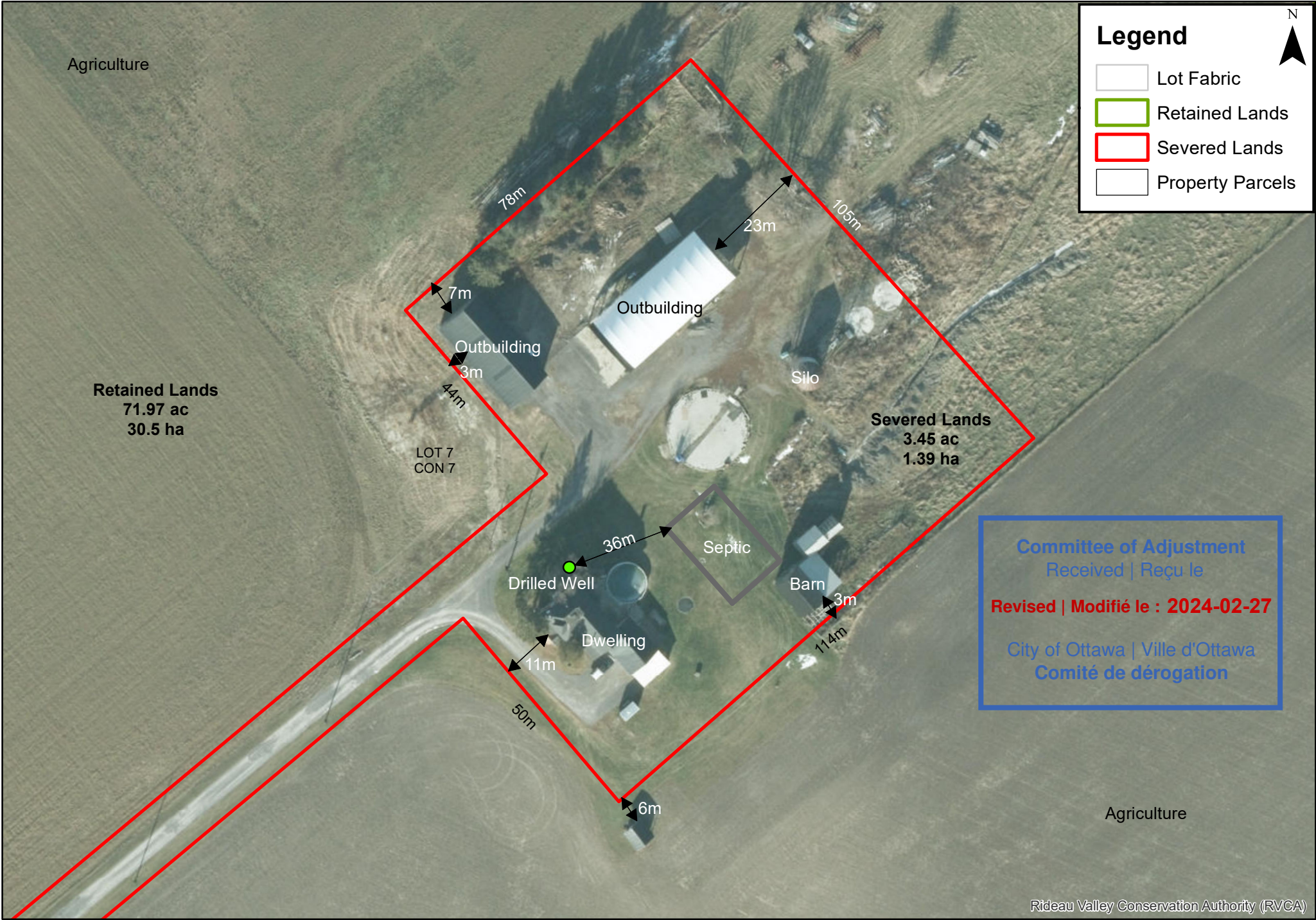
Severance Sketch (Large Scale)

Rideau Valley Conservation Authority (RVCA)