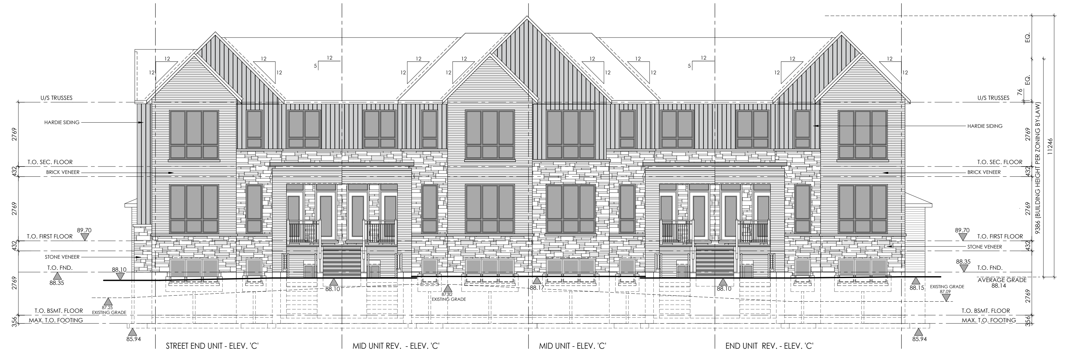
TYPICAL BLOCK - PRIVATE STREET ELEVATION (BLOCK 5 SHOWN, GRADES SHOWN ARE TAKEN FROM STANTEC GRADING PLAN)