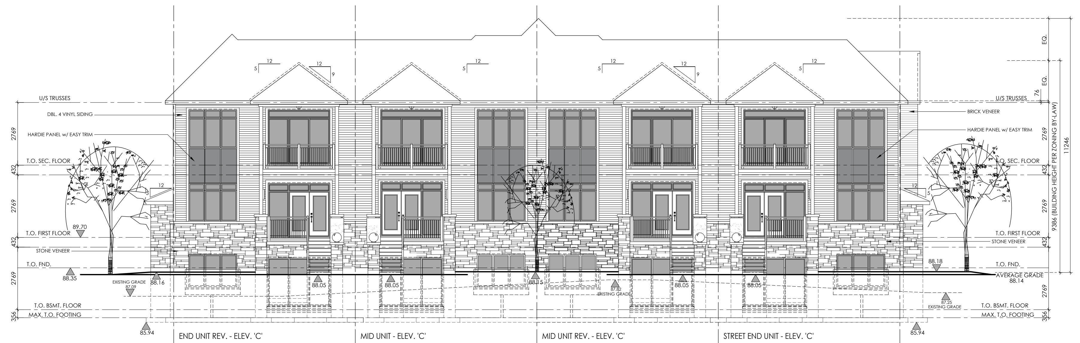
TYPICAL BLOCK - PUBLIC STREET ELEVATION (BLOCK 5 SHOWN, GRADES SHOWN ARE TAKEN FROM STANTEC GRADING PLAN)

M. David Blakely Architect Inc. 2200 Prince of Wales Dr. - Suite 101 Ottawa, Ontario K2E 6Z9 Phone (613) 226-8811 Fax (613) 226-7942