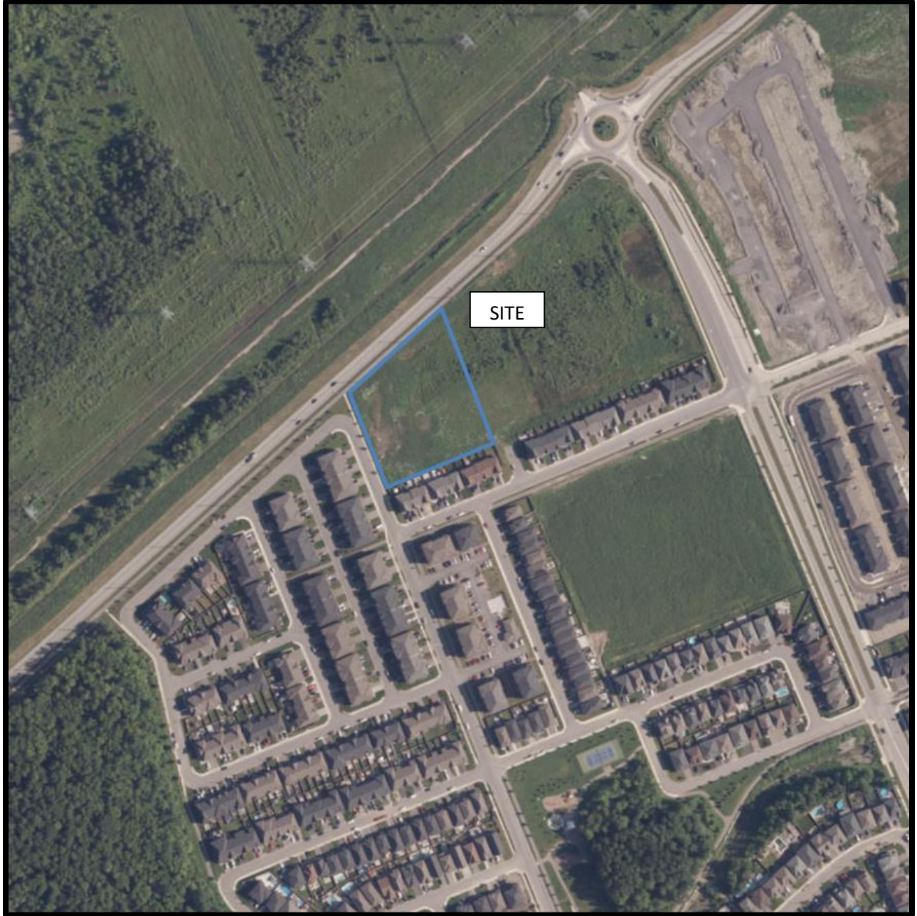
AERIAL PHOTOGRAPH 2022