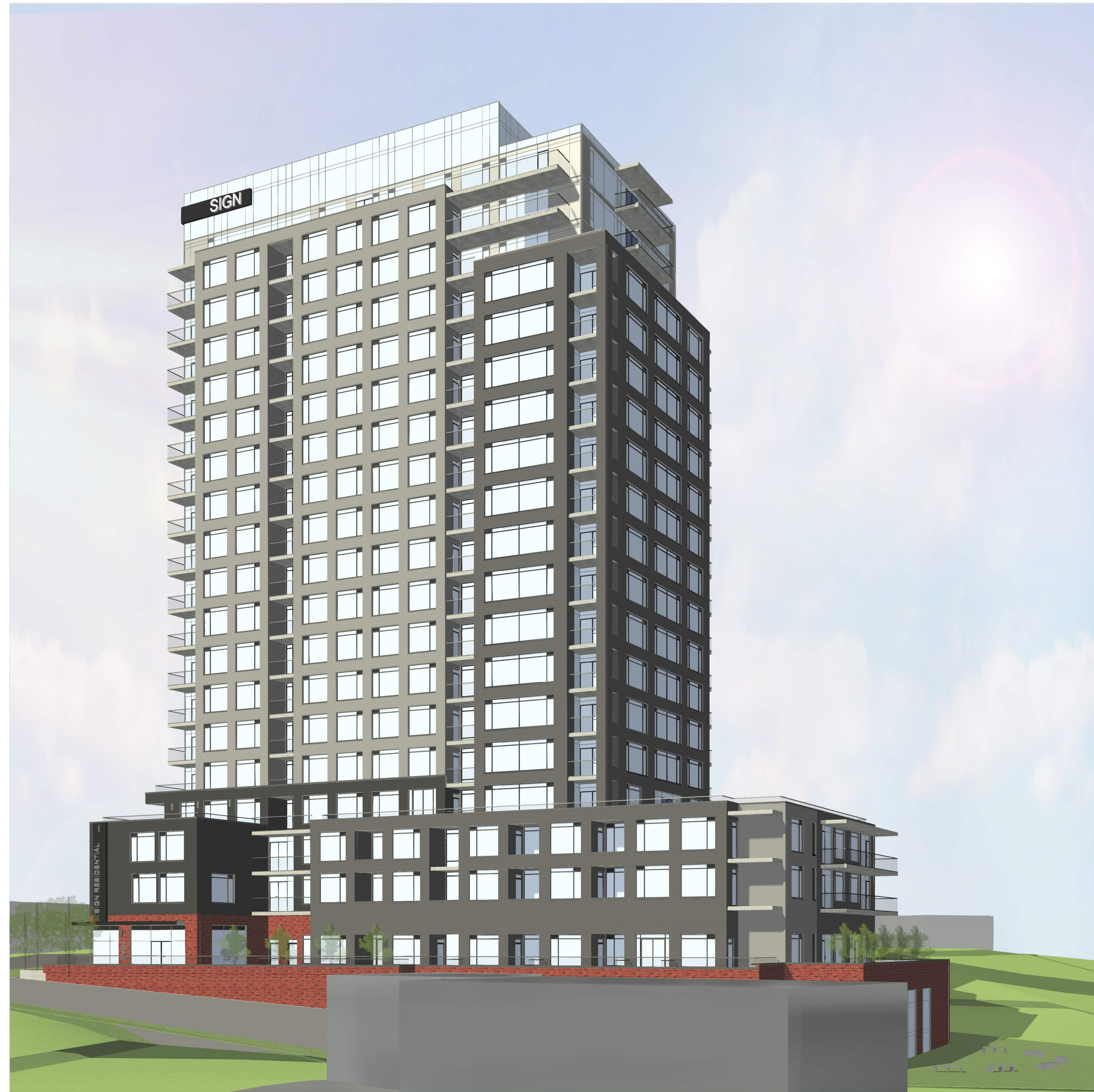
3D VIEW FROM BACK LOOKING TOWARDS SOUTHWEST