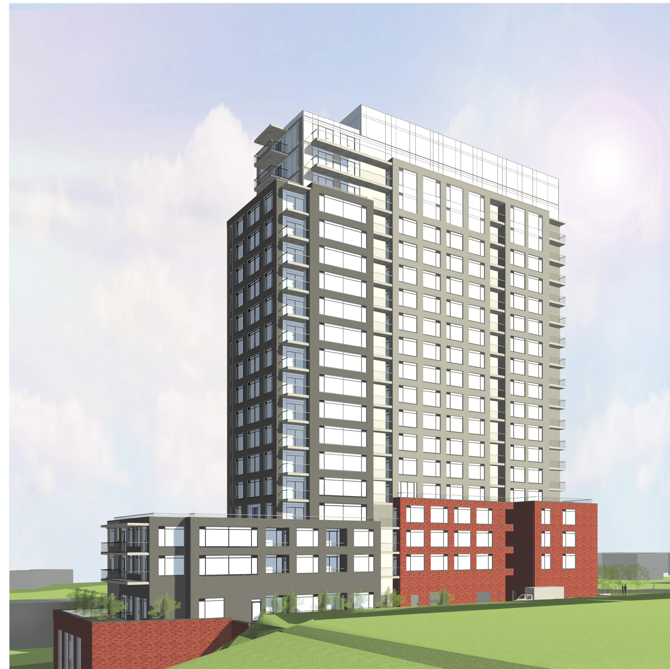
3D VIEW FROM BACK LOOKING TOWARDS SOUTHEAST