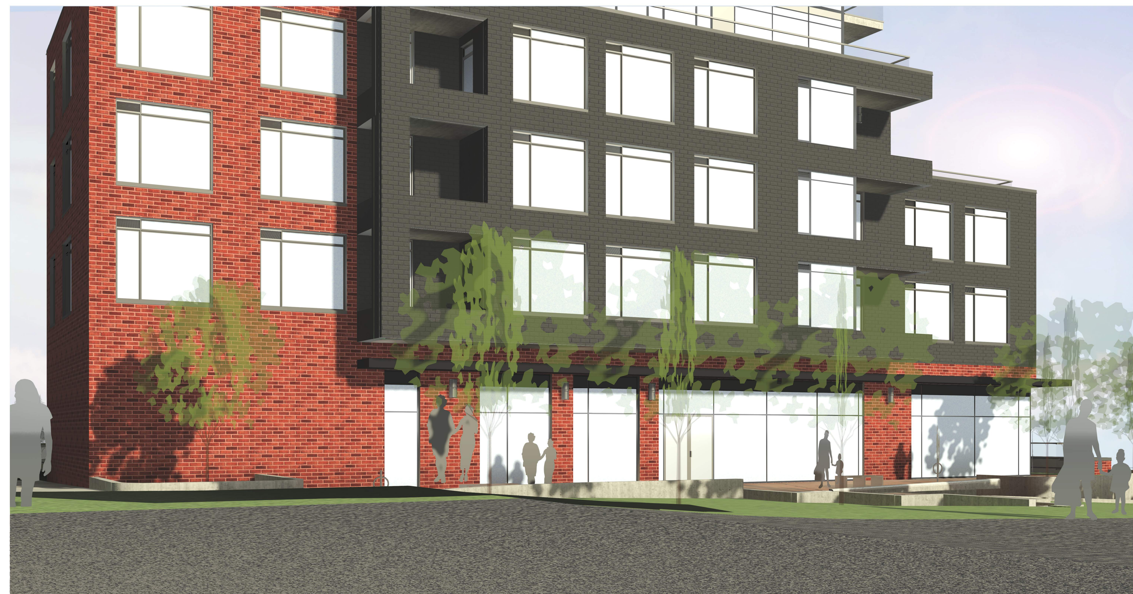
3D VIEW LOOKING TOWARDS ENTRANCE