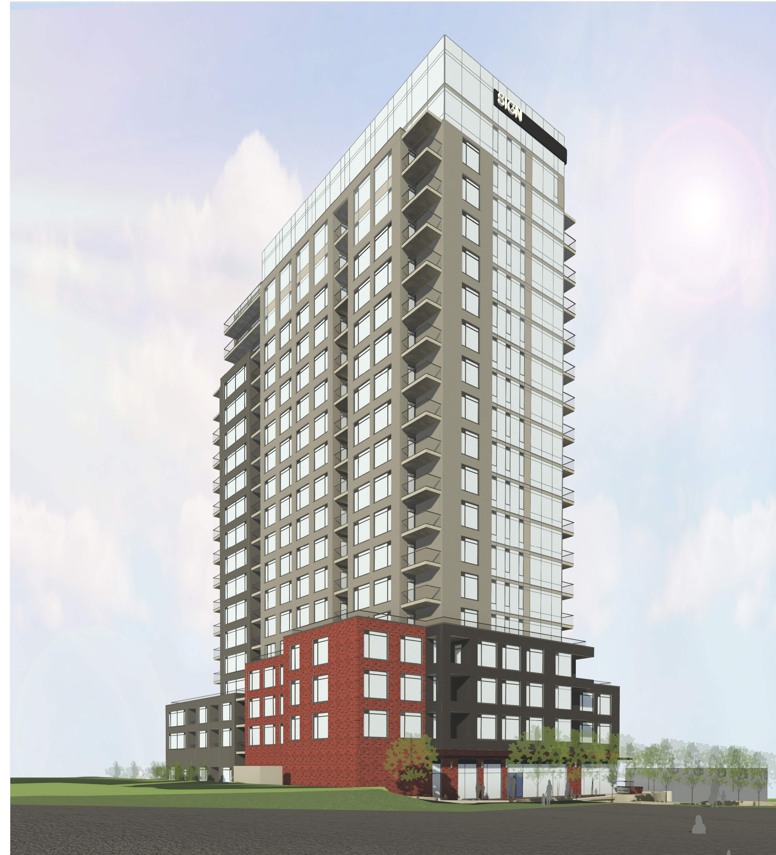
3D VIEW FROM MONTREAL RD LOOKING TOWARDS NORTHEAST