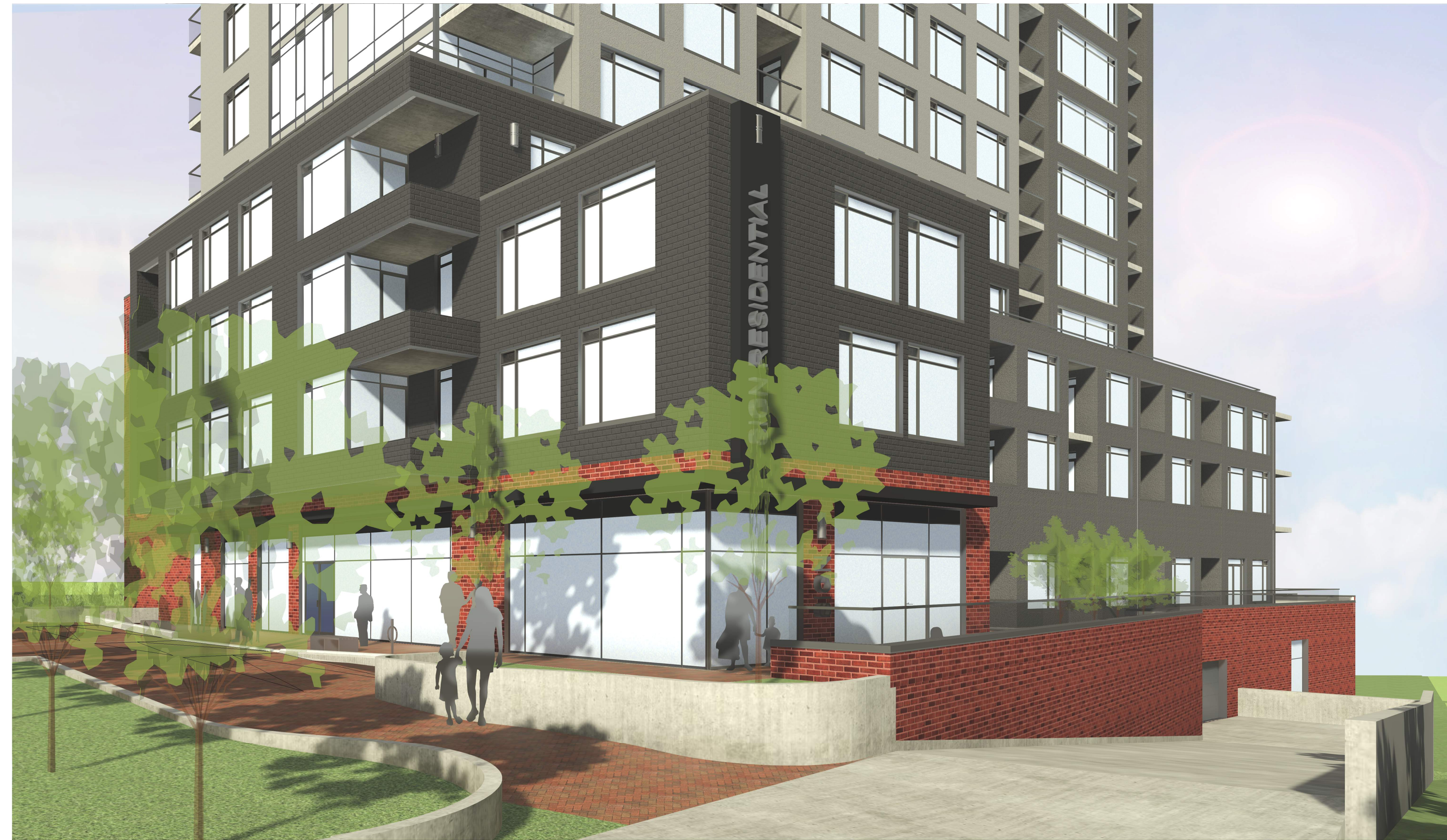
3D VIEW LOOKING TOWARDS ENTRANCE