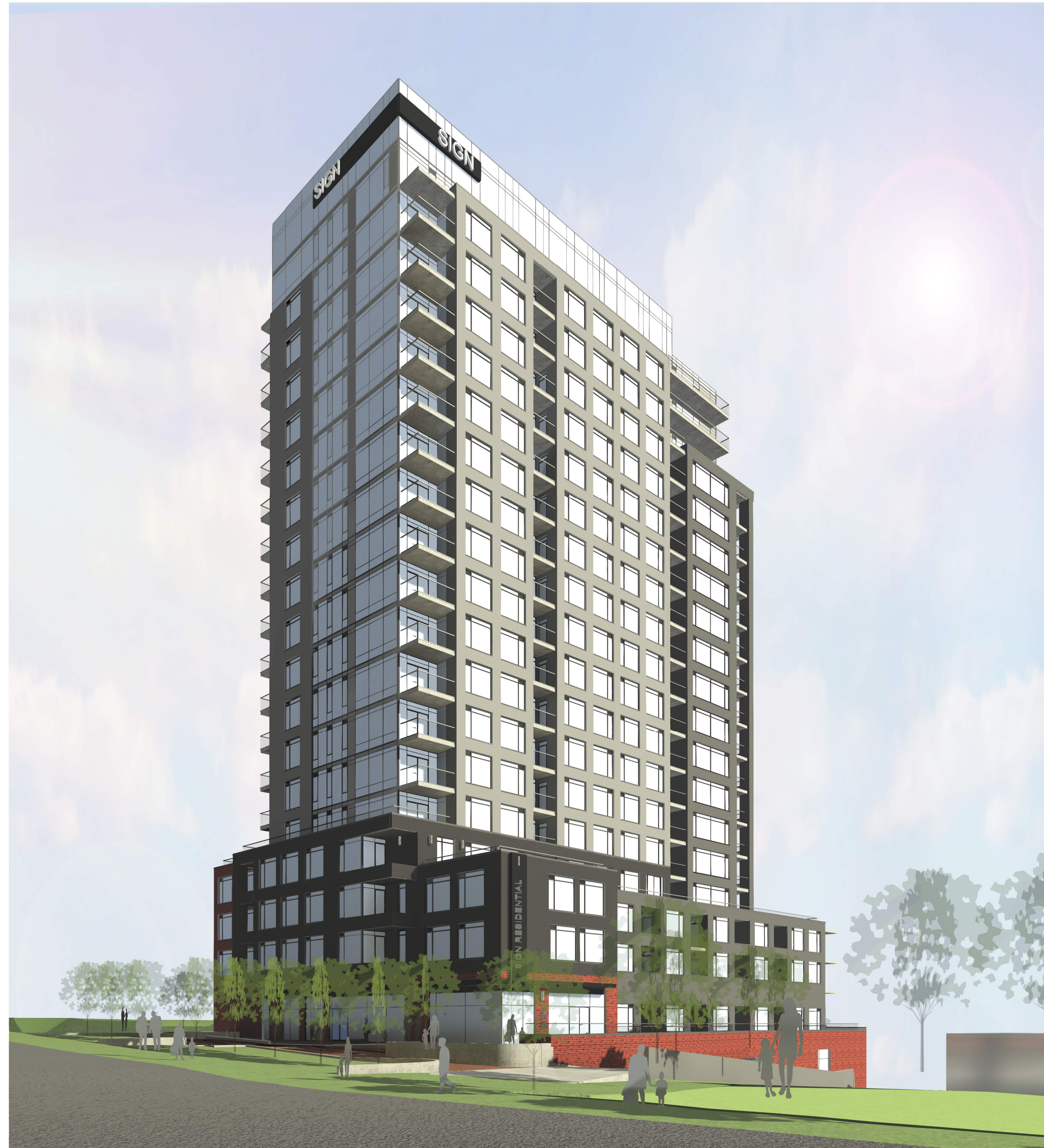
3D VIEW FROM MONTREAL RD LOOKING TOWARDS NORTHWEST