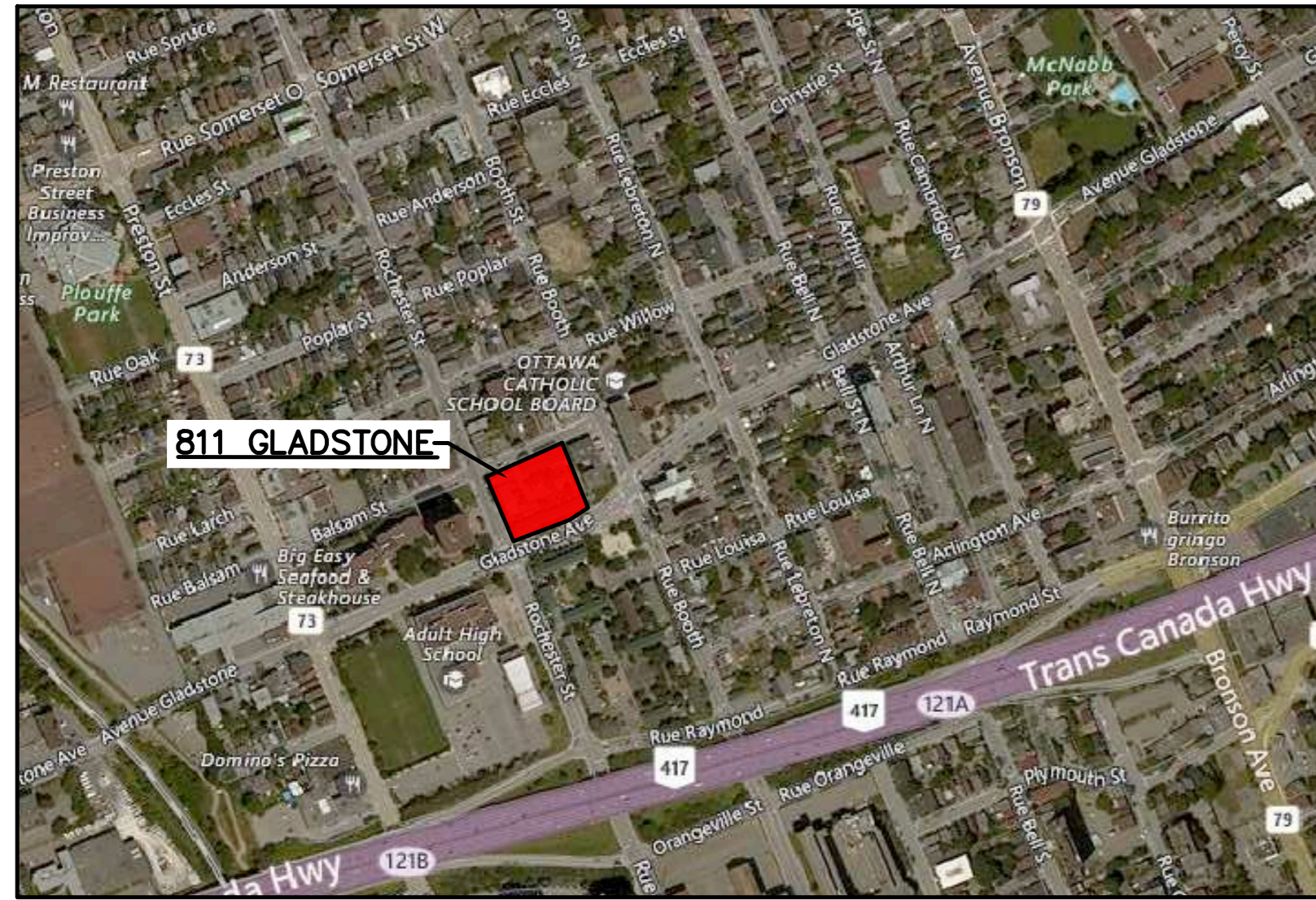
1 LOCATION PLAN A-1 N.T.S. TRUE NORTH

LEGAL DESCRIPTION LOTS 263, 264, 265, 271 AND 272 AND PART OF LOTS 262, 266, 267, 270, AND 273 REGISTERED PLAN 16 (ROCHESTER) CITY OF OTTAWA (PIN NOS. 04108-0285, 04108-0289)