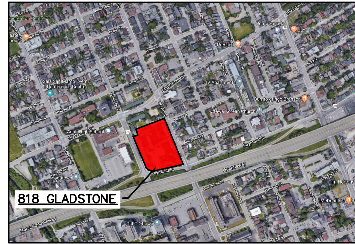
1 LOCATION PLAN A-1 N.T.S. TRUE NORTH

LEGAL DESCRIPTION LOT 275, PART OF LOTS 274, 276, 277 REGISTERED PLAN 16 LOTS 1 to 6 (both inclusive) and PART OF LOTS 7 and 8 East Rochester Street, LOTS 2 to 7 (both inclusive) and PART OF LOTS 1 AND 8 West Booth Street, LOT 1 and PART OF LOT 2 North Margaret Street, LOTS 1 and 2 South Margaret Street, LOTS 1 and 2 North Arlington Avenue, PART OF LOTS 1 and 2 South Arlington Avenue, LOUISA STREET (Formerly Margaret Street) (closed by By-Law 41-64, Inst. CR496038) ARLINGTON AVENUE (Formerly Edward Street) (closed by By-Law 42-64, Inst. CR496039) REGISTERED PLAN 27 PART OF LOT 9 REGISTERED PLAN 64 CITY OF OTTAWA