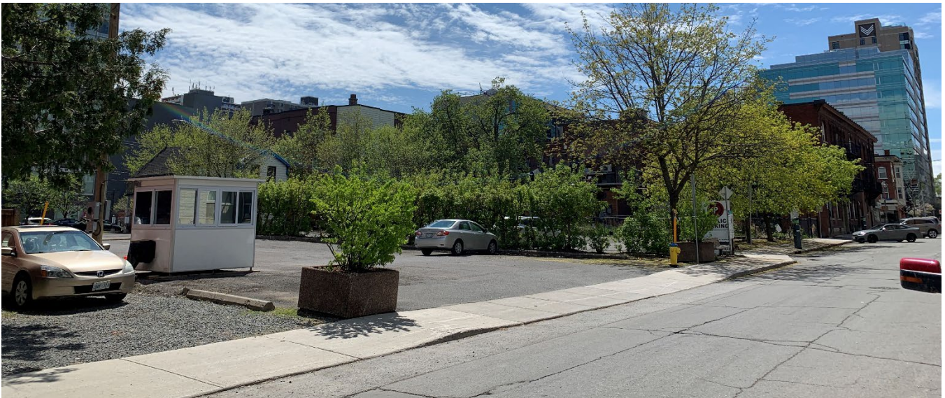
Figure 3: Surface parking lot located west along Nepean Street

West: Buildings to the west include several high-rise residential buildings. The Bank Street Traditional Mainstreet is located a block west of the subject site and a variety of land uses can be found on the street. There are multiple parking lots to the west that service the high-rise apartment buildings adjacent to them (Figure 3).