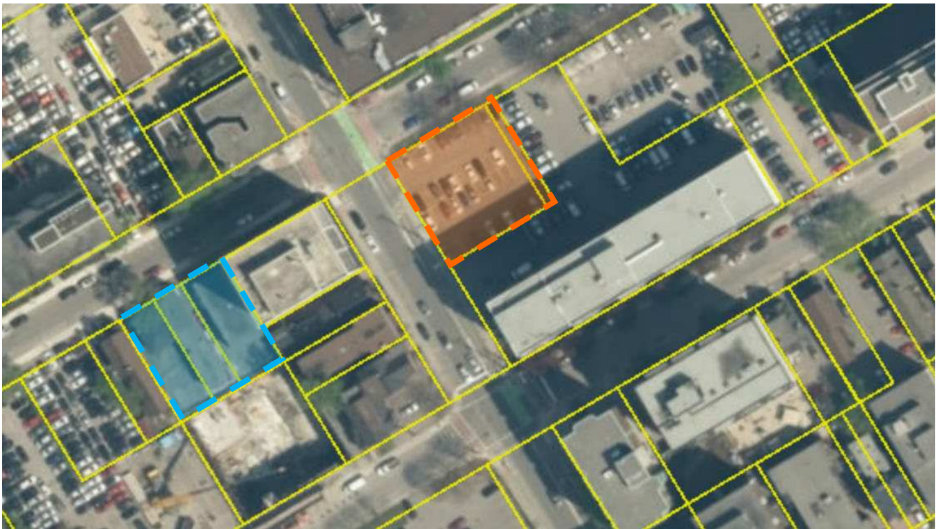
Figure 1: Subject site at 142-148 Nepean Street (blue); existing surface parking lot at 108 Nepean Street (orange)

East: The immediate property to the east of the subject site is 190 O'Connor Street, an 11-storey office building. Further east across O'Connor Street at 108 Nepean Street is the parking lot that presently services 190 O'Connor Street. This existing surface parking lot provides parking for 44 vehicles and is accessed from O'Connor Street (Figure 1).