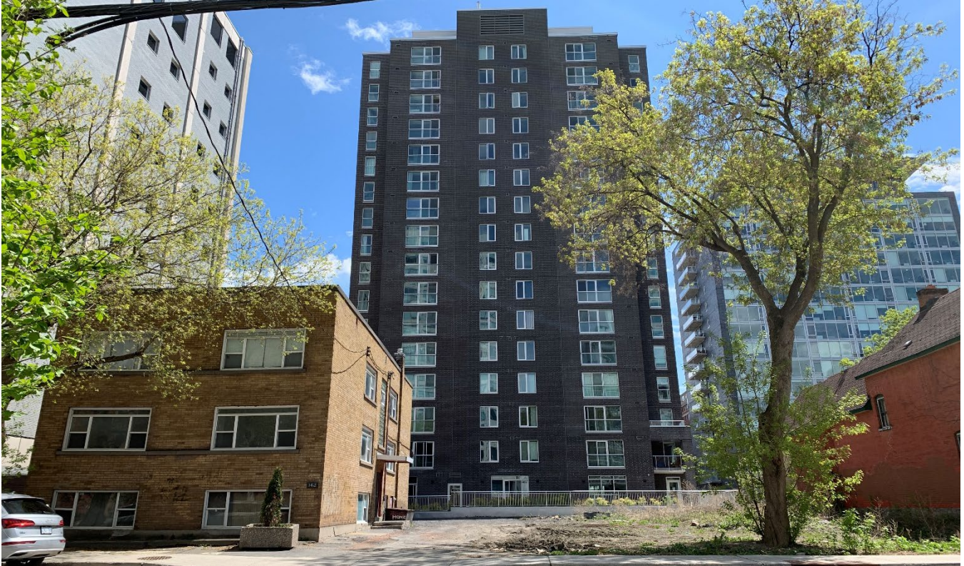
Figure 2: Looking south towards 142 – 148 Nepean Street, high-rise residential buildings located to the rear yard

West: Buildings to the west include several high-rise residential buildings. The Bank Street Traditional Mainstreet is located a block west of the subject site and a variety of land uses can be found on the street. There are multiple parking lots to the west that service the high-rise apartment buildings adjacent to them (Figure 3).