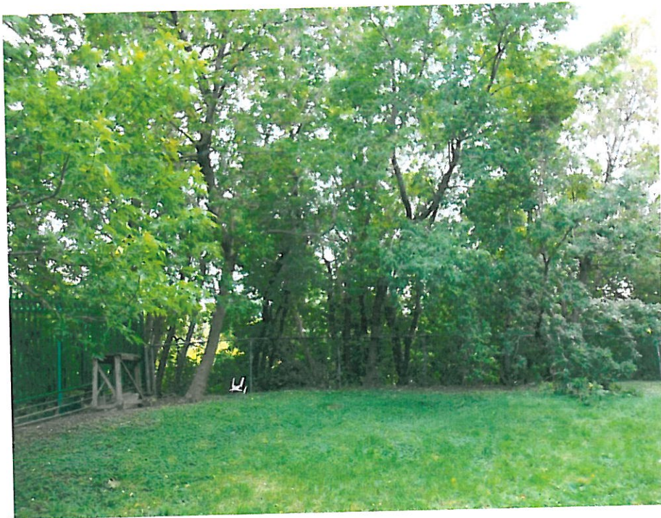
Photo 2. View of rear yard; fence along north side, and trees at crest of slope.