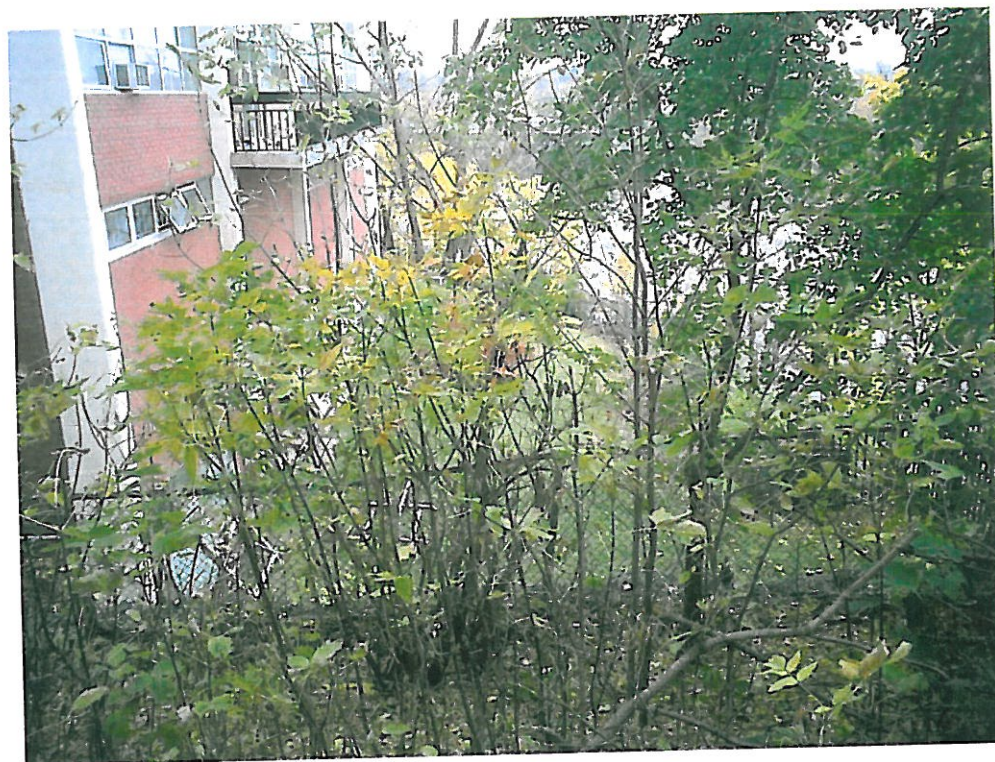
Photo 13. View of rear yard to the north, about 6 metres lower in elevation than subject site.