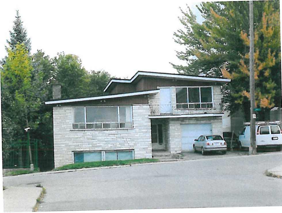
Photo 1. View of existing dwelling at 101 Wurtemberg Street (subject property).