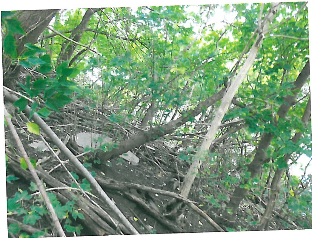
Photo 9. View of slope, with low quality trees growing off perpendicular, leaning toward river