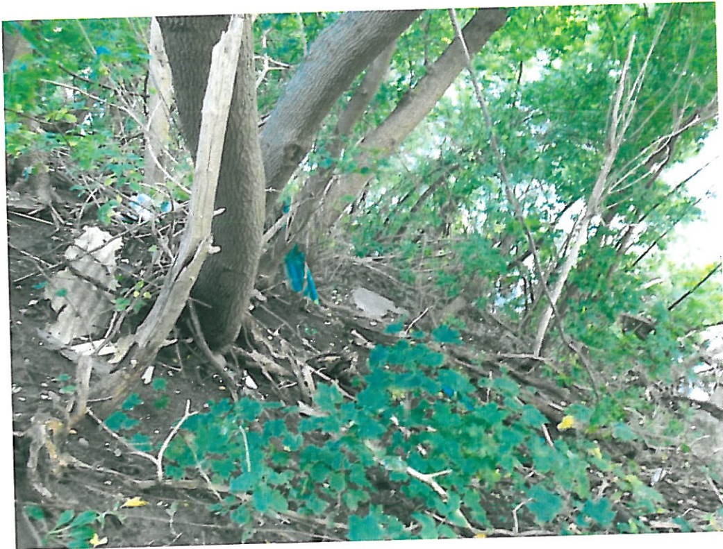
Photo 7. Close-up of fill on slope, and lack of vegetation at grade