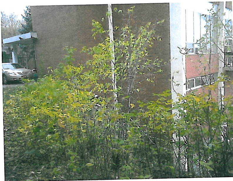
Photo 11. View to the north of adjacent building and grade difference between front and rear of lot.