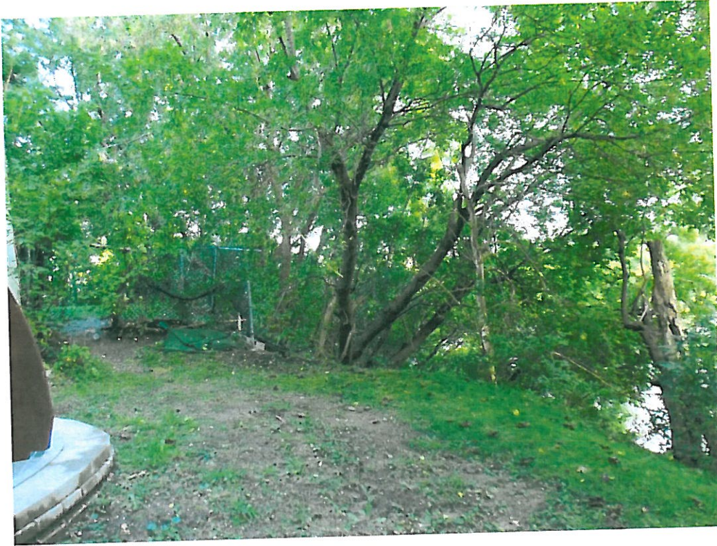
Photo 6. Standing in rear yard of adjacent property, looking north to subject property