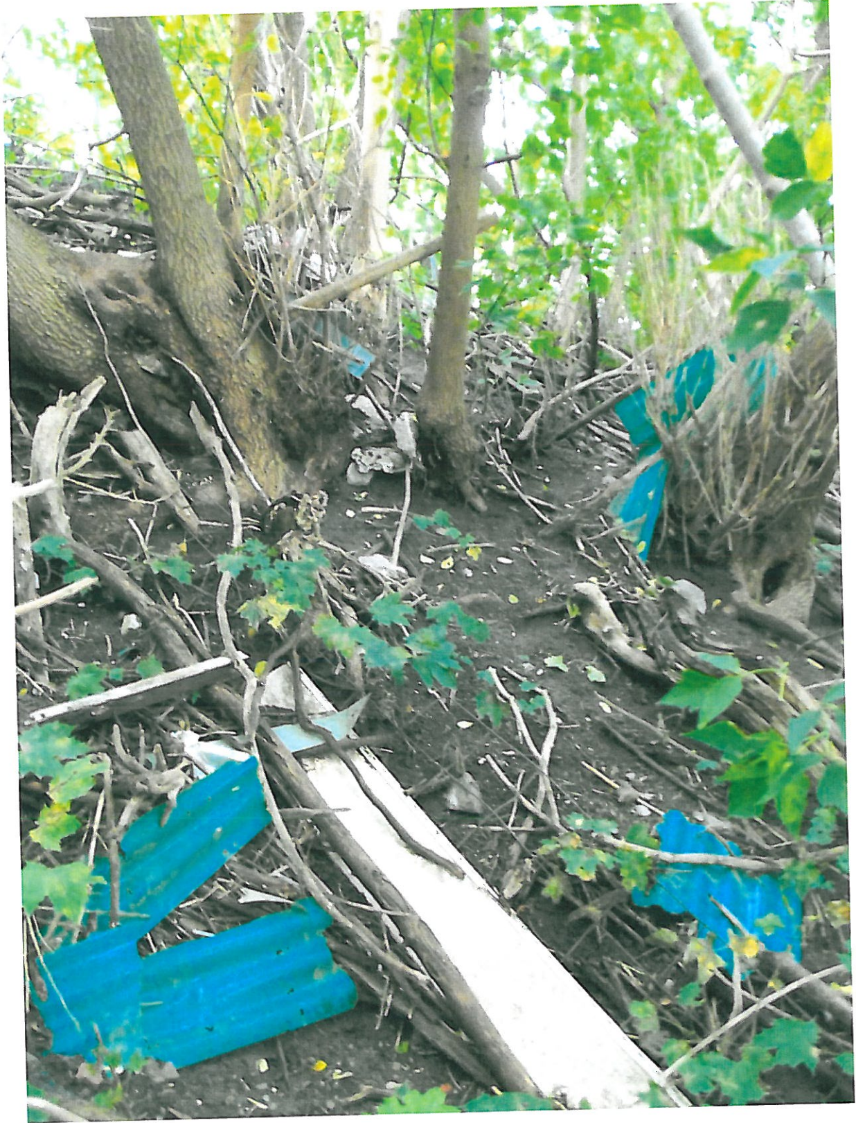
Photo 3. Close-up of slope near the crest