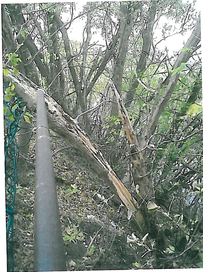
Photo 10. View at crest of slope, looking north, with tree having fallen in early October 2010.