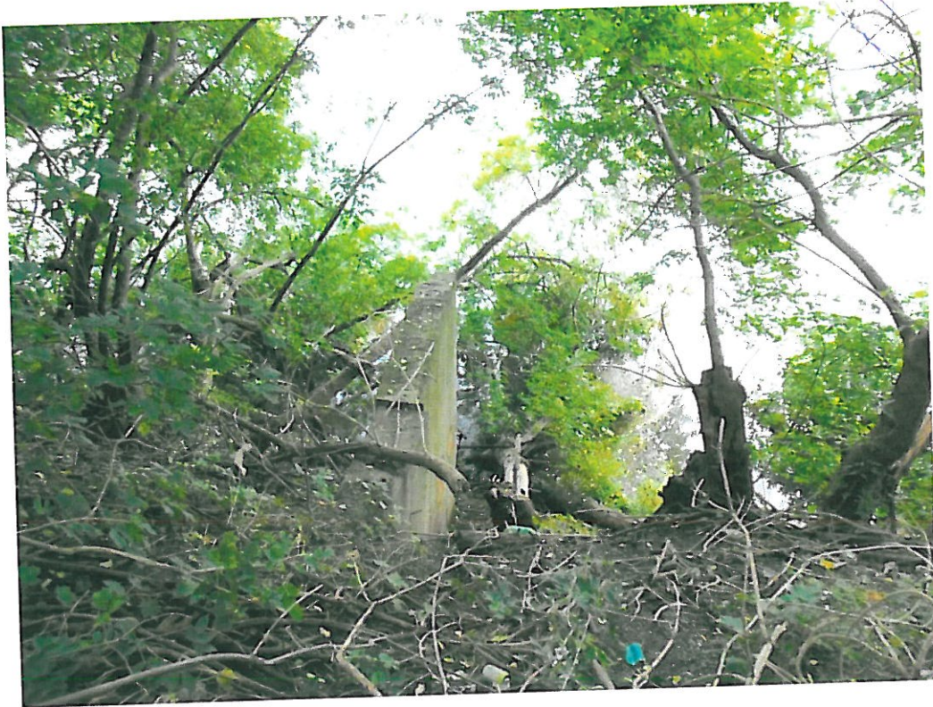
Photo 8. View towards river from top of slope