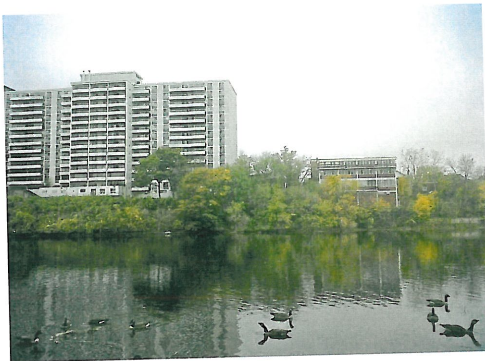
Photo 12. View of shoreline from east side of the Rideau River.