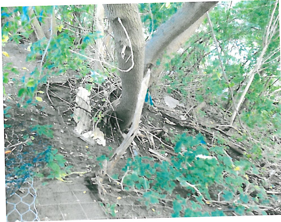
Photo 4. View of crest of slope looking north.