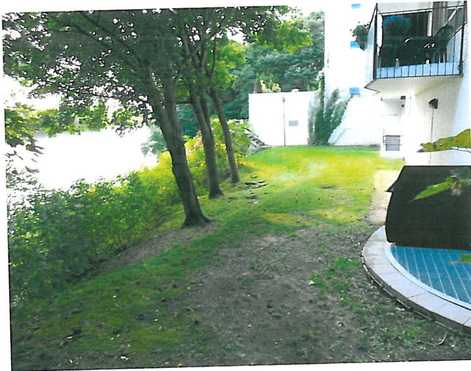
Photo 5. Adjacent property to the south, at a level about 1.2 metres lower than subject site