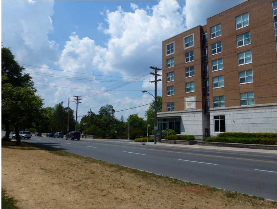
Photo 13: View from the Southeast across Richmond Road from the AMICA building.