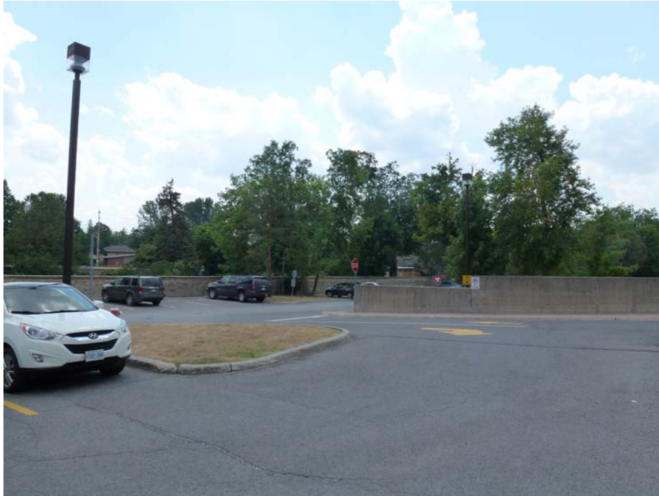
Photo 11: View of the Maplelawn Garden from the Northeast (Plaza in front of the Coolican Building).