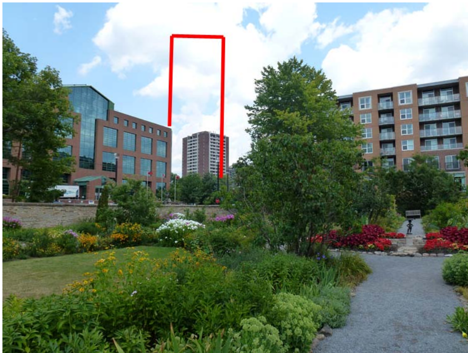
Photo 8: View towards the Northeast from within the Maplelawn Garden. Conceptual outline of tower shown.