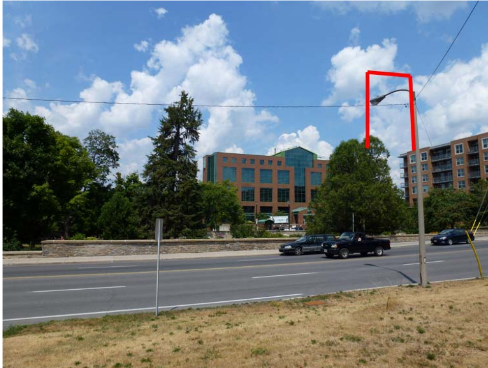
Photo 5: View of the Maplelawn Garden and Coolican and Amica Buildings behind from the south across Richmond Road.