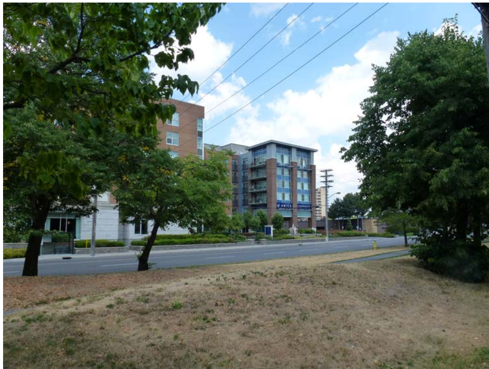
Photo 2: View of the AMICA Building from across Richmond Road to the South.