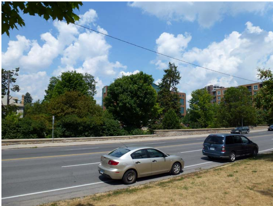
Photo 6: View of the Maplelawn Garden from the Southwest across Richmond Road.