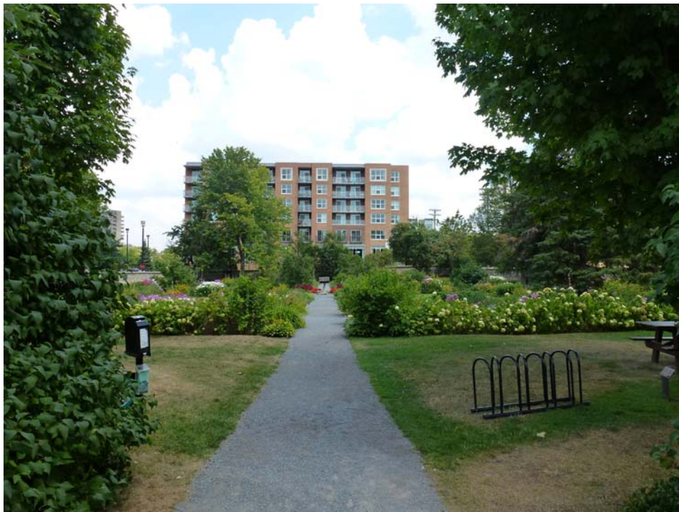
Photo 10: View to the east and AMICA building beyond from within the Maplelawn Garden.