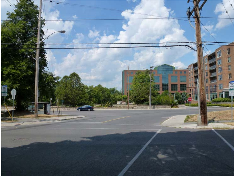
Photo 3: View from Broadview Avenue to the North, across Richmond Road.