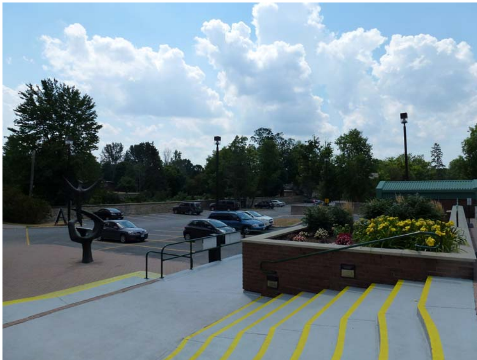
Photo 12: View of the Maplelawn Garden from the North on the steps of the Coolican Building.