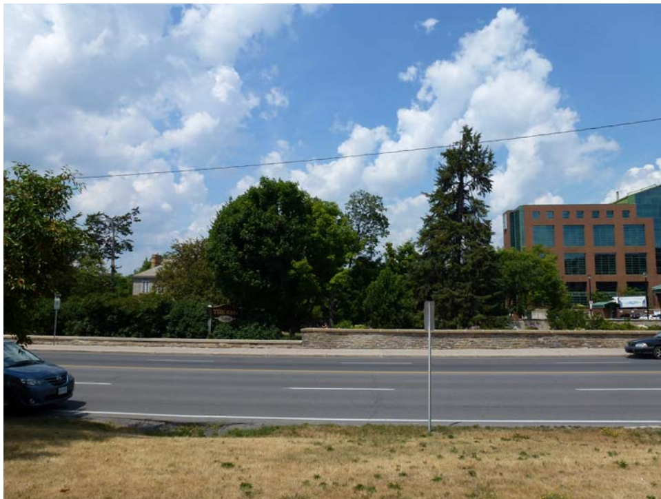
Photo 4: View of the Maplelawn Garden from across Richmond Road to the South.