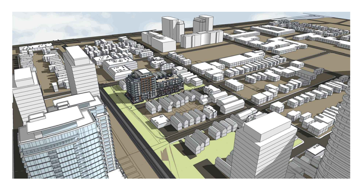
BIRD'S EYE VIEW LOOKING NORTH