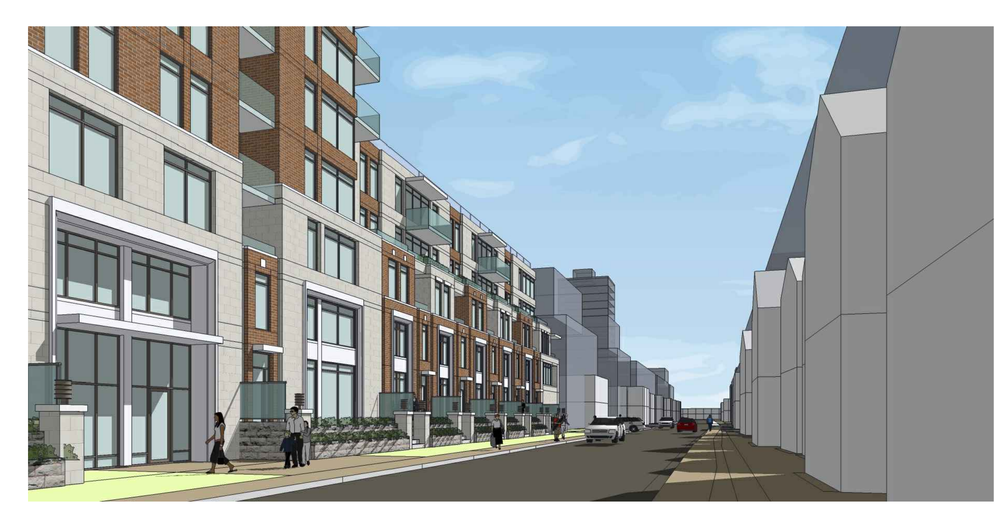
STREET VIEW LOOKING EAST FROM NORMAN