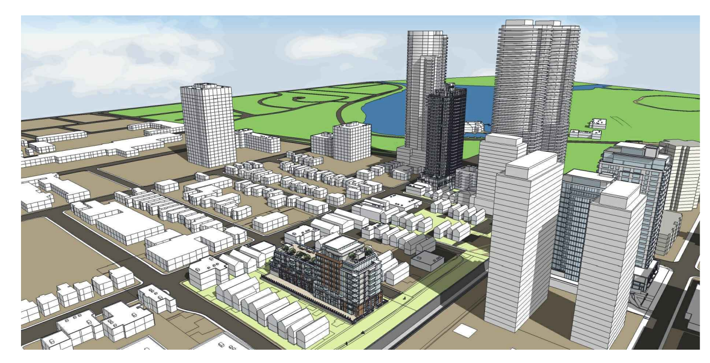
BIRD'S EYE VIEW LOOKING SOUTHEAST