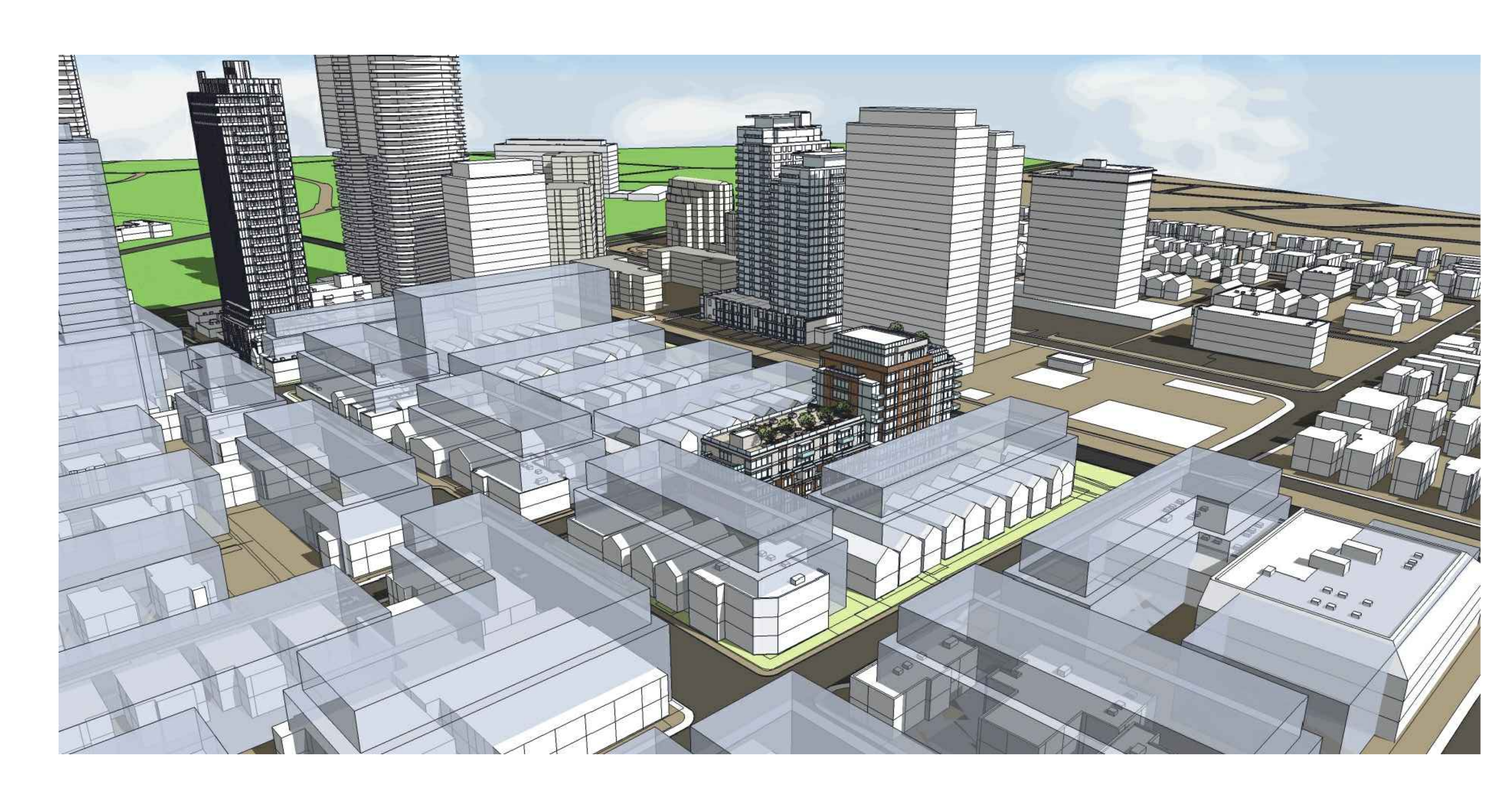
BIRD'S EYE VIEW LOOKING SOUTHWEST