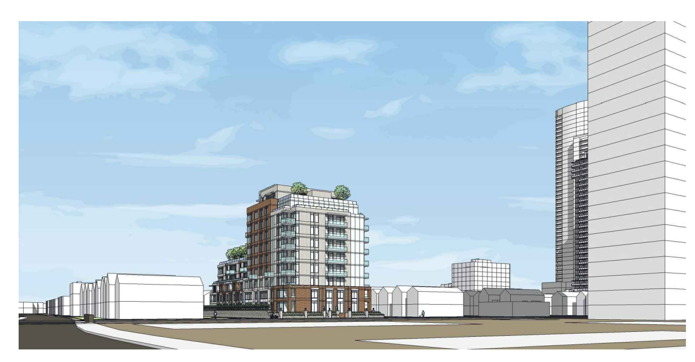
STREET VIEW LOOKING SOUTH EAST FROM BEECH