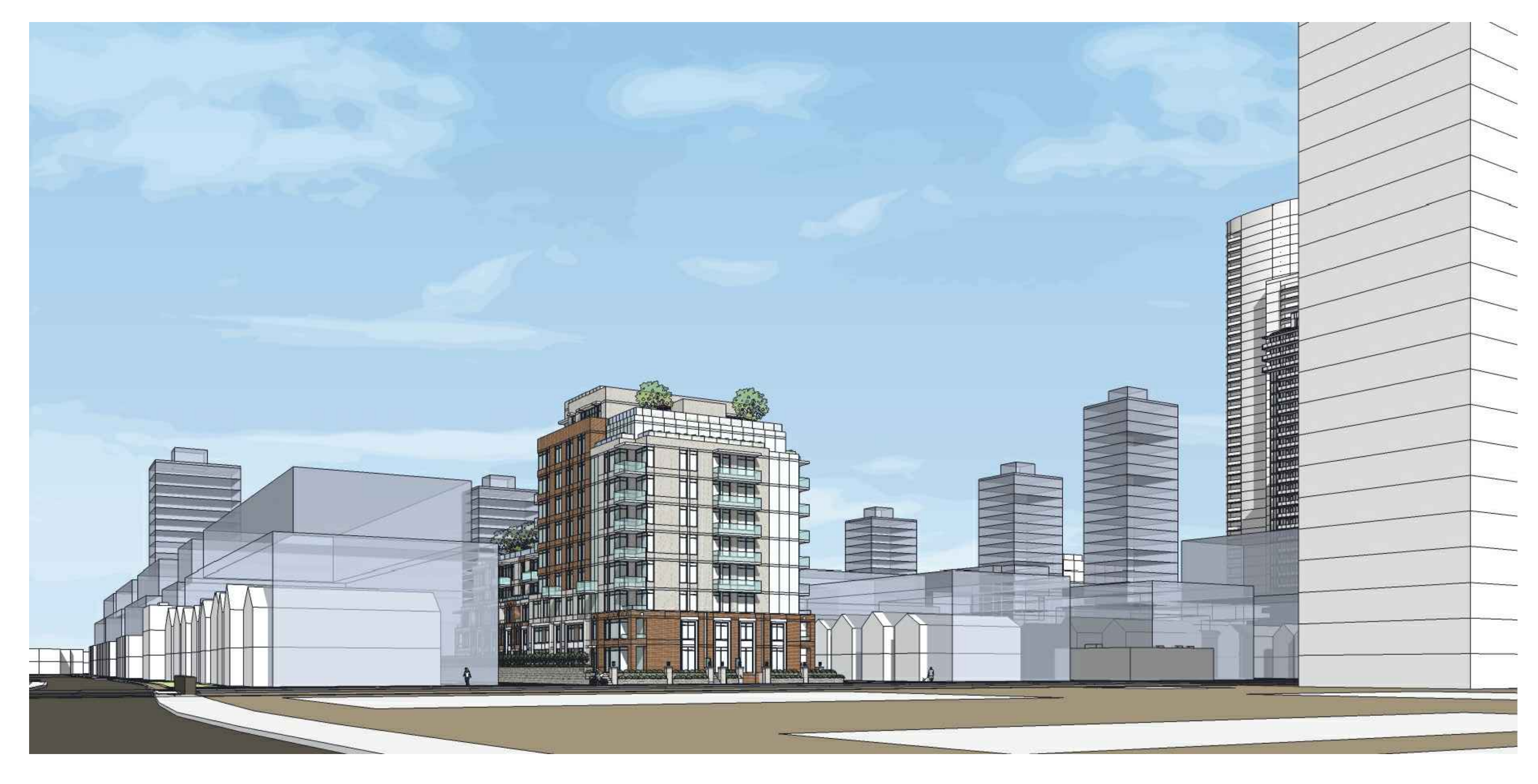
STREET VIEW LOOKING SOUTH EAST FROM BEECH