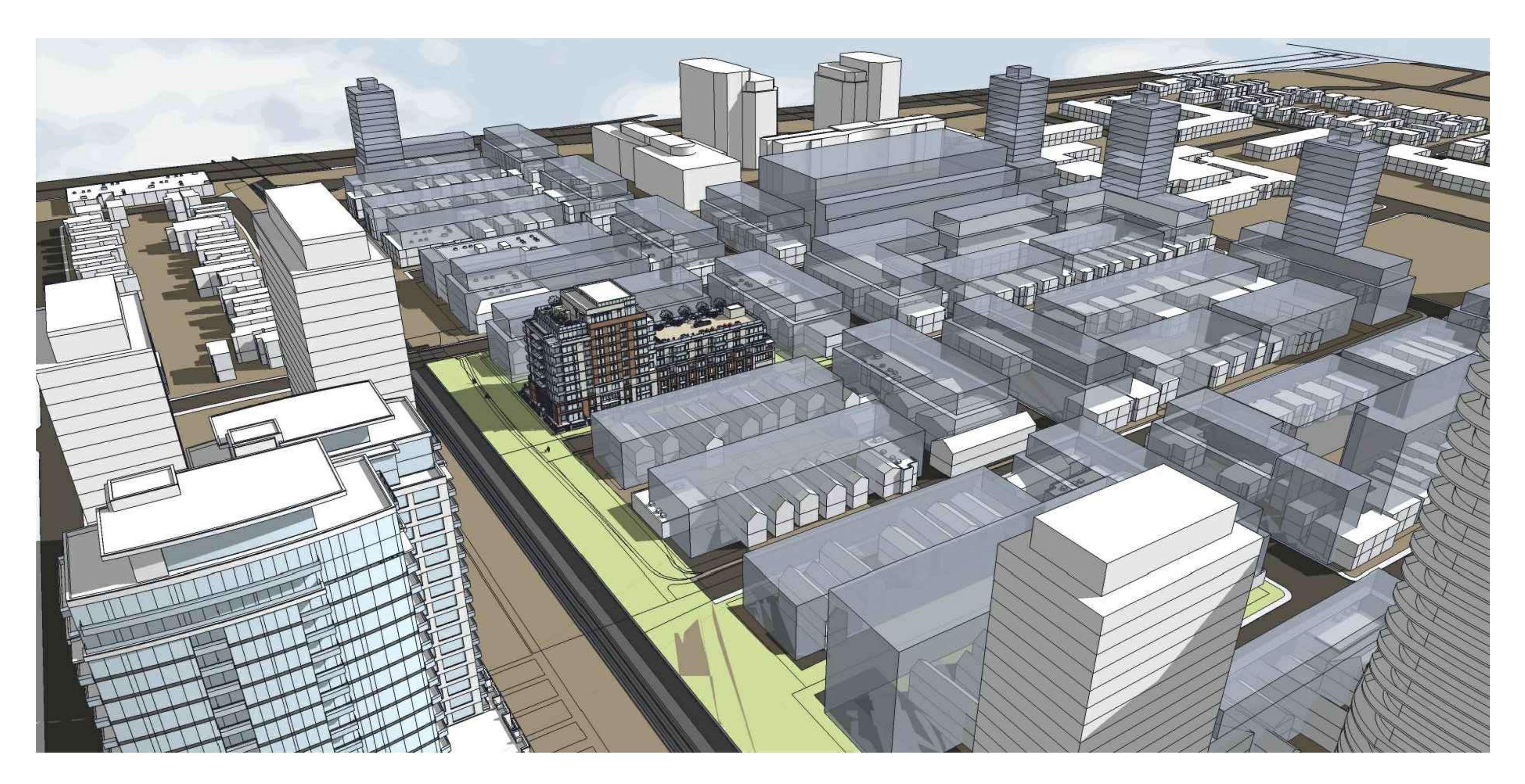
BIRD'S EYE VIEW LOOKING NORTH