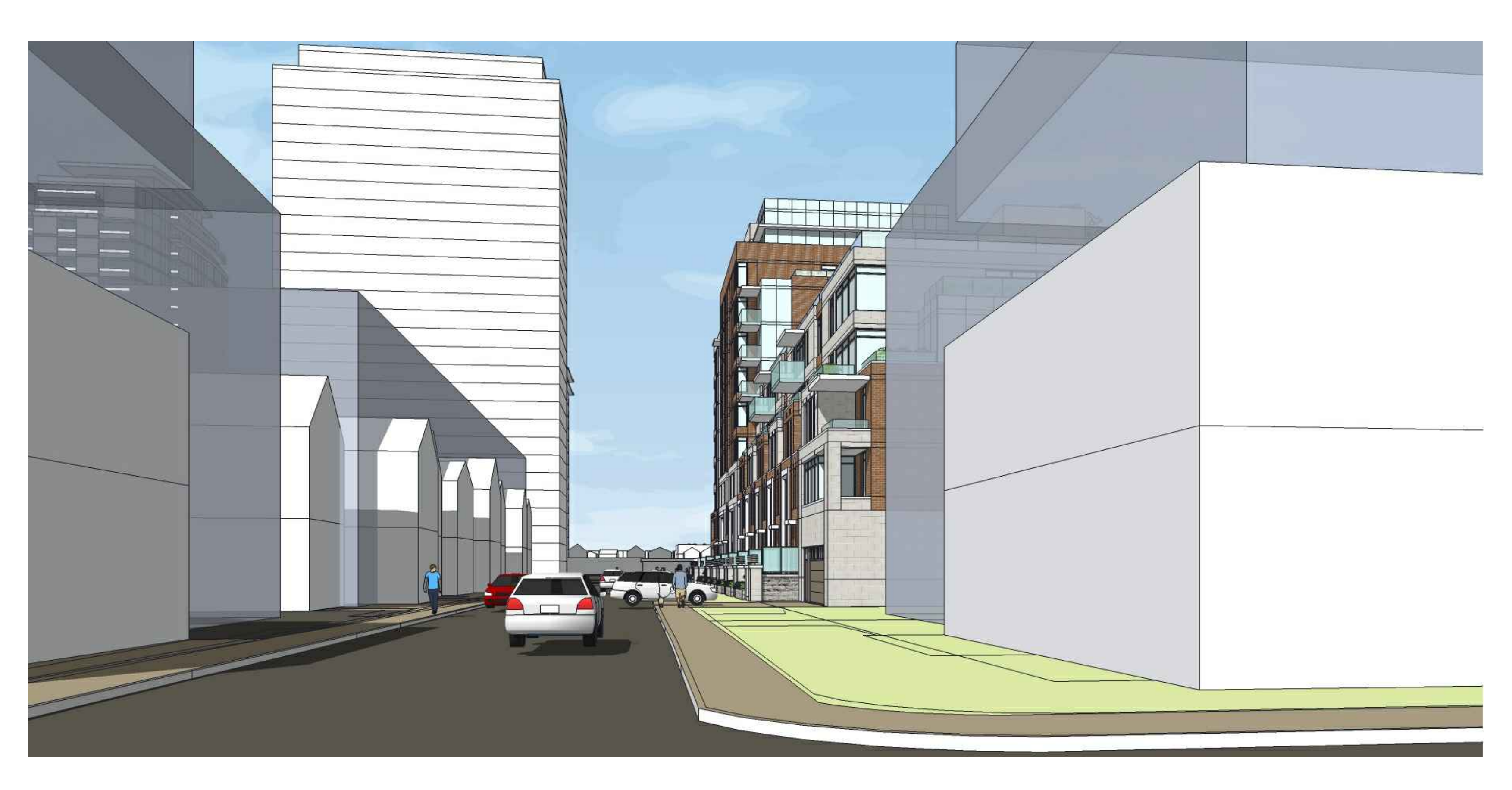
STREET VIEW LOOKING WEST FROM PRESTON