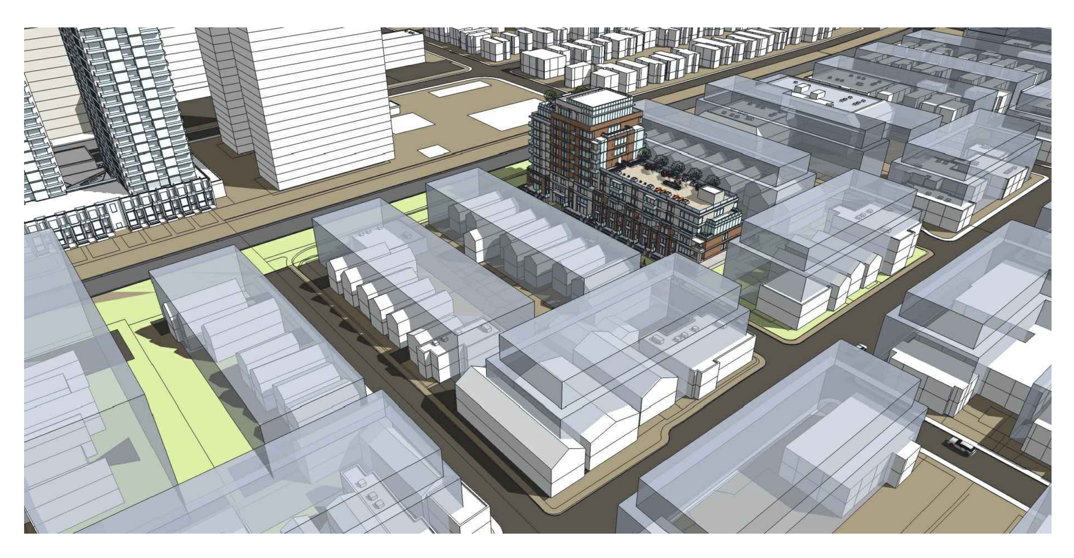
BIRD'S EYE VIEW LOOKING NORTHWEST