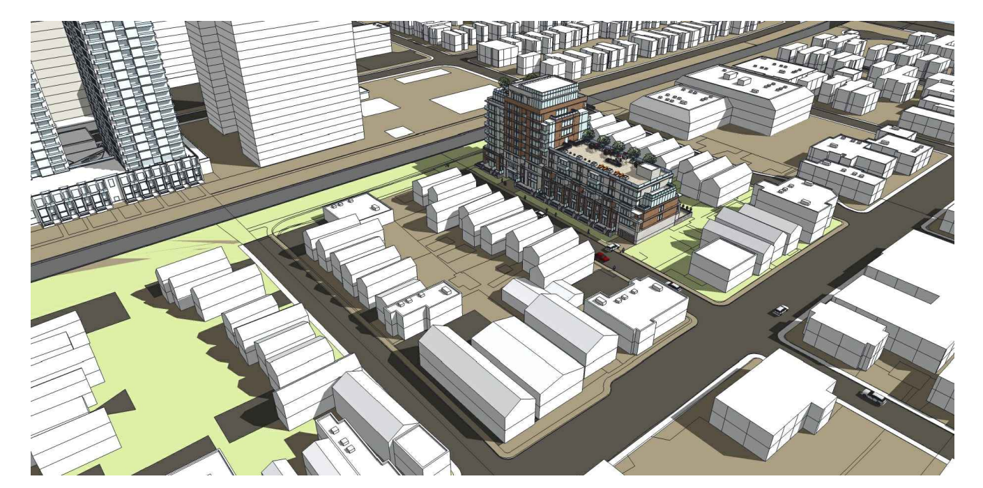
BIRD'S EYE VIEW LOOKING NORTHWEST