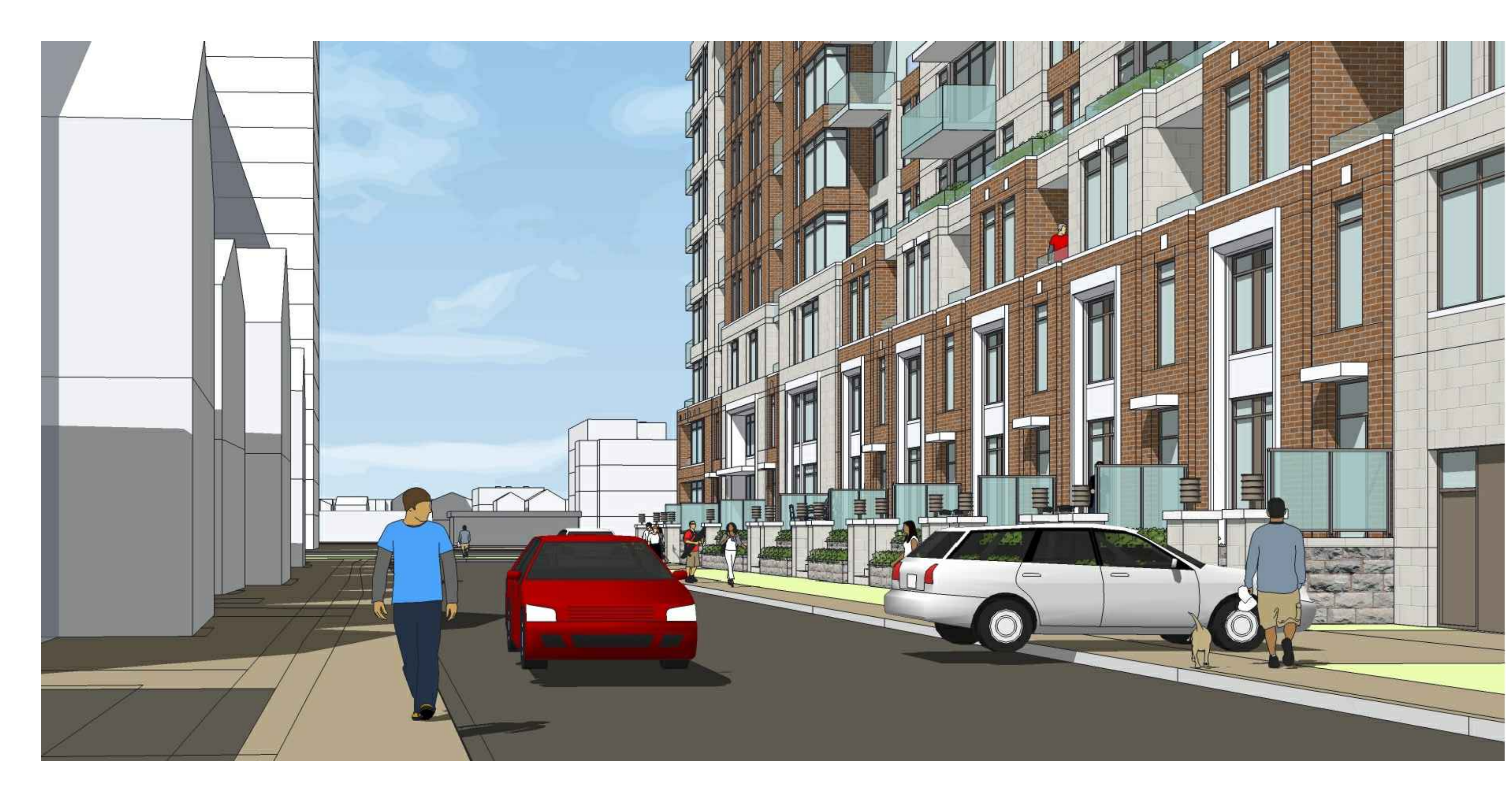
STREET VIEW LOOKING WEST ON NORMAN