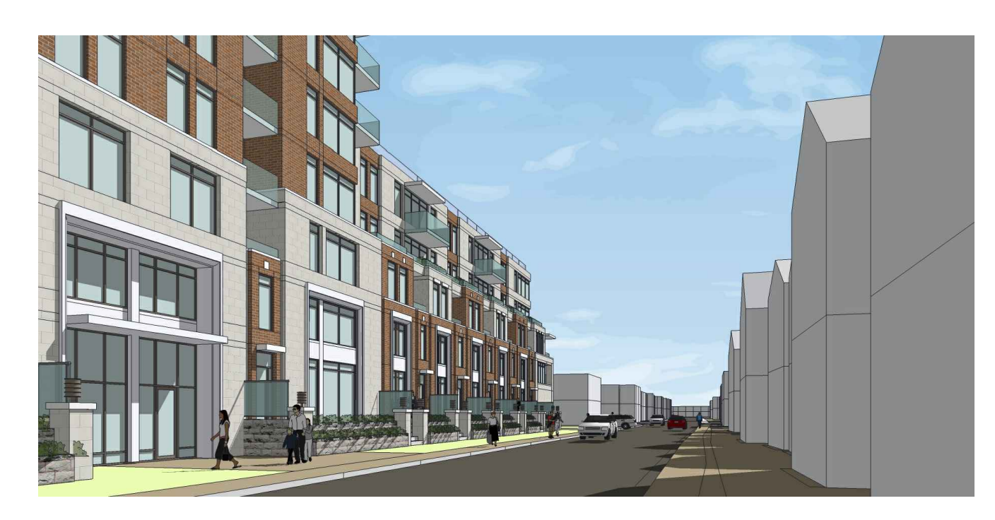
STREET VIEW LOOKING EAST FROM NORMAN