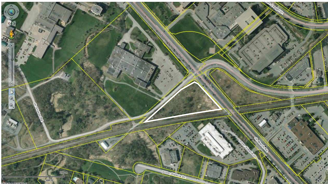
Figure 2: Extent of Development Site

We next evaluated the location of the trees and the proposed development and made recommendations on how the conservation of the trees could be maximized during design and construction.