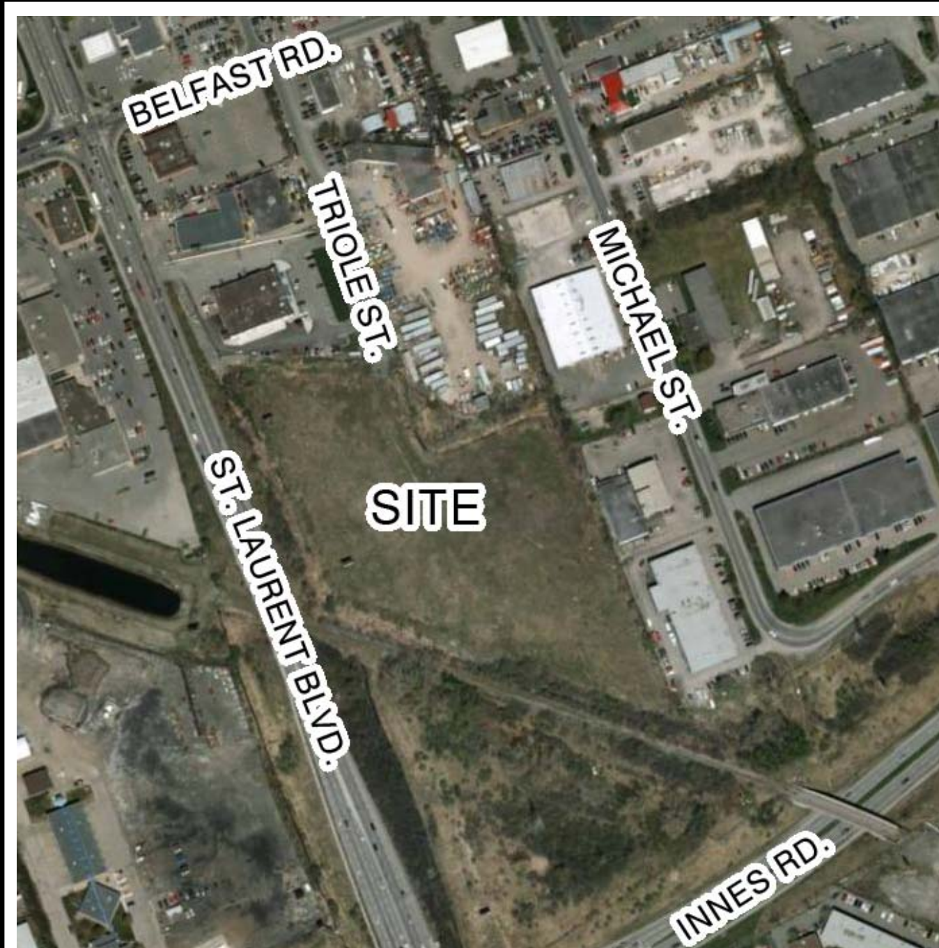
1 LOCATION PLAN SCALE N.T.S.