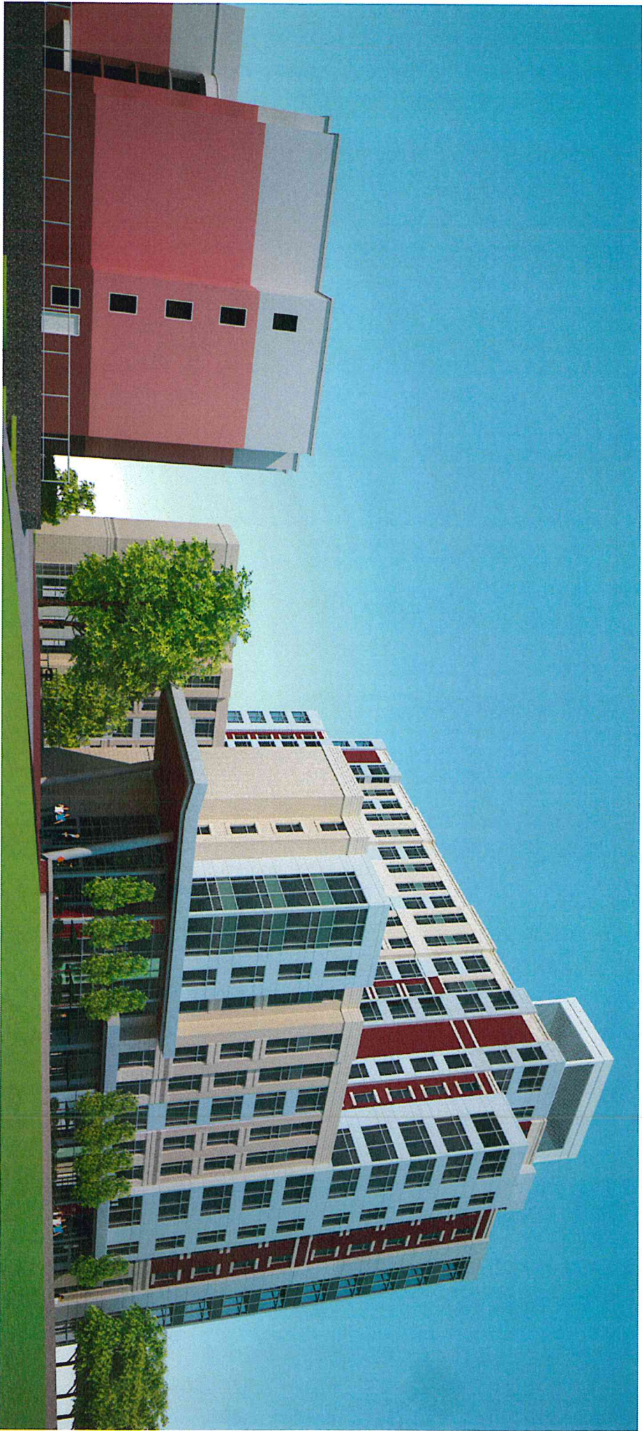
Ground level Southeast corner