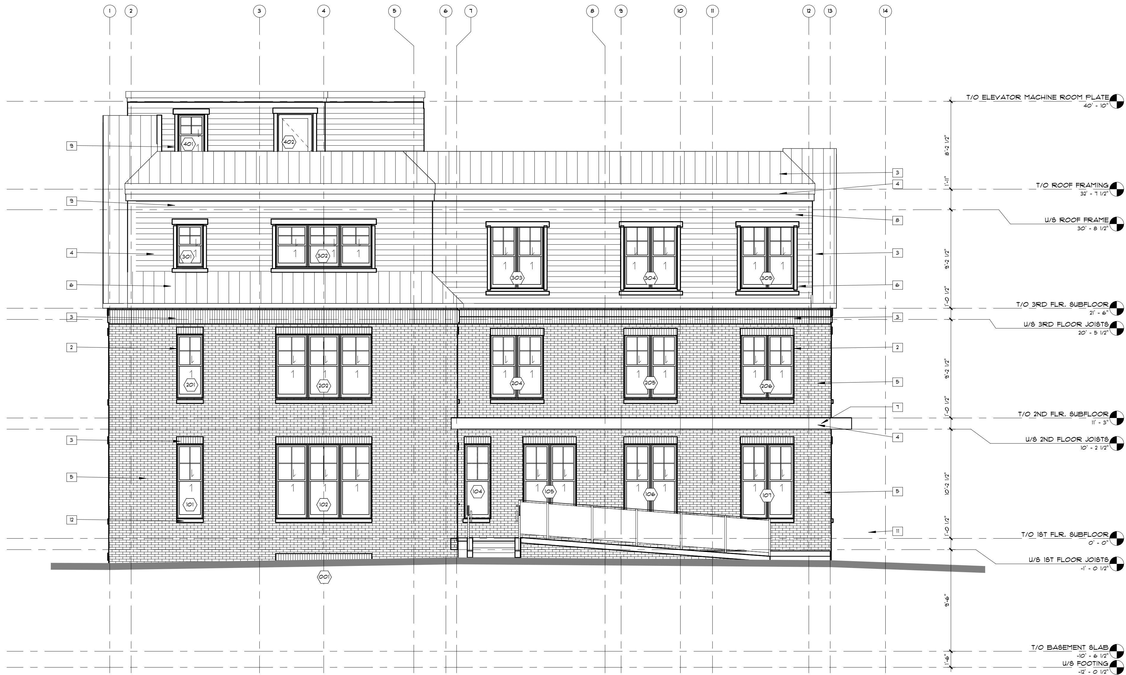
1 LEFT ELEVATION (COBOURG STREET) A.17 SCALE: 3/16" = 1'-0"

PRE-FINISHED METAL FLASHING: MIDNIGHT BLACK