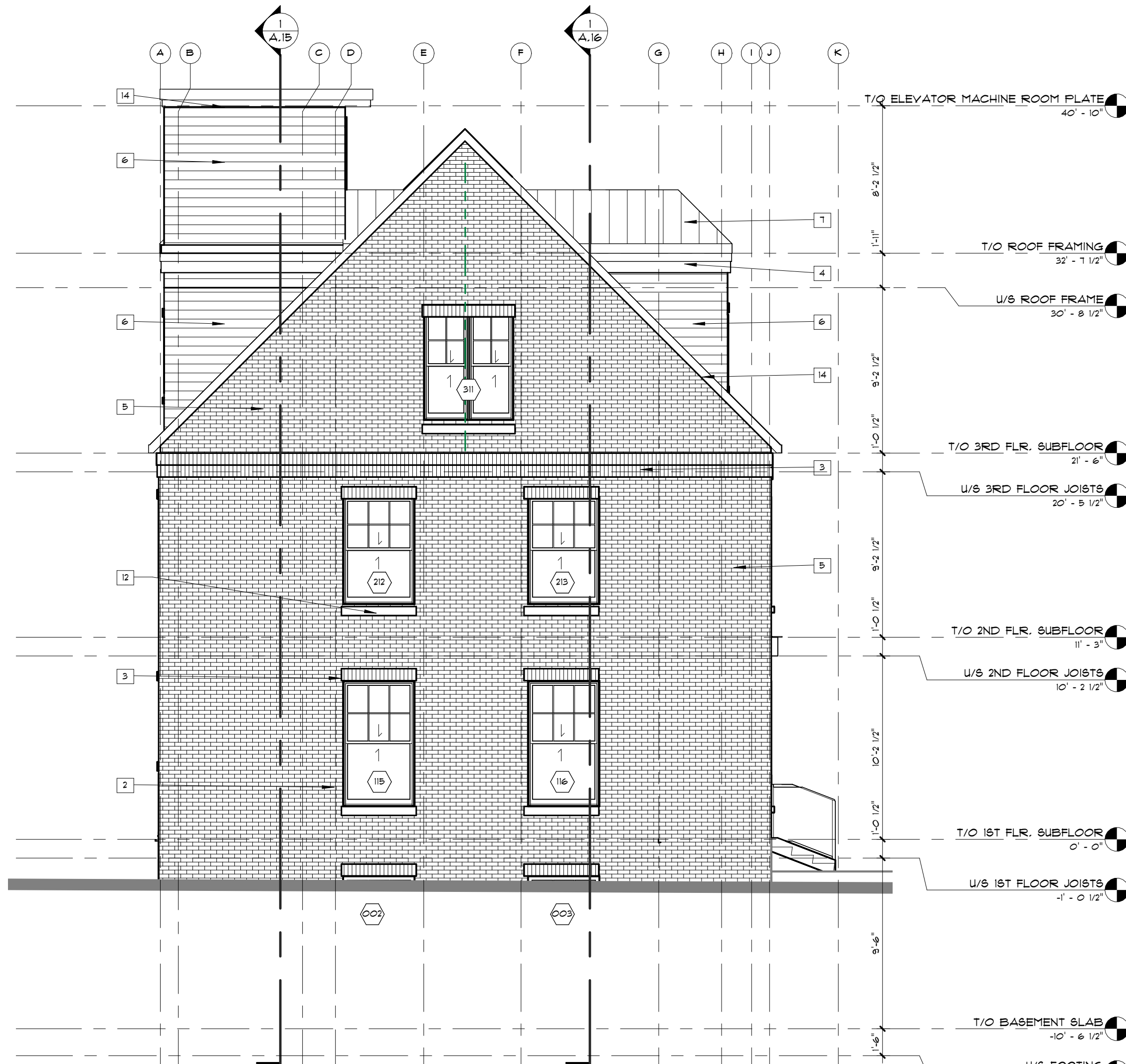
2 BACK ELEVATION A.19 SCALE: 3/16" = 1'-0"