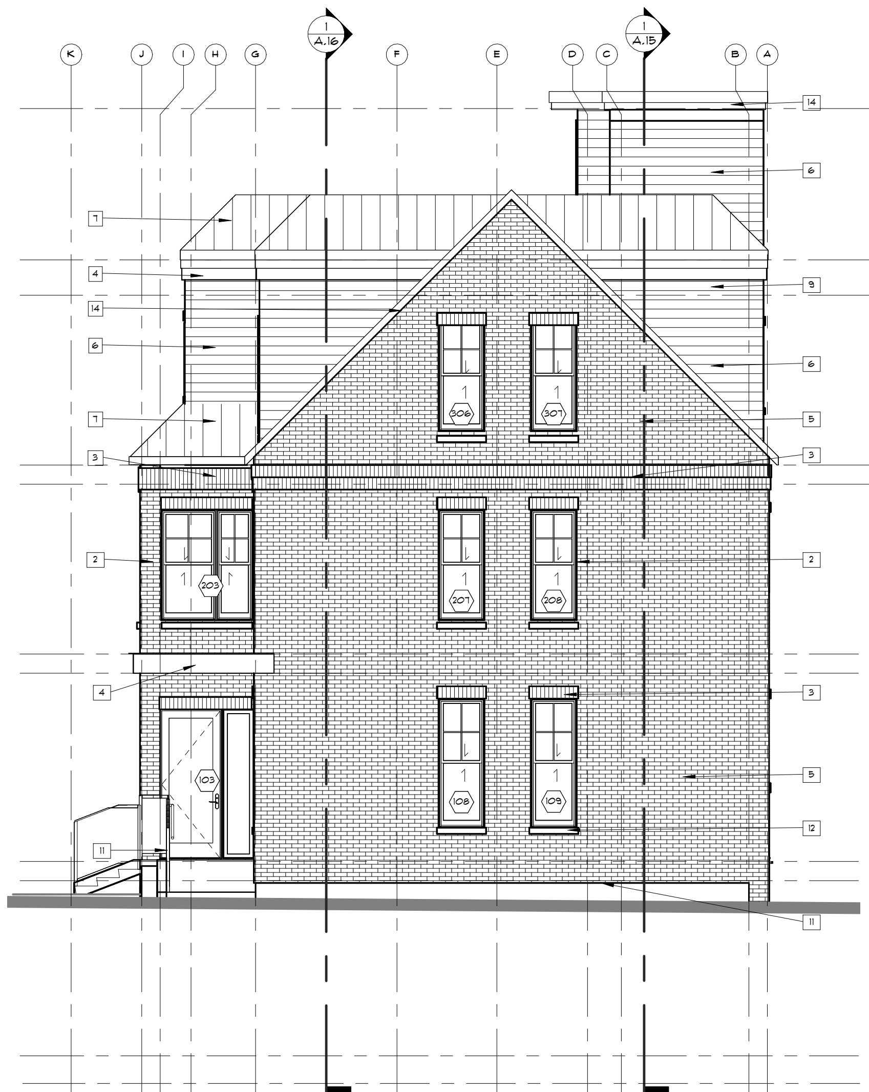
1 FRONT ELEVATION (WILBROD STREET) A.19 SCALE: 3/16" = 1'-0"