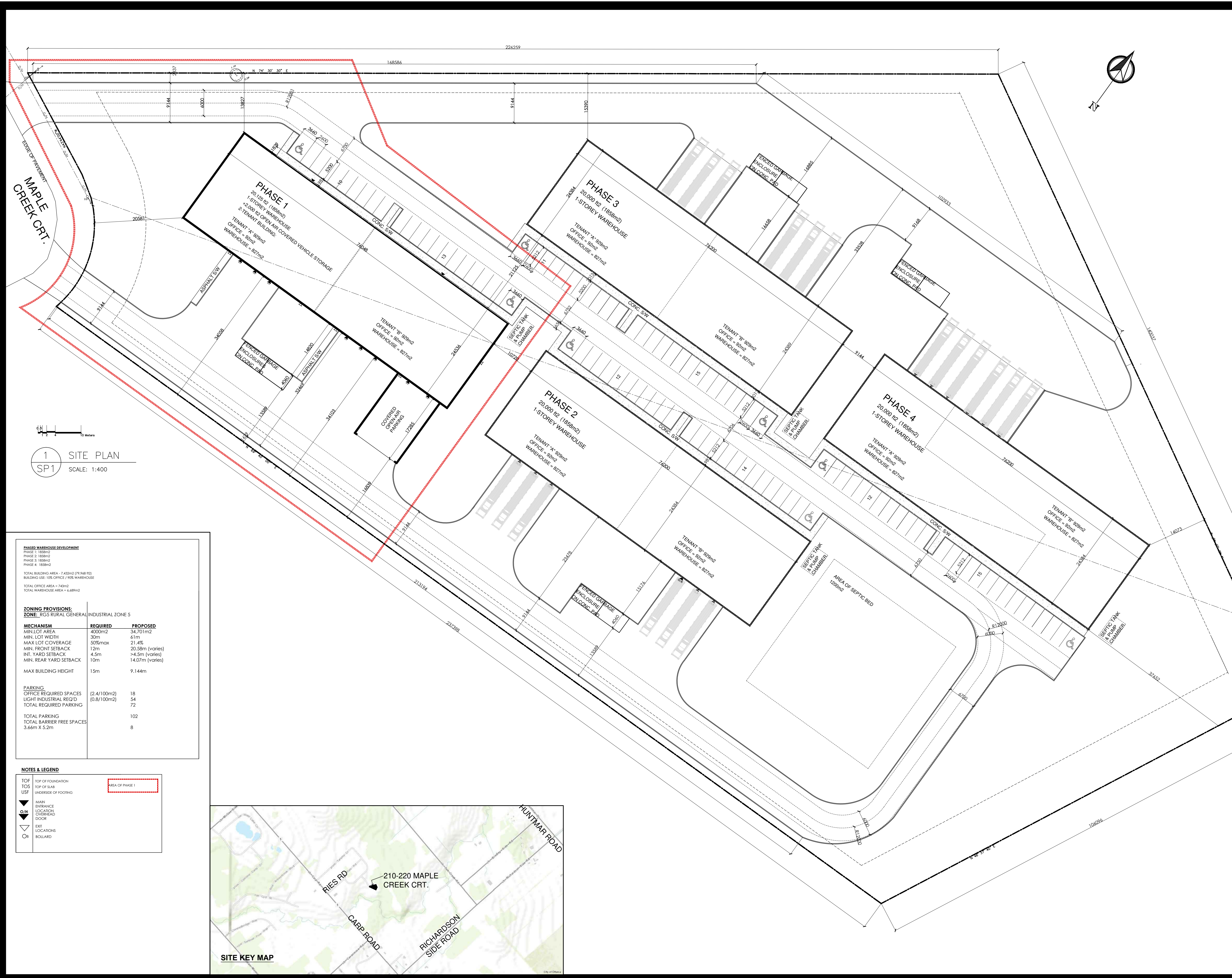
1 SITE PLAN SP1 SCALE: 1:400