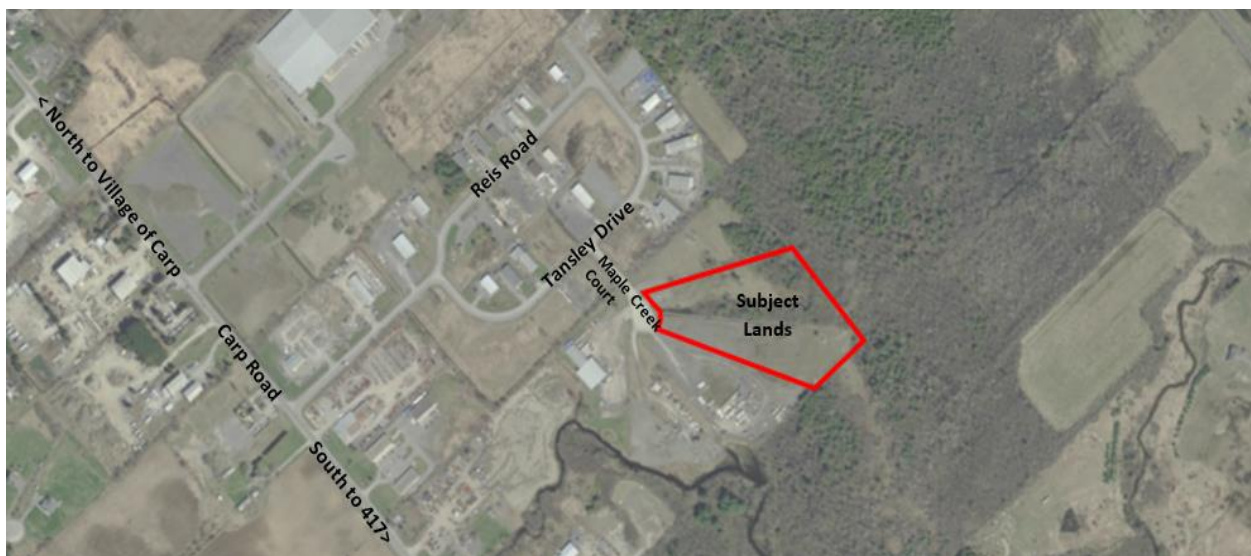
Figure 1: Location of Subject Lands

The subject lands are known municipally as 210 and 220 Maple Creek Court and are described legally as Parts 4 and 5 on Plan 4R-17169, Part of the North Half of Lot 7, Concession 2, Geographic Township of Huntley (former Township of West Carleton), and now in the City of Ottawa. The subject lands have an area of 34,701.1 square metres with frontage of 60.78 metres on the east side of the Maple Creek Court