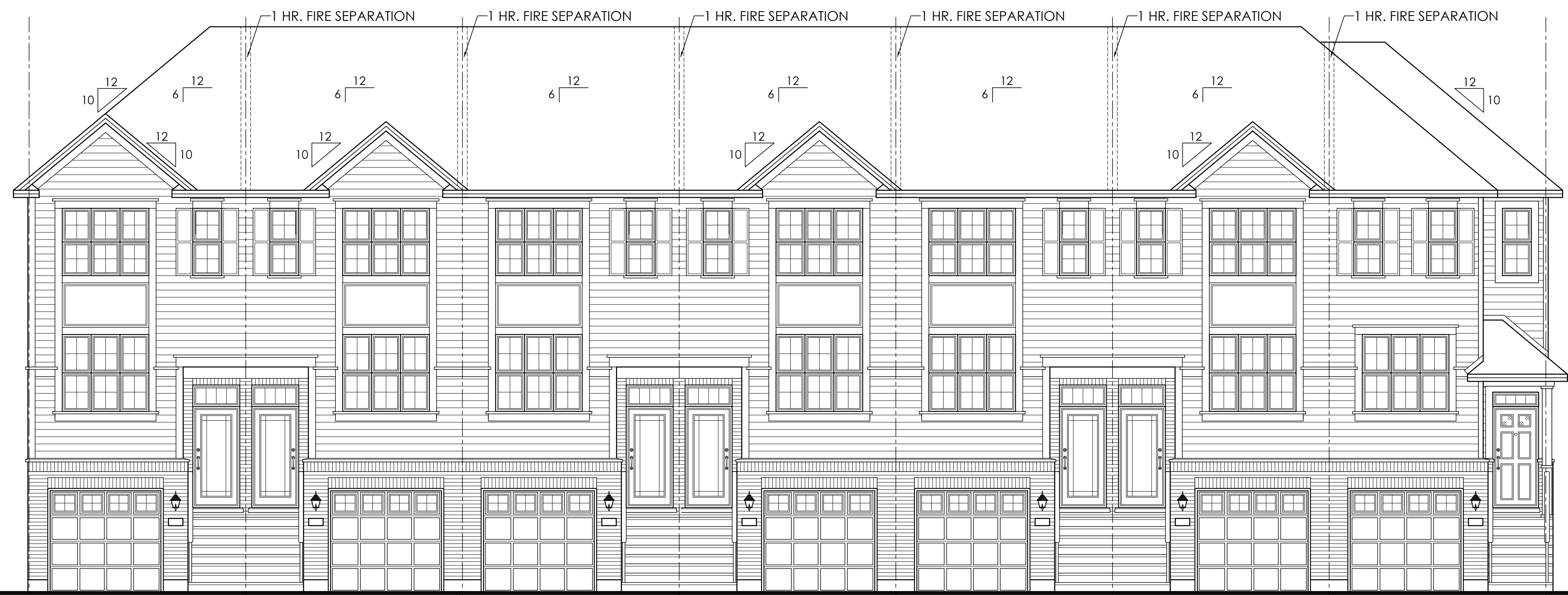
URBAN TOWN - 2 OPEN EXTERIOR UNIT URBAN TOWN - 1 OPEN INTERIOR UNIT (Rev.) URBAN TOWN - 2 OPEN INTERIOR UNIT URBAN TOWN - 1 OPEN INTERIOR UNIT (Rev.) URBAN TOWN - 2 OPEN INTERIOR UNIT URBAN TOWN - 1 OPEN INTERIOR UNIT (Rev.) URBAN TOWN - 1 OPEN EXTERIOR UNIT