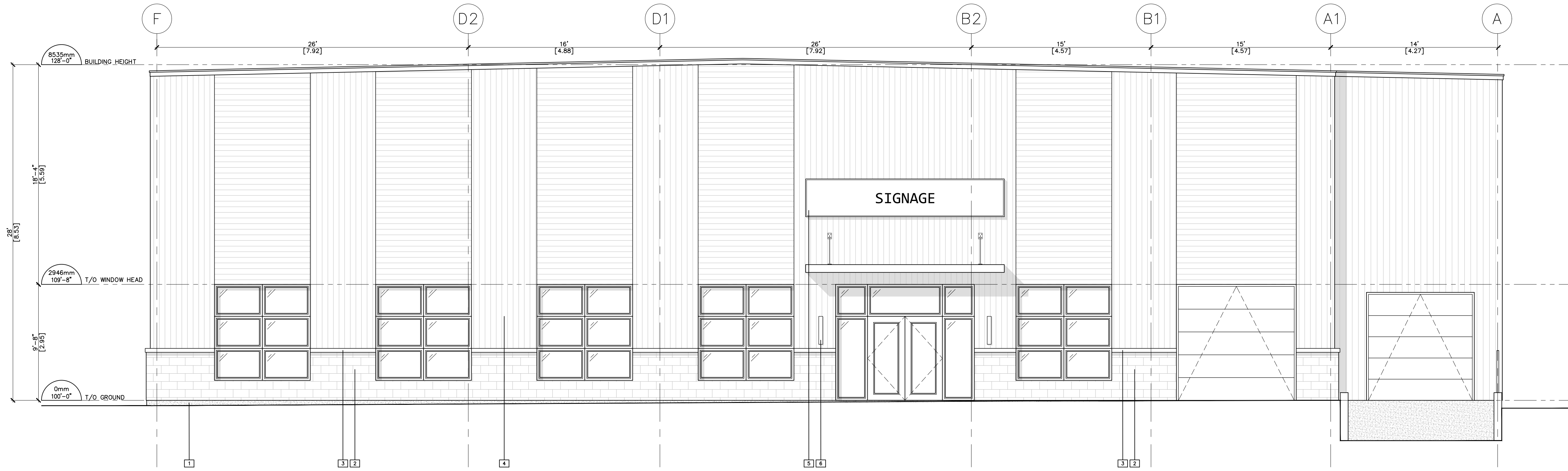
01 PROPOSED FRONT [SOUTH] ELEVATION A400 SCALE: 1:60

NOTE: ALL COLOUR & FINISH SELECTIONS TO BE COORDINATED, FINALIZED & APPROVED BY OWNER.