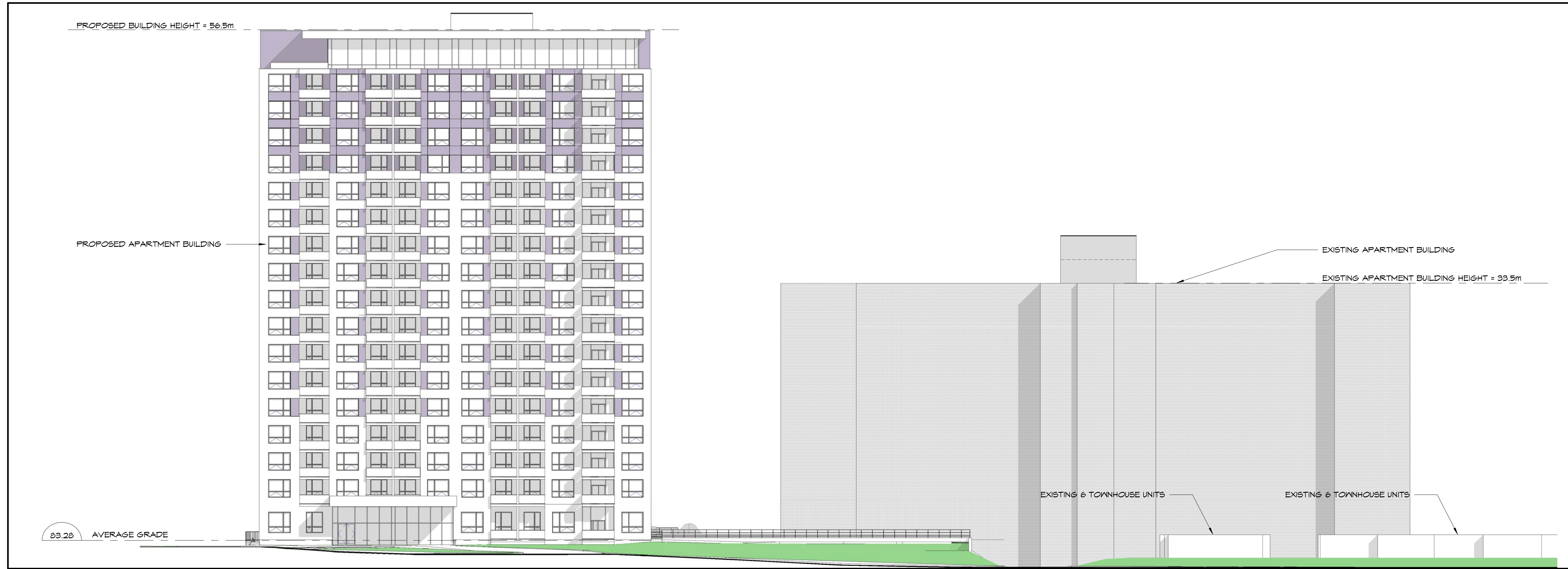
2 SITE SECTION - WEST-EAST A5 SCALE: 1:250

Client: LS GP Inc. 2193 Arch Street, Ottawa, Ontario.