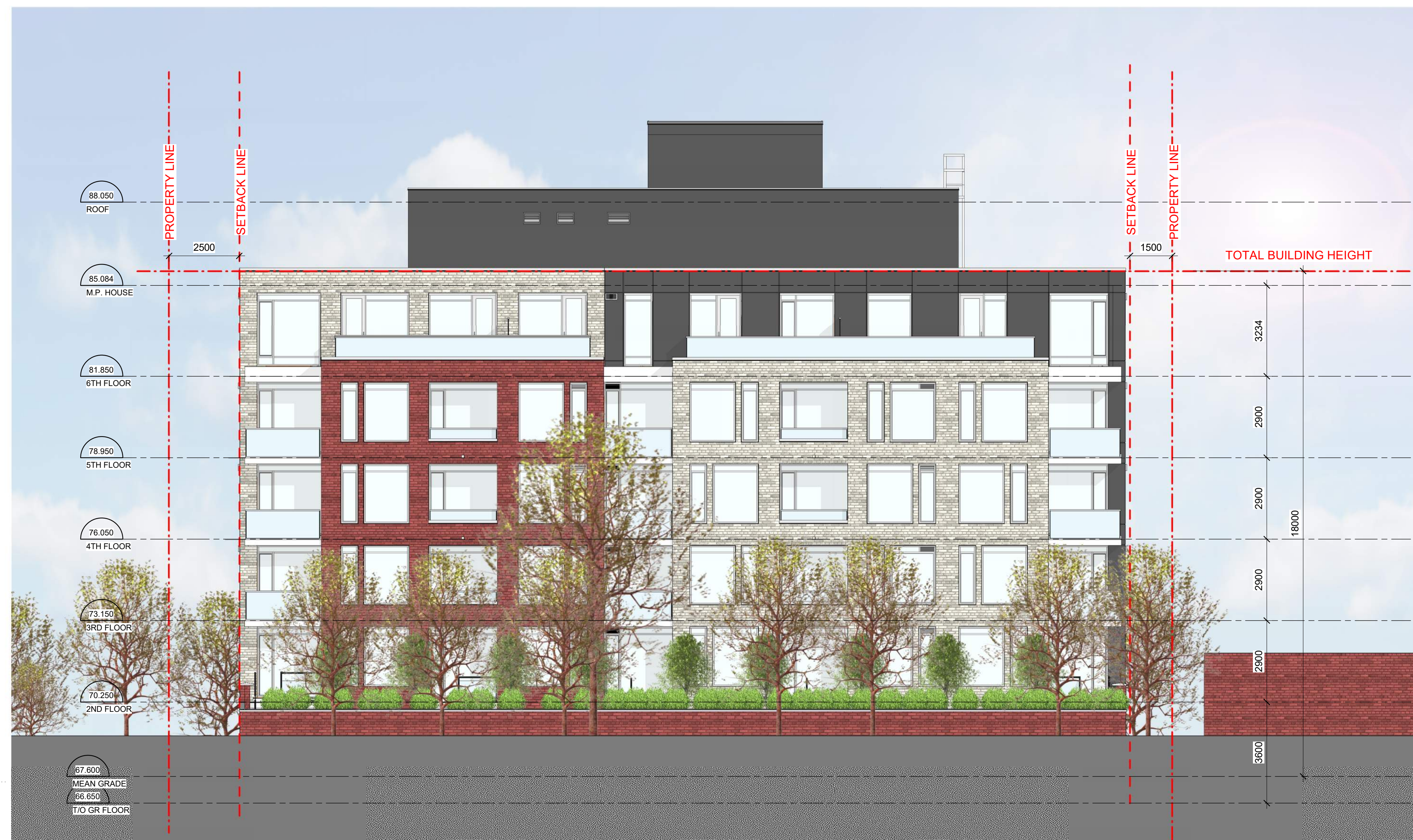
1 SOUTH ELEVATION. A 201 1:100

IT IS THE RESPONSIBILITY OF THE APPROPRIATE CONTRACTOR TO CHECK AND VERIFY ALL DIMENSIONS ON SITE AND TO REPORT ALL ERRORS AND/OR OMISSIONS TO THE ARCHITECT. ALL CONTRACTORS MUST COMPLY WITH ALL PERTINENT CODES AND BY-LAWS. THIS DRAWING MAY NOT BE USED FOR CONSTRUCTION UNTIL SIGNED BY THE ARCHITECT. DO NOT SCALE DRAWINGS. COPYRIGHT RESERVED.