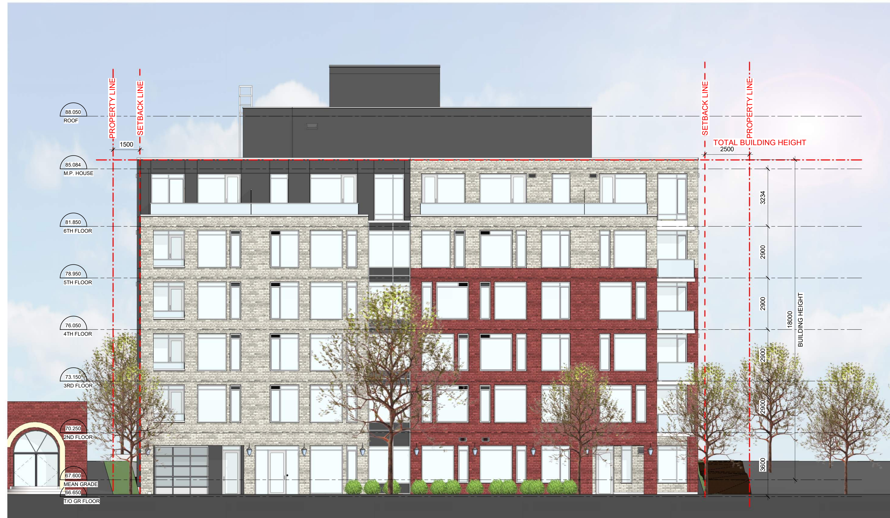
2 NORTH ELEVATION. A 201 1:100