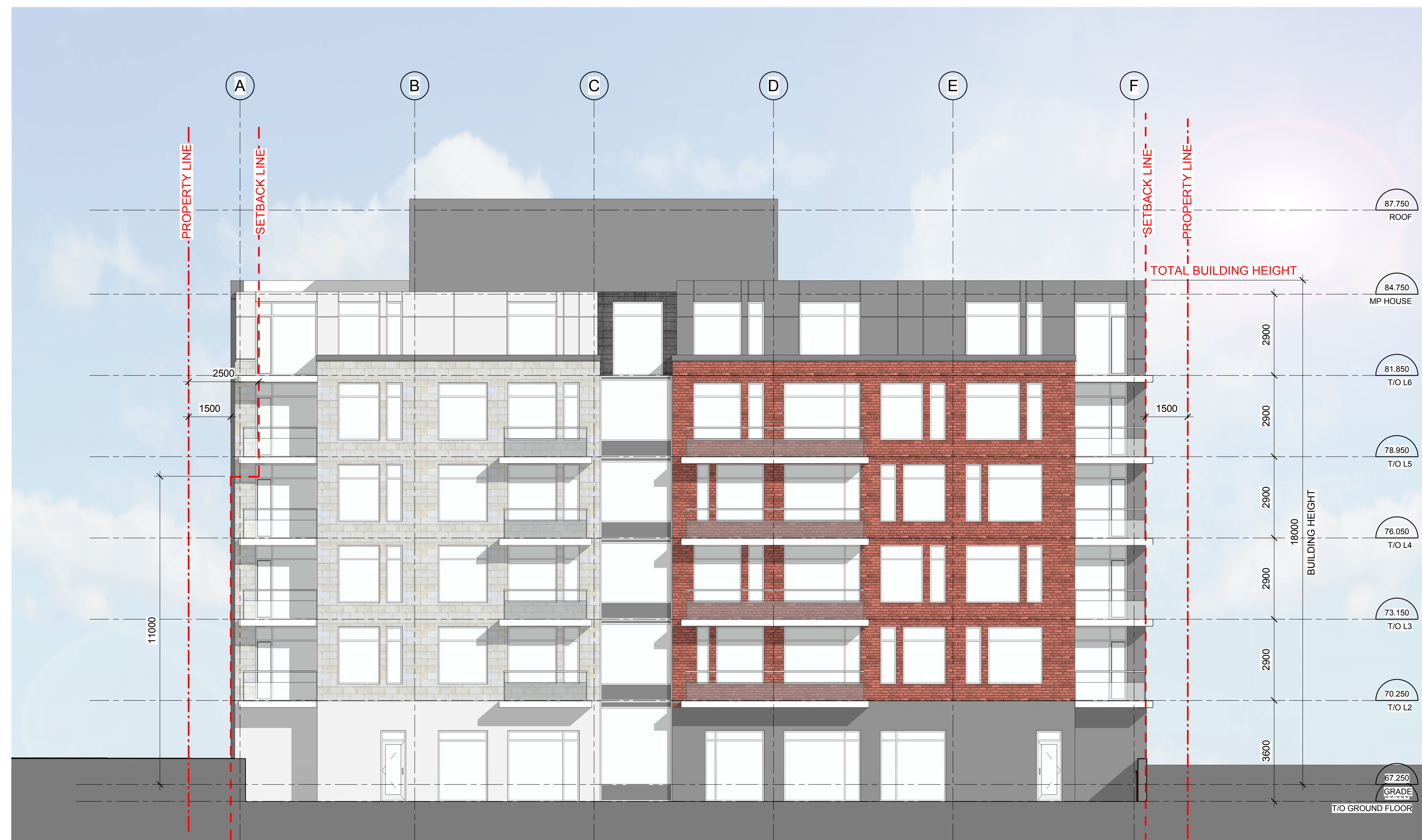
1 SOUTH ELEVATION. A201 1:100

IT IS THE RESPONSIBILITY OF THE APPROPRIATE CONTRACTOR TO CHECK AND VERIFY ALL DIMENSIONS ON SITE AND TO REPORT ALL ERRORS AND/OR OMISSIONS TO THE ARCHITECT. ALL CONTRACTORS MUST COMPLY WITH ALL PERTINENT CODES AND BY-LAWS. THIS DRAWING MAY NOT BE USED FOR CONSTRUCTION UNTIL SIGNED BY THE ARCHITECT. DO NOT SCALE DRAWINGS. COPYRIGHT RESERVED.