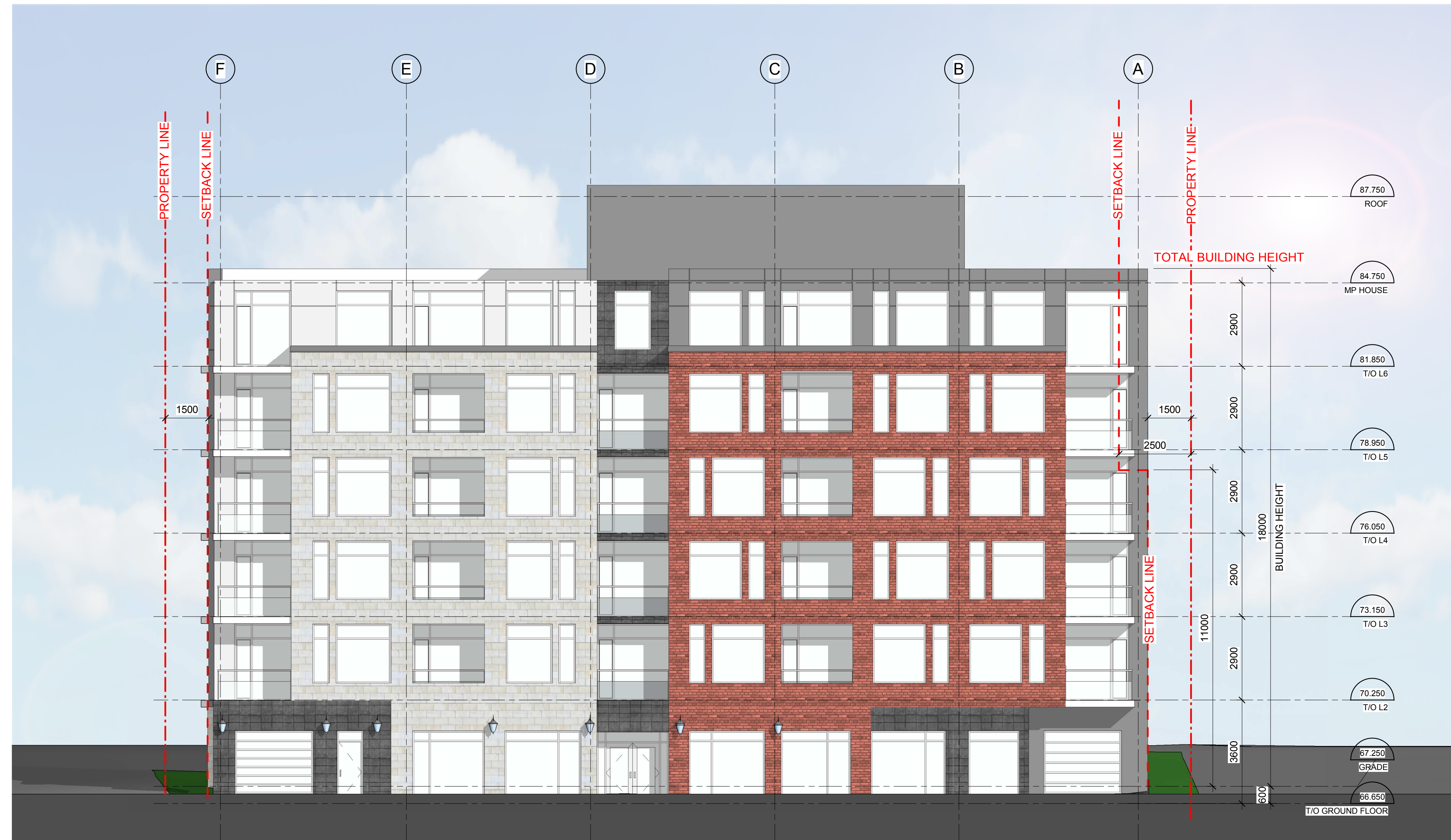
2 NORTH ELEVATION. A201 1:100