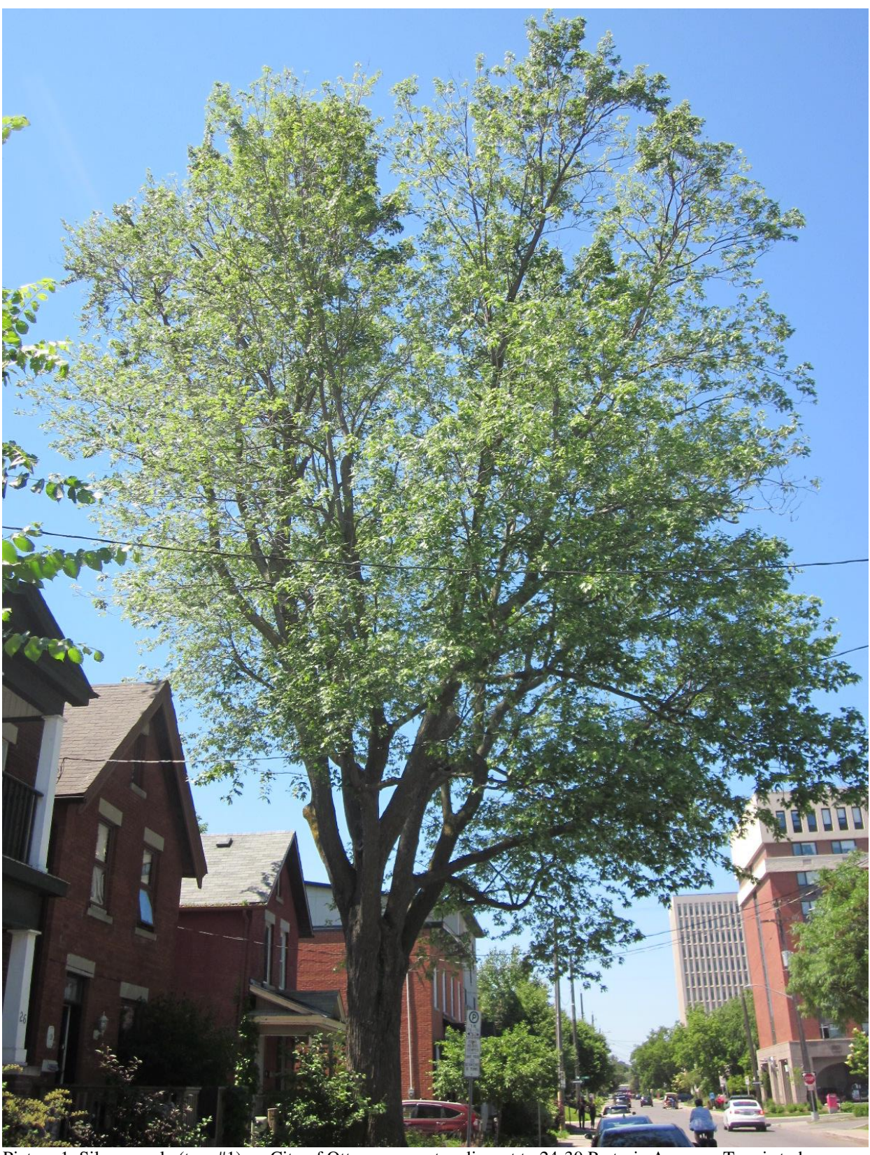
Picture 1. Silver maple (tree #1) on City of Ottawa property adjacent to 24-30 Pretoria Avenue. Tree is to be removed.