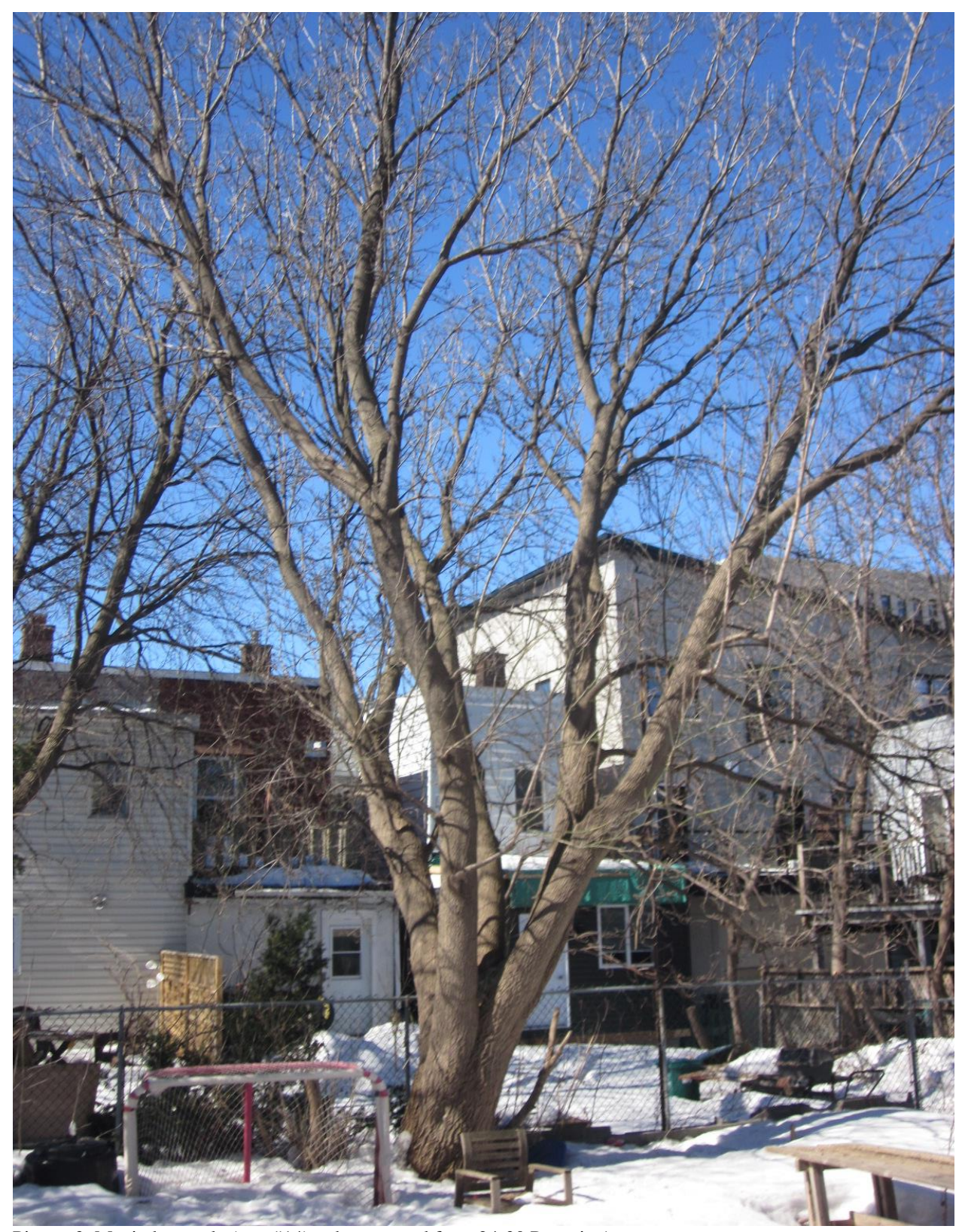
Picture 3. Manitoba maple (tree #14) to be removed from 24-30 Pretoria Avenue.