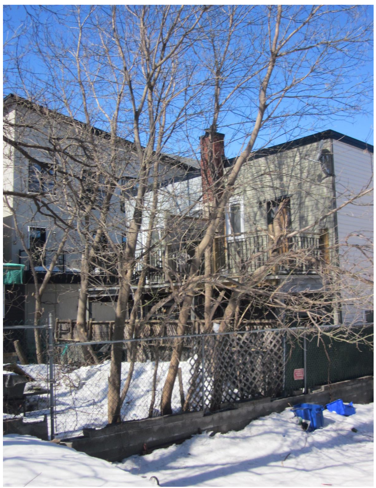
Picture 4. Manitoba maple grouping (#15) to be preserved and protected adjacent to 24-30 Pretoria Avenue.