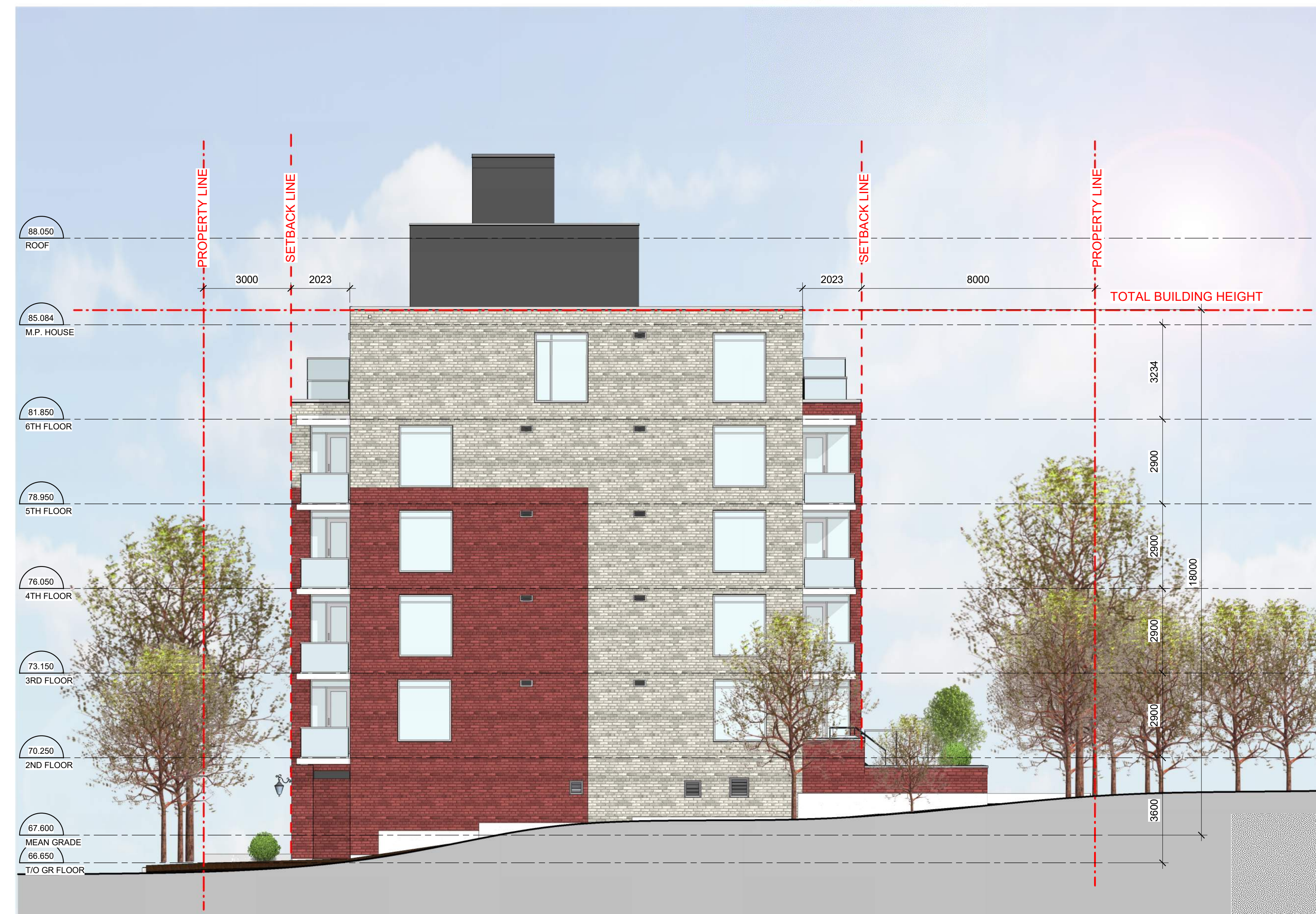
2 WEST ELEVATION. A 202 1:100

IT IS THE RESPONSIBILITY OF THE APPROPRIATE CONTRACTOR TO CHECK AND VERIFY ALL DIMENSIONS ON SITE AND TO REPORT ALL ERRORS AND/OR OMISSIONS TO THE ARCHITECT. ALL CONTRACTORS MUST COMPLY WITH ALL PERTINENT CODES AND BY-LAWS. THIS DRAWING MAY NOT BE USED FOR CONSTRUCTION UNTIL SIGNED BY THE ARCHITECT. DO NOT SCALE DRAWINGS. COPYRIGHT RESERVED.