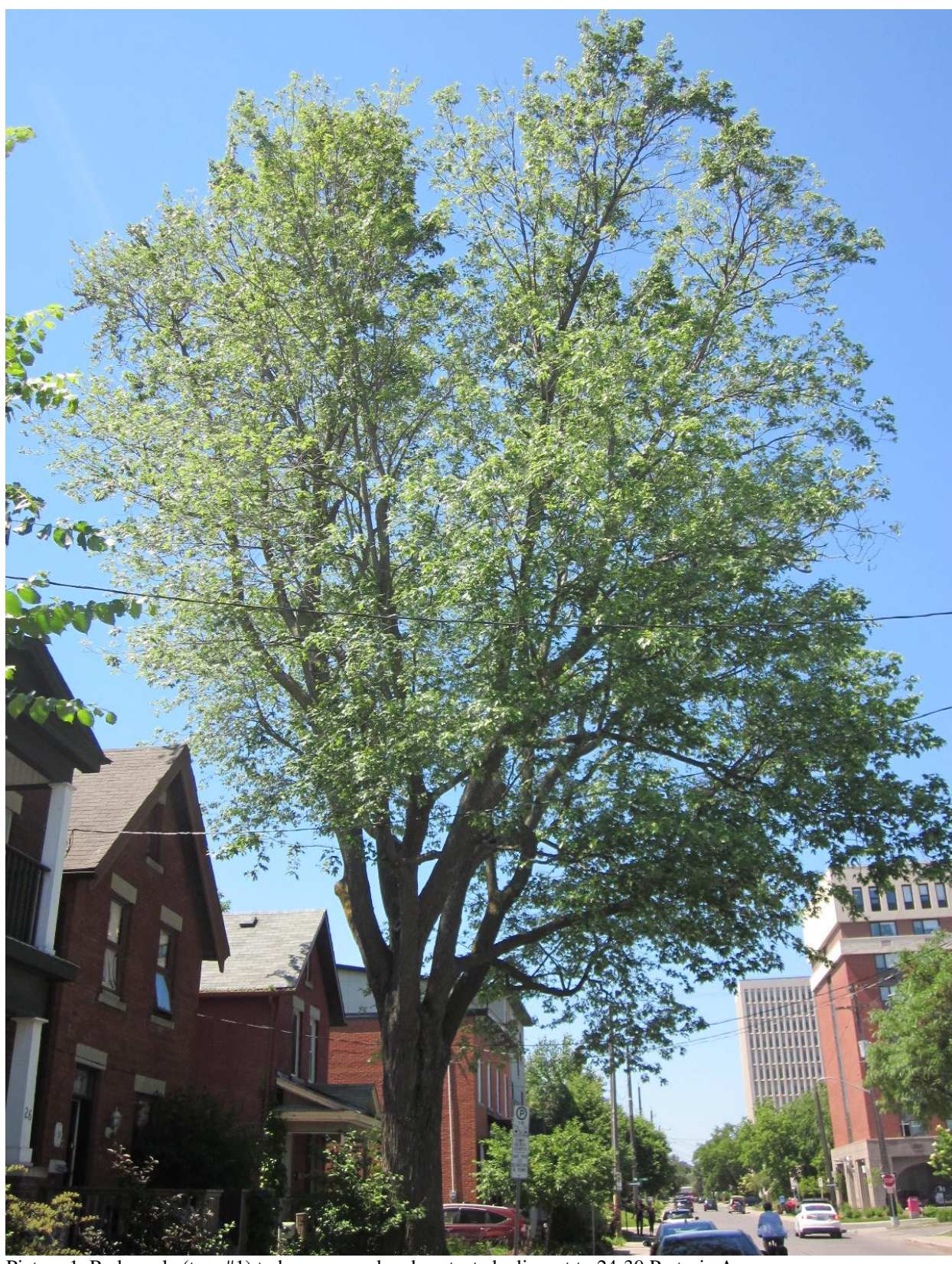
Picture 1. Red maple (tree #1) to be preserved and protected adjacent to 24-30 Pretoria Avenue.