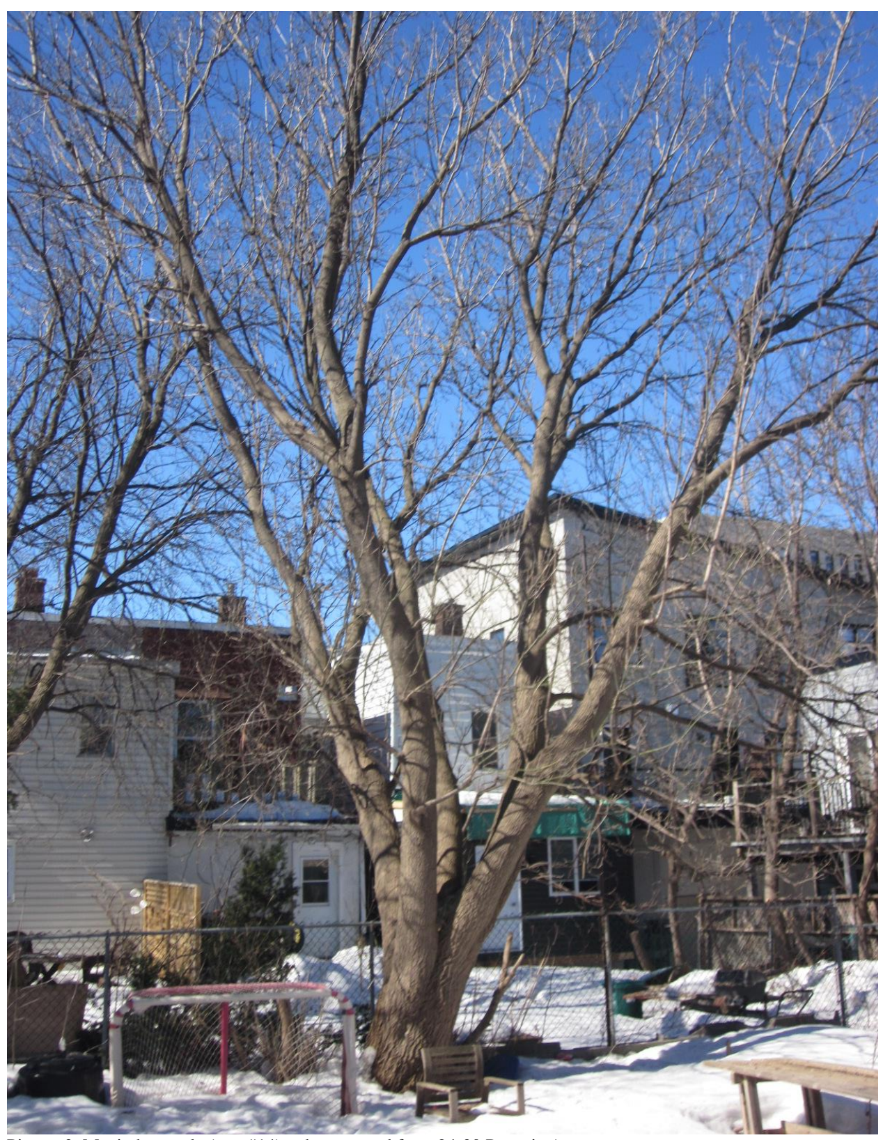
Picture 3. Manitoba maple (tree #14) to be removed from 24-30 Pretoria Avenue.