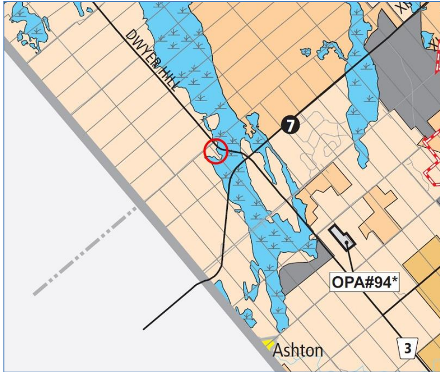
Figure 4. City of Ottawa Official Plan, Schedule A, Rural Policy Plan. Property boundary is within the red circle. Light orange represents General Rural designation, blue marks Significant Wetland.

The General Rural Area allows for a variety of development, including non-residential uses. The nature of the operation and land requirements of the Wild Bird Care Centre is most appropriate in a rural, rather than a Village or urban area.