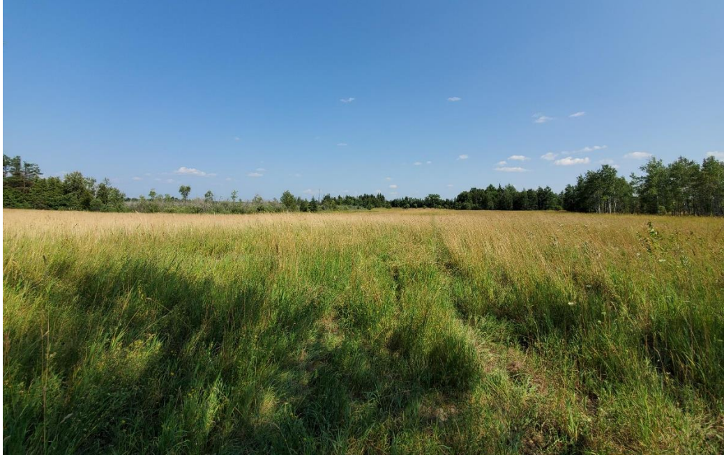
Figure 1. Property prior to plowing, facing south.