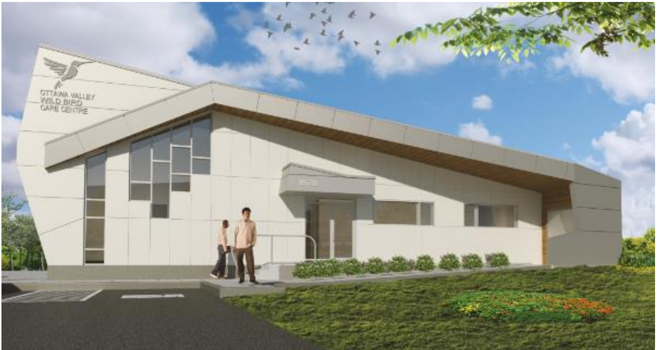
Figure 3. Proposed Wild Bird Care Centre, front view.

For planning purposes, the proposed Wild Bird Care Centre is considered to fall under the use of 'animal hospital' as defined in the City of Ottawa's Official Zoning Bylaw (Ottawa Letter 19 July 2018, Appendix 2). A 25-space parking lot is planned to the north east of the main building. A well is planned to the north west of the building, and a septic tank and leaching bed is planned to the east of the building. A waterfowl pond is planned to the west of the building and may serve as a reservoir for fire suppression purposes.