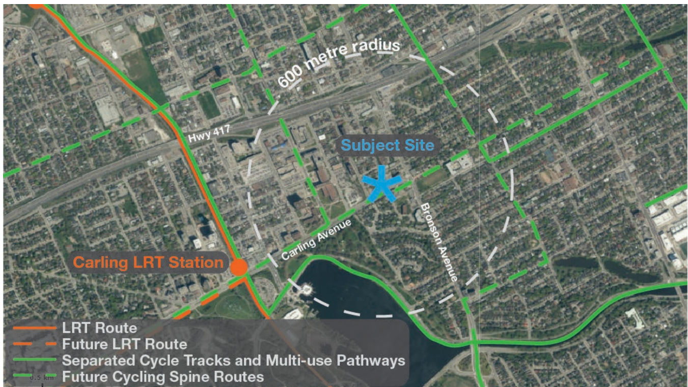
Figure 4: Transit and Active Transportation Network

The site is well-served by an expanding cycle and active-transportation network, as shown in Figure 4. Carling Avenue is designated as a future cycling Spine Route, connecting the site to multiple cycle connections to the east and west. The site is also within 400 metres of the multi-use pathway route that follows the Rideau Canal and the Trillium O-Train line.