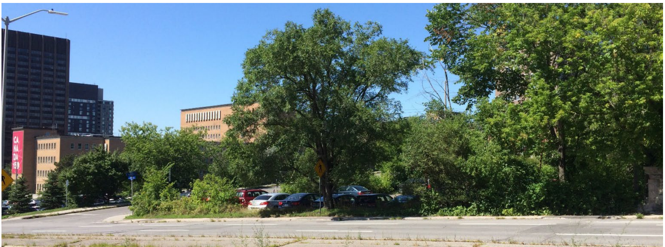
Figure 2: Carling Street Frontage (Looking North)