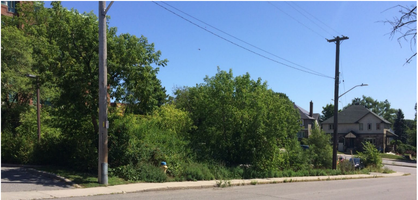
Figure 1: Bell Street Frontage (Looking South)

The subject site is legally known as Lot 10 and Part of Lots 8, 9 and 11 on Registered Plan 31326 in the City of Ottawa. It is currently owned by the City of Ottawa and is occupied by a 30-space surface parking lot. As shown in Figure 1 and Figure 2, the site is characterized by significant grade changes, both internal to the site and along Bell Street South. Mature trees and hedgerow are found around the perimeter of the site.