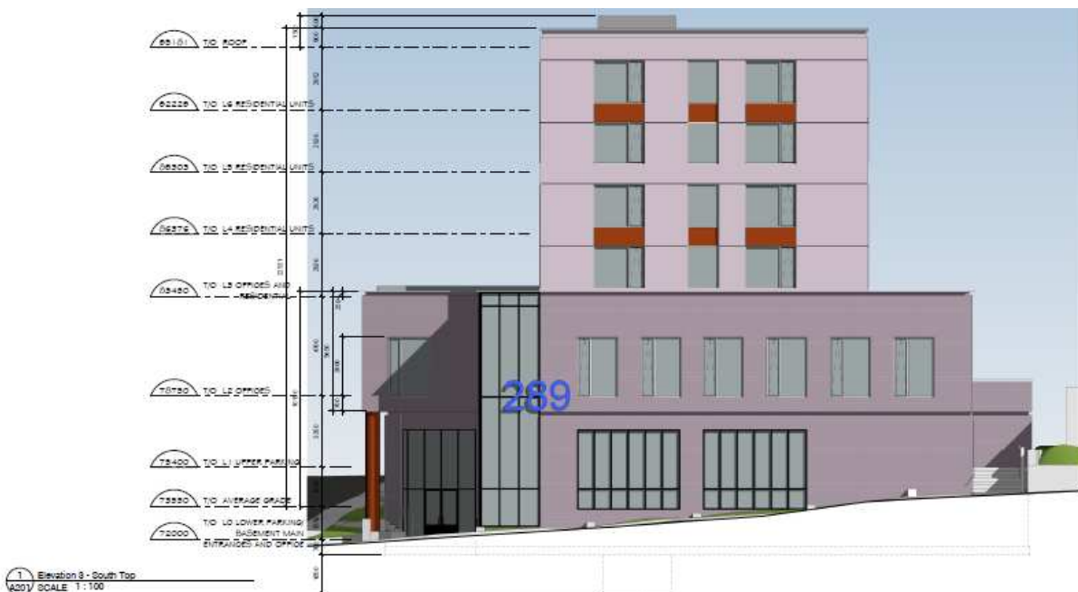
Figure 5: Carling Elevation

To respect the existing amenity space to the east of the subject site, which is located above a parking structure, the tower portion of the building is proposed to be set back approximately 8 metres from the side property lines. The north-south orientation of the tower minimizes shadowing impacts, while framing Carling Avenue with an appropriately massed built form that reflects existing buildings along the street.