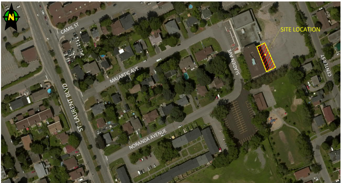
Figure 1: Key Map: 641 Saden Avenue, Ottawa

The proposed development consists of a 335 m 2 3-storey school addition to the existing building. Existing parking and drive aisles will remain throughout the site along with landscaping. The existing site accesses for the development will be maintained.