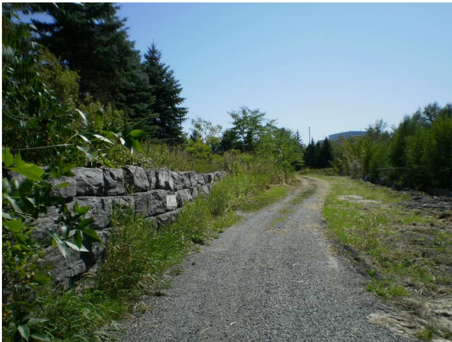
Photo 8 – Access trail, retaining, wall, berm and coniferous plantings on and adjacent to the east edge of the site. View looking south from the north property line