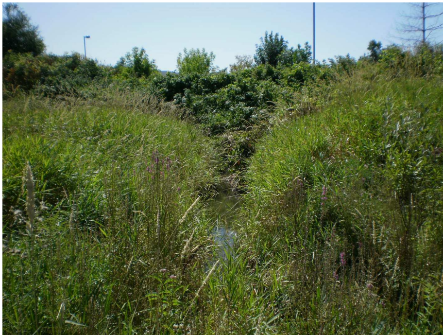
Photo 6 – Meadow habitat on-site to the east of Shirley’s Brook. View looking west