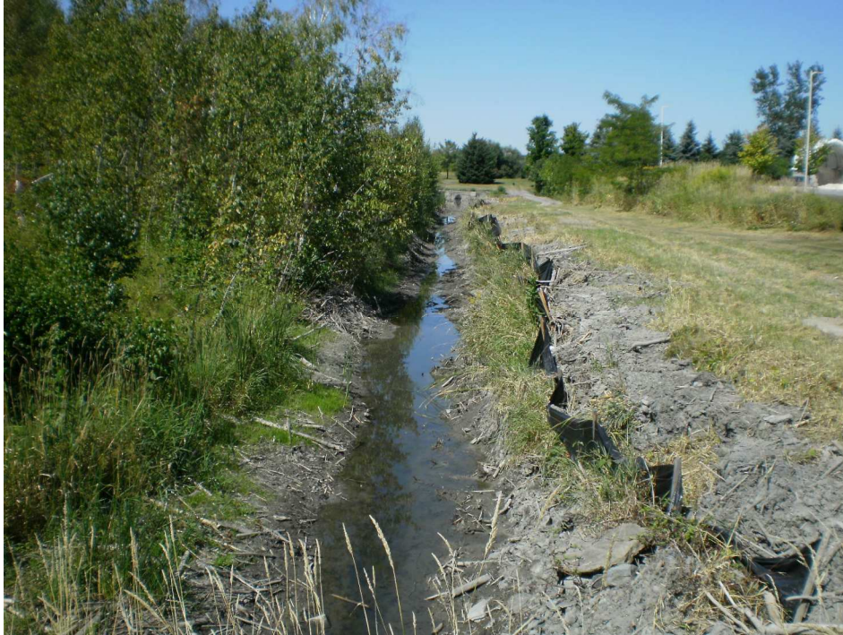
Photo 7 – North-south stormwater channel in the stormwater easement in the east edge of the site. View looking north from Solandt Road