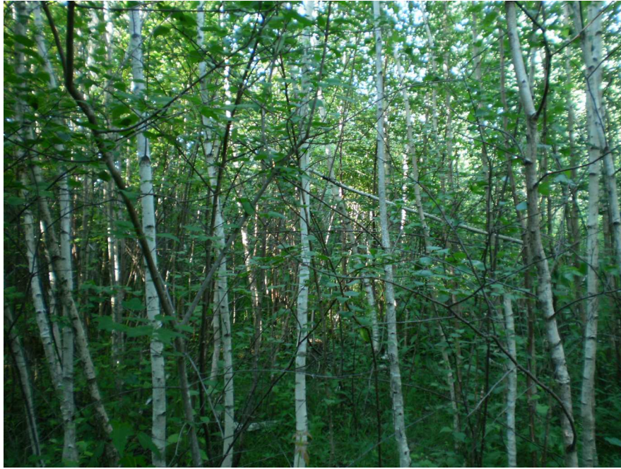
Photo 3 – Young birch were dominant in the west portion of the upland deciduous forest. View looking southwest