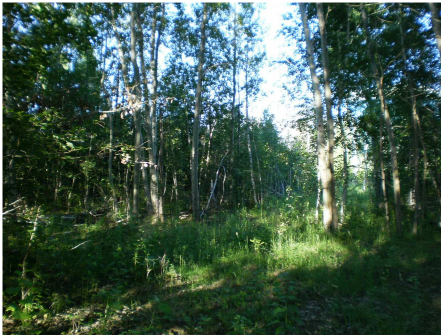
Photo 2 – There are many open areas in the upland deciduous forest. This example is in the central portion of the forest, with view looking west