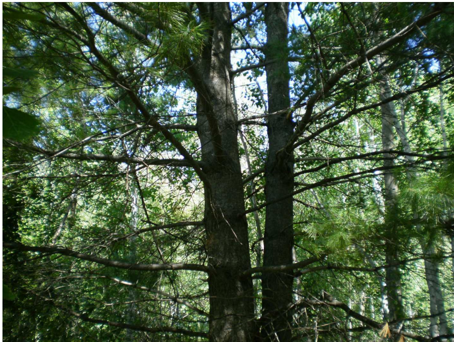
Photo 4 – The largest trees on-site were a couple of white pines in the south portion of the upland forest. This example is in the southwest corner of the site. View looking north