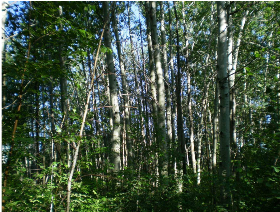
Photo 1 – Typical poplar trees in the centre portion of the upland deciduous forest. View looking northwest

east portion of the forest (Photo 9). No cavity trees, stick nests, or other evidence of raptor use were observed on or adjacent to the site.