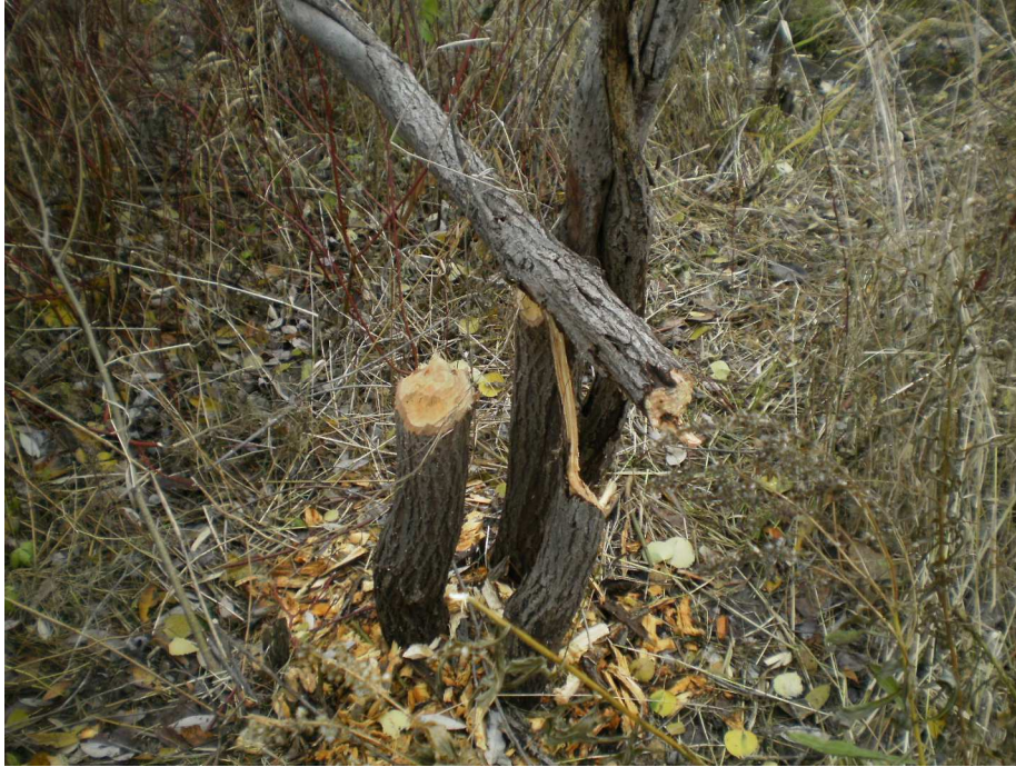
Photo 9 – Beaver cutting in the east edge of the site, west of the stormwater channel