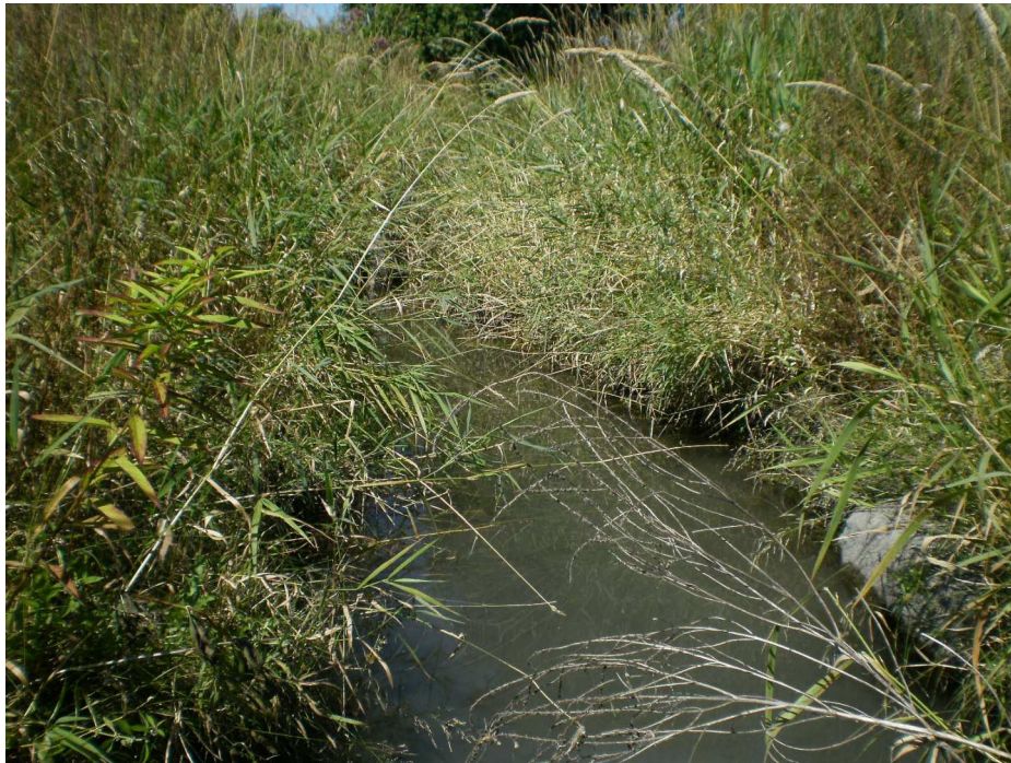
Photo 5 – Shirley’s Brook is the northwest edge of the site. View looking north