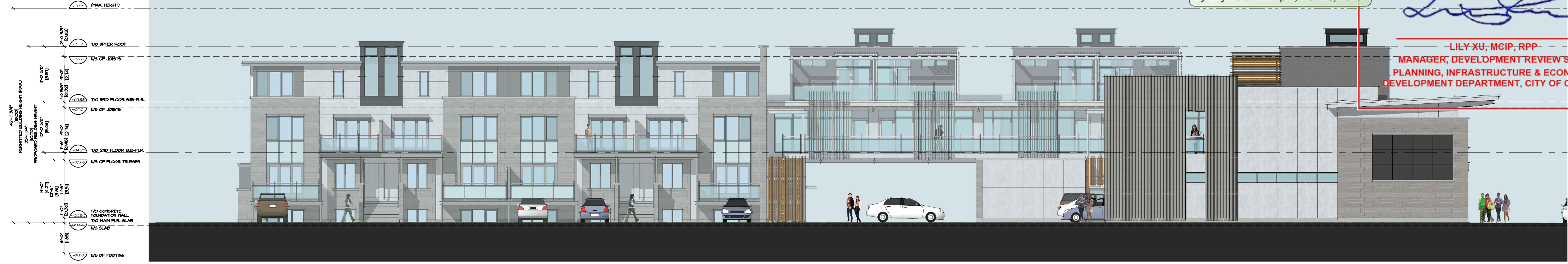
4 EAST (SIDE) ELEVATION SCALE: 1:125

APPROVED By Lily Xu at 2:24 pm, Nov 26, 2020