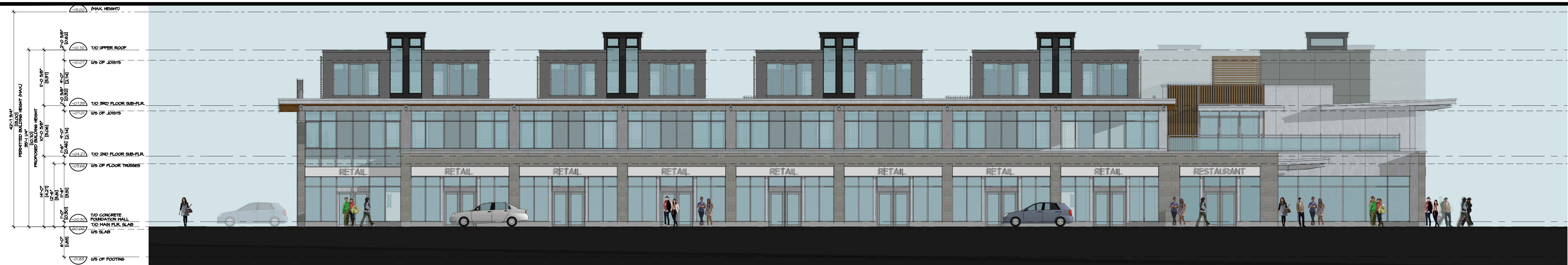
1 NORTH (FRONT 1) ELEVATION SCALE: 1:125