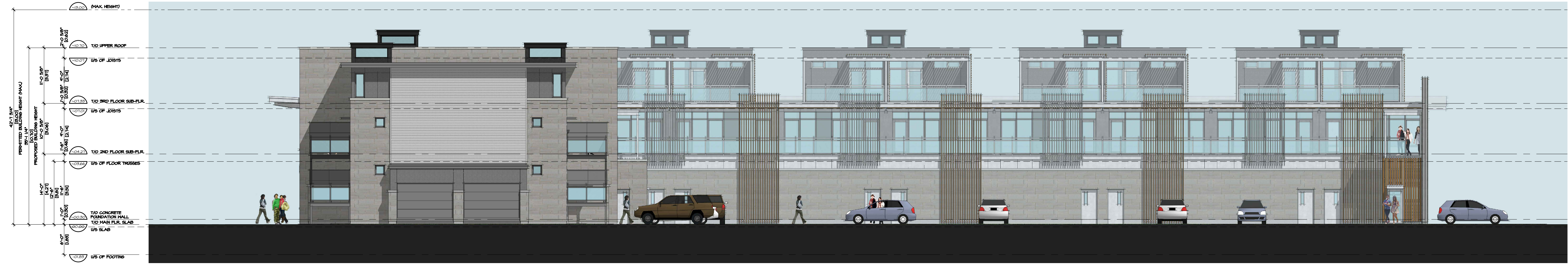
3 SOUTH (REAR) ELEVATION SCALE: 1:125