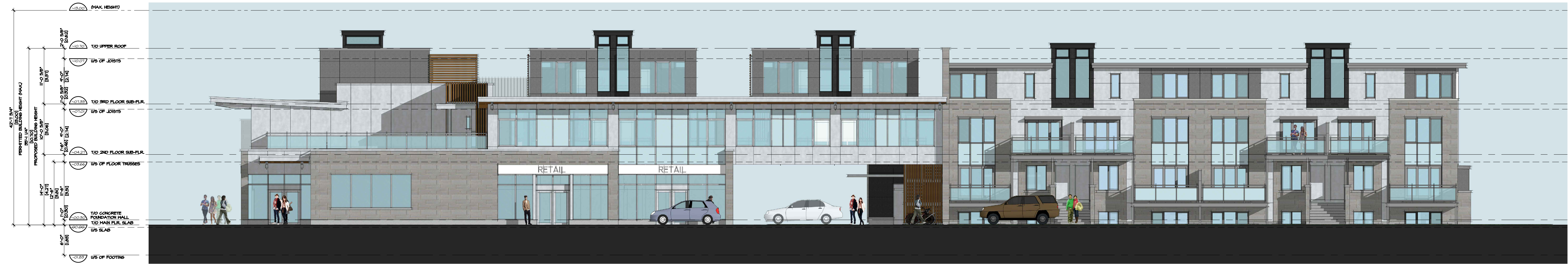
2 WEST (FRONT 2) ELEVATION SCALE: 1:125