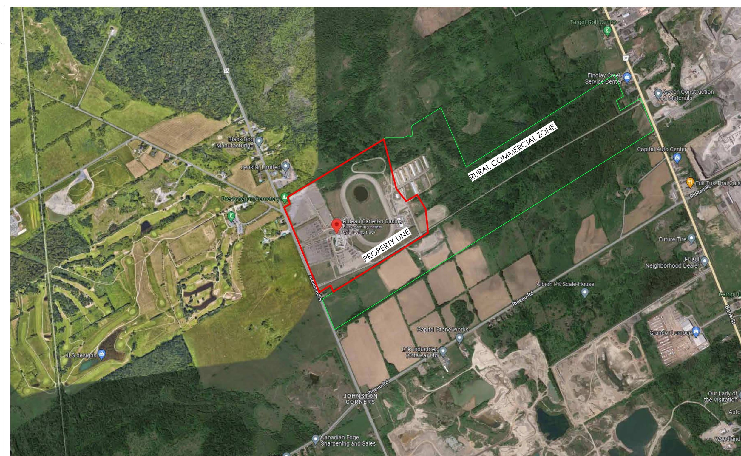
ARIEL VIEW OF SITE - 4837 ALBION RD S, GLOUCESTER, ON K1X 1A3