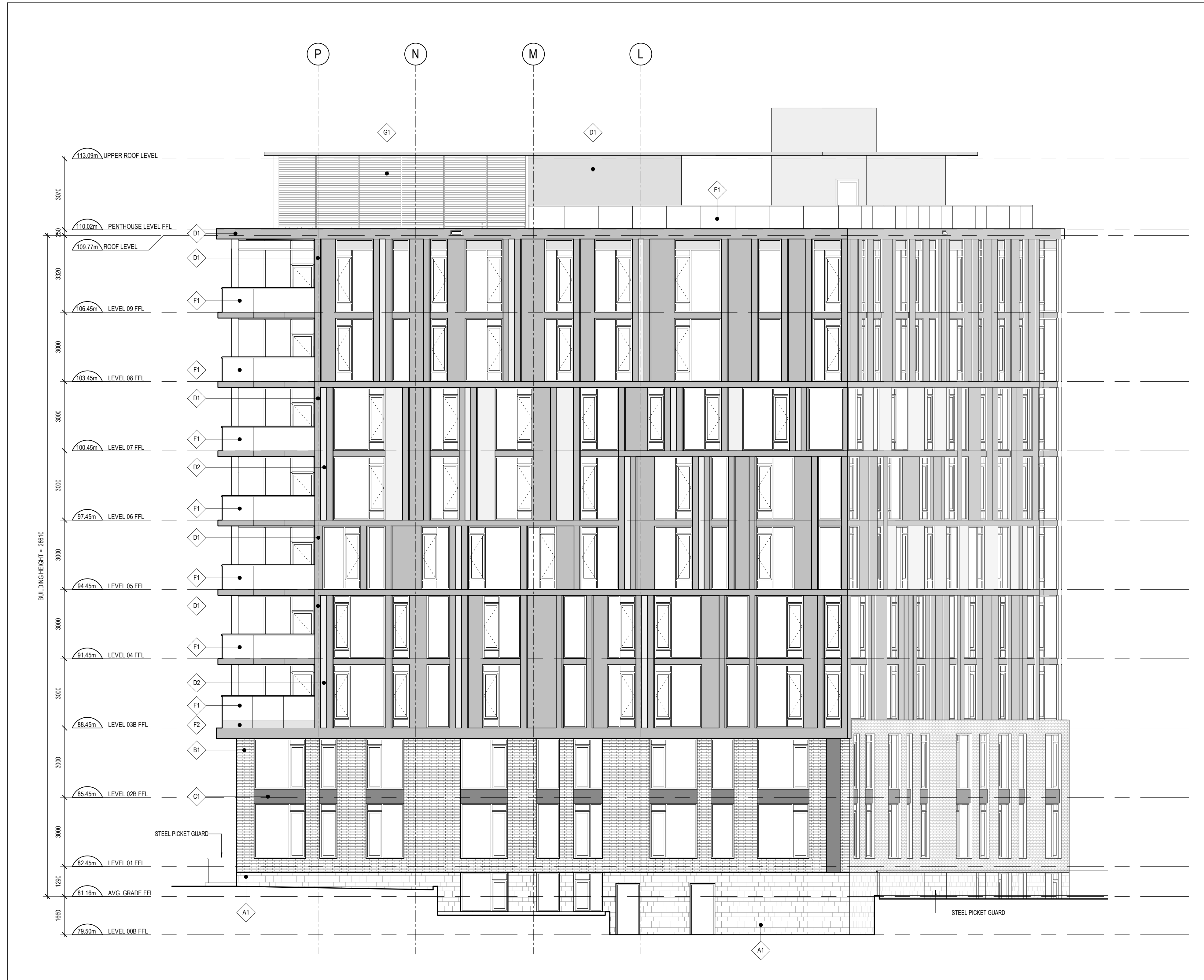
1 NORTH ELEVATION A203 SCALE: 1 : 100

GENERAL ARCHITECTURAL NOTES: This drawing is the property of the Architect and may not be reproduced or used without the expressed consent of the Architect. Drawings are not to be scaled. The Contractor is responsible for checking and verifying all levels and dimensions and shall report all discrepancies to the Architect and obtain clarification prior to commencing work. Upon notice in writing, the Architect will provide written clarification or supplementary information regarding the intent of the Contract Documents. The Architectural drawings are to be read in conjunction with all other Contract Documents including Project Manuals and the Structural, Mechanical and Electrical Drawings. Positions of exposed or finished Mechanical or Electrical devices, fittings and fixtures are indicated on the Architectural Drawings. Locations shown on the Architectural Drawings shall govern over Mechanical and Electrical Drawings. Mechanical and Electrical items not clearly located will be located as directed by the Architect. These documents are not to be used for construction unless specifically noted for such purpose.