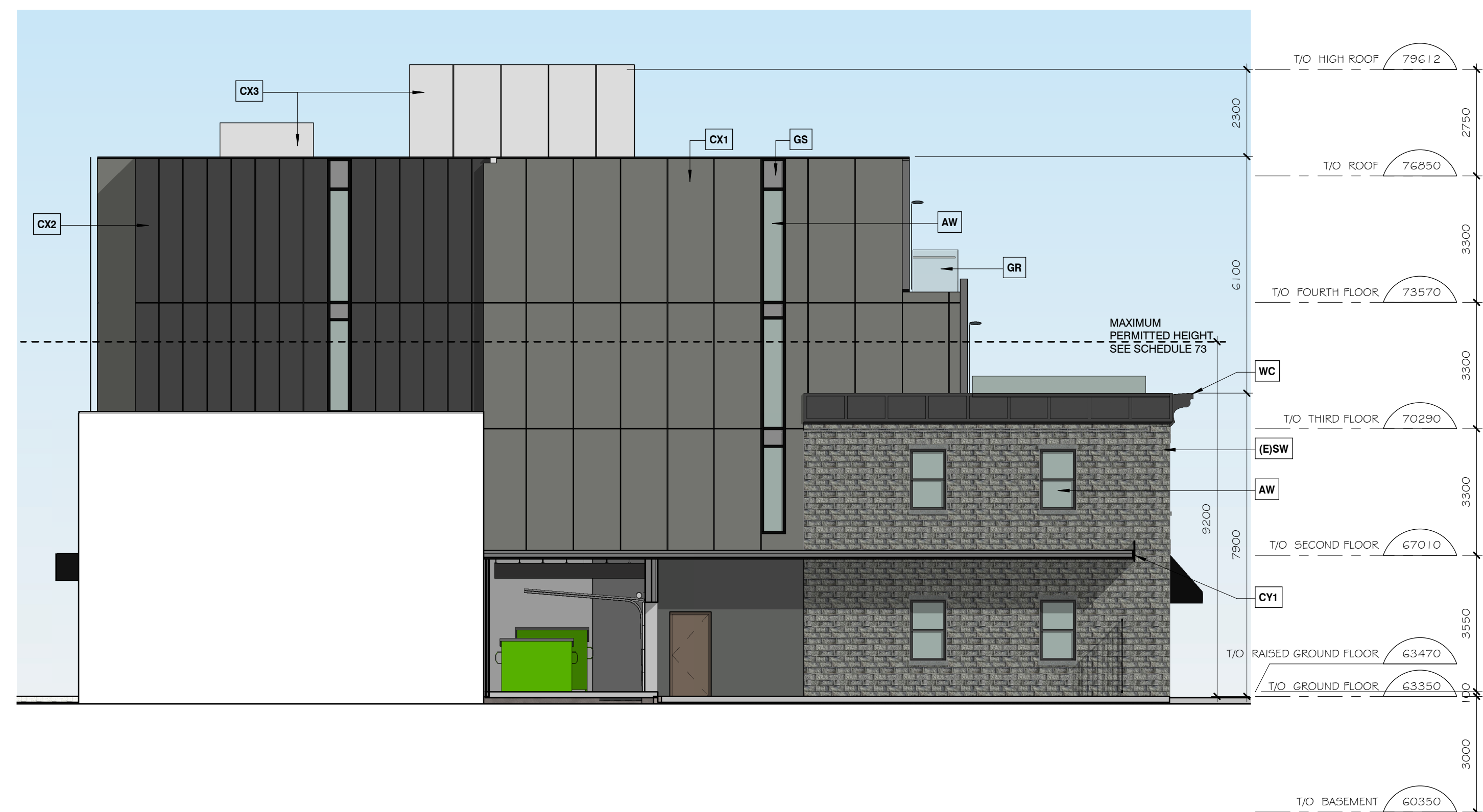
2 NORTH ELEVATION A012 SCALE 1 : 100