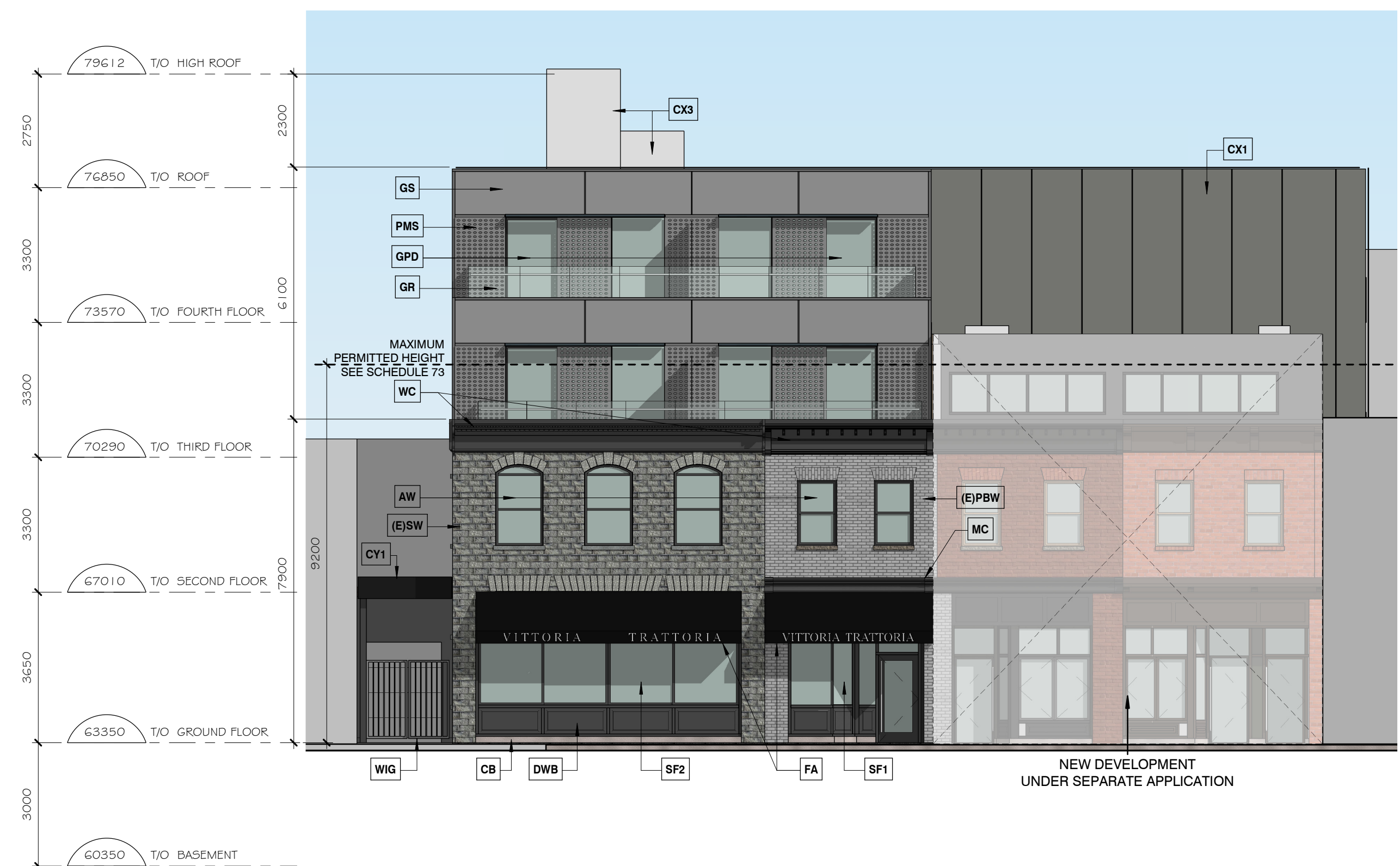
1 WEST ELEVATION A012 SCALE 1 : 100