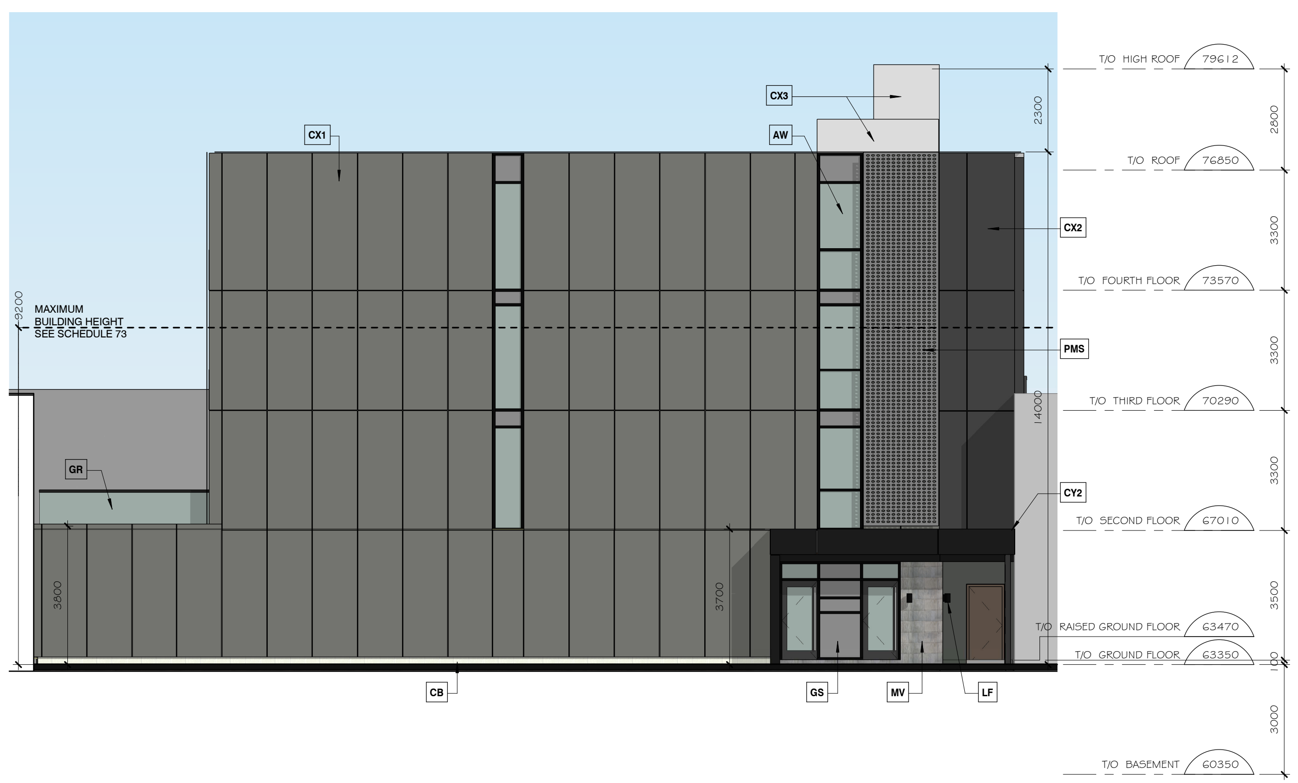
3 EAST ELEVATION A012 SCALE 1 : 100