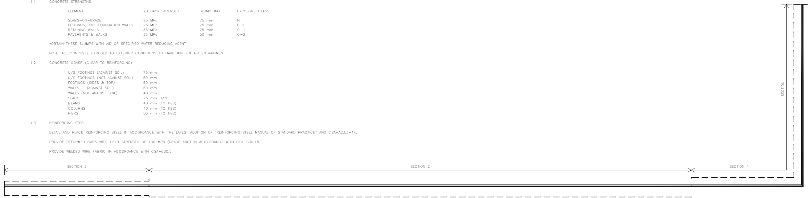
RETAINING WALL PLAN