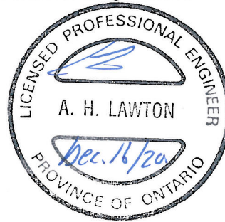
Mechanical Engineer's Seal

S1. The design parameters incorporated into the overall structural design are consistent with the information provided by the Mechanical Engineer in M2. Loads due to rain are not considered to act simultaneously with loads due to snow as per Sentence 4.1.7.3 (3) OBC.