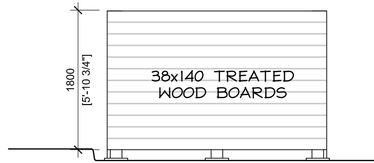
WEST (EAST/NORTH SIM) ELEVATION

ISSUED TO PLANNING DEPARTMENT 06 JUNE 2022